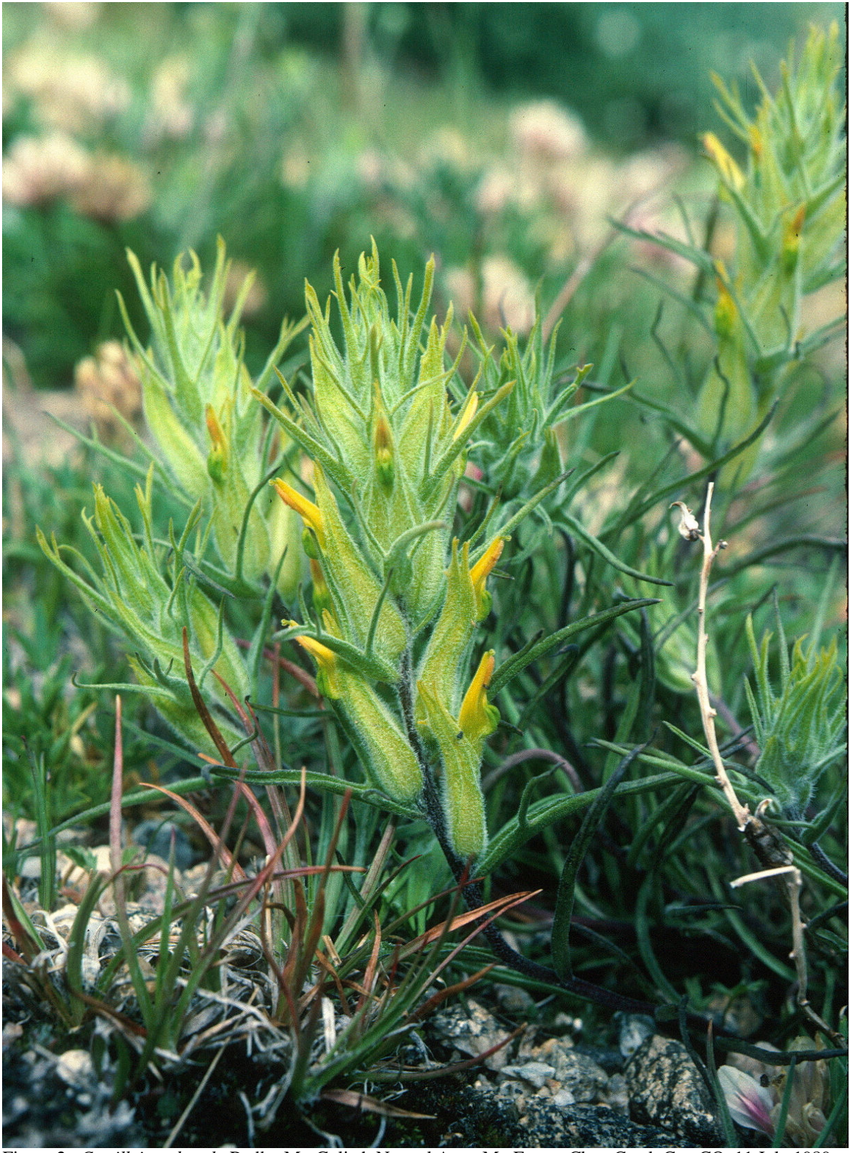
Figure 2. Castilleja puberula Rydb., Mt. Goliath Natural Area, Mt. Evans, Clear Creek Co., CO, 11 July 1989, M. Egger 272 , WTU.