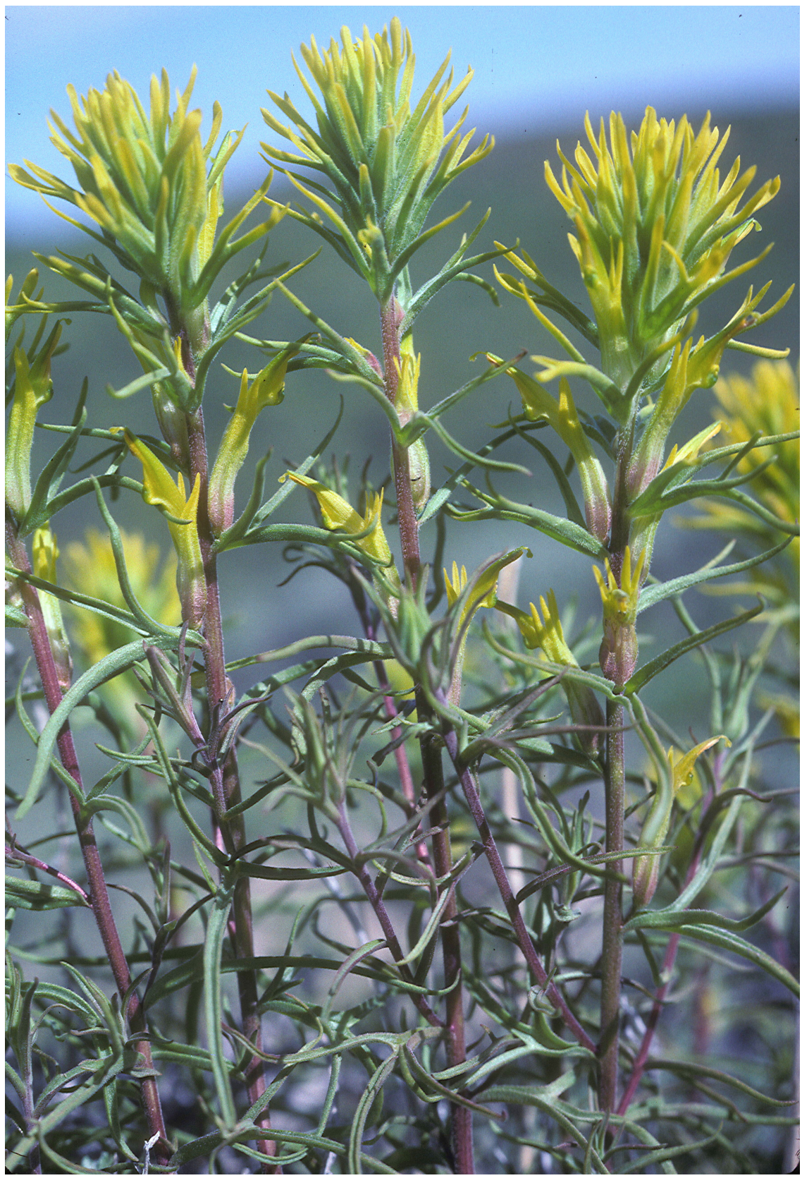
Figure 3. Castilleja flava var. flava , Angel Lake Road, East Humboldt Range, Elko Co., NV, 27 Jun 1995, M. Egger 688 , WTU.