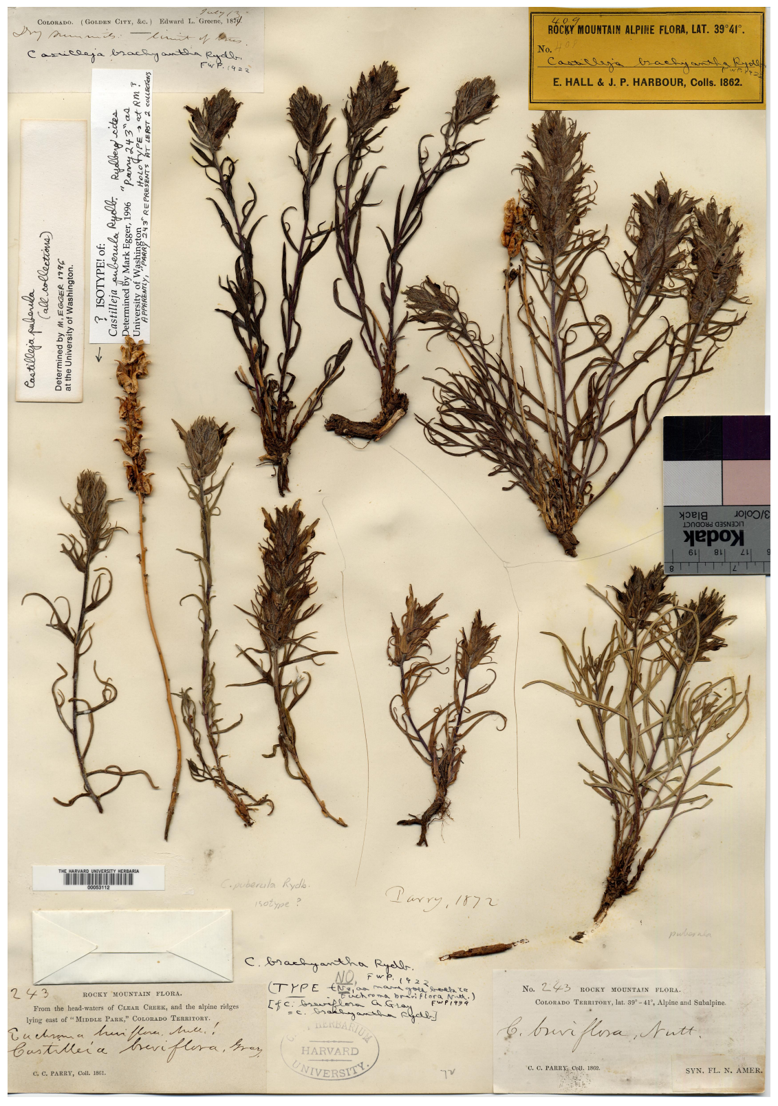
Figure 1. Mixed sheet at GH containing several collection of Castilleja puberula , including both an isotype of C. puberula Rydb. and a syntype of C. breviflora A. Gray. Note that both my annotation from 1996 and some of those by others are not fully accurate and that only the stems in the lower left obtained by Parry in 1861 actually represent Parry 243 .