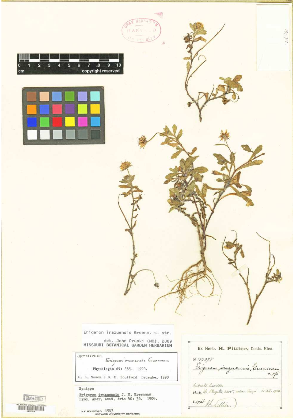
Figure 2. Holotype of Erigeron irazuensis (GH).