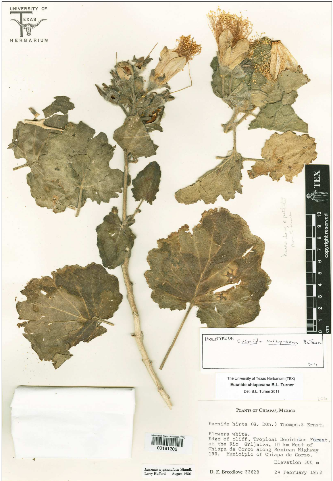
Figure 1. Eucnide chiapasana B.L. Turner (holotype, TEX).