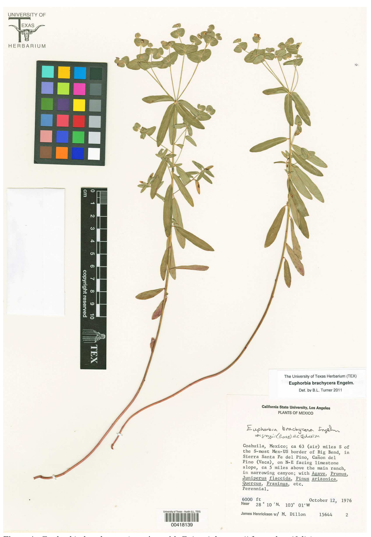
Figure 4. Euphorbia brachycera (growing with E. ivanjohnstonnii forma longifolia).