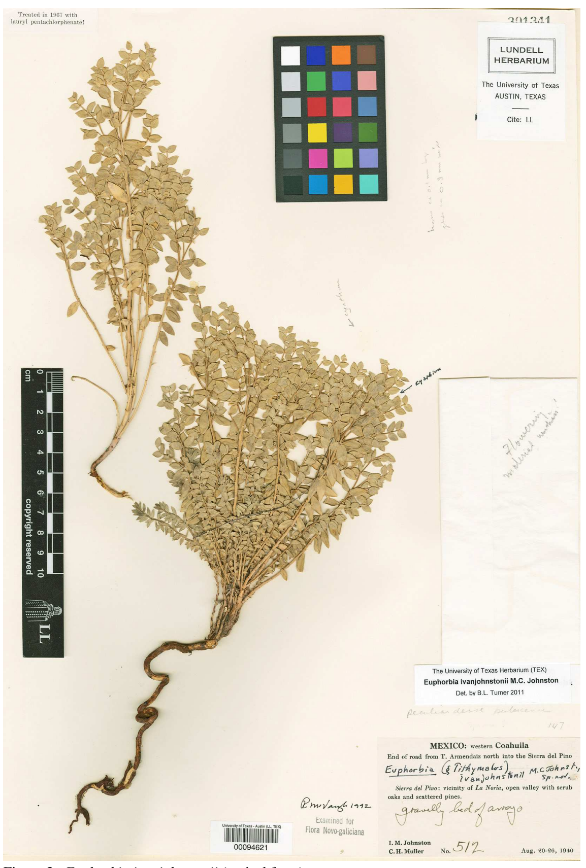
Figure 3. Euphorbia ivanjohnstonii (typical form).