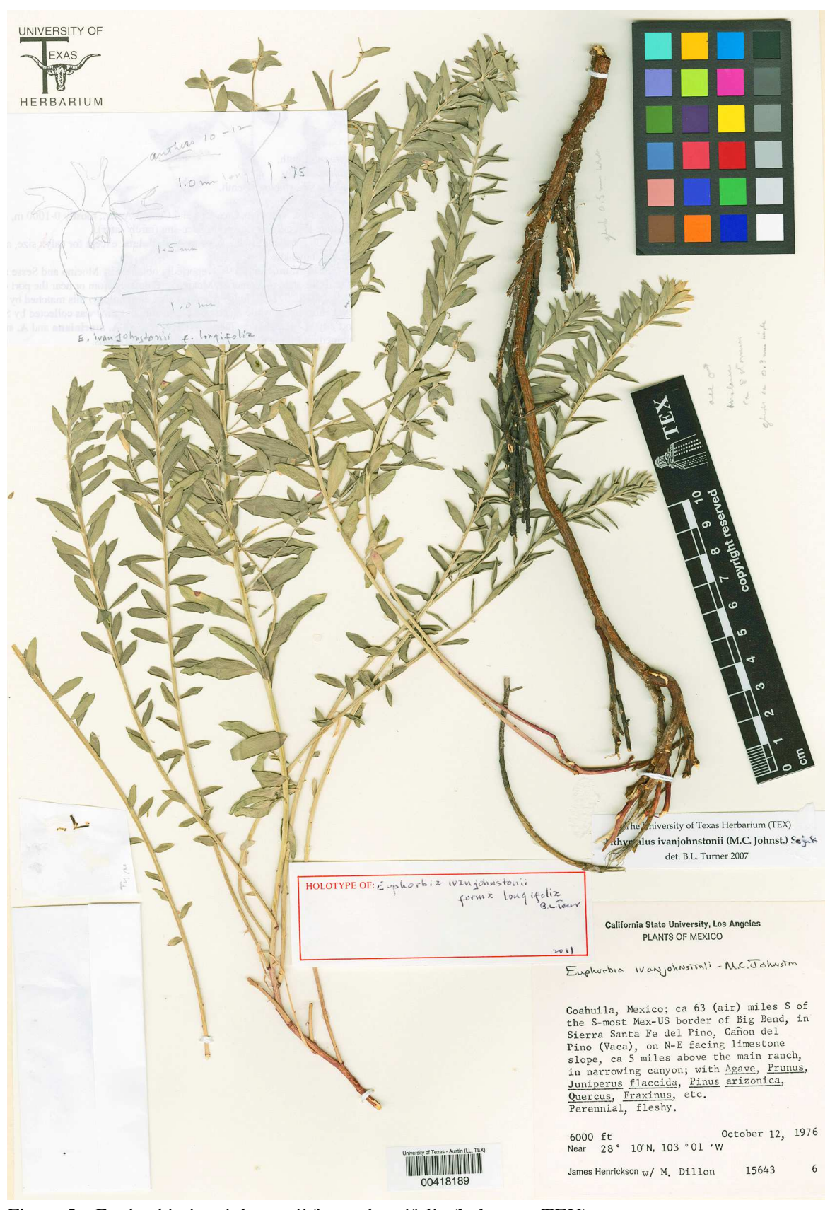
Figure 2. Euphorbia ivanjohnstonii forma longifolia (holotype: TEX).