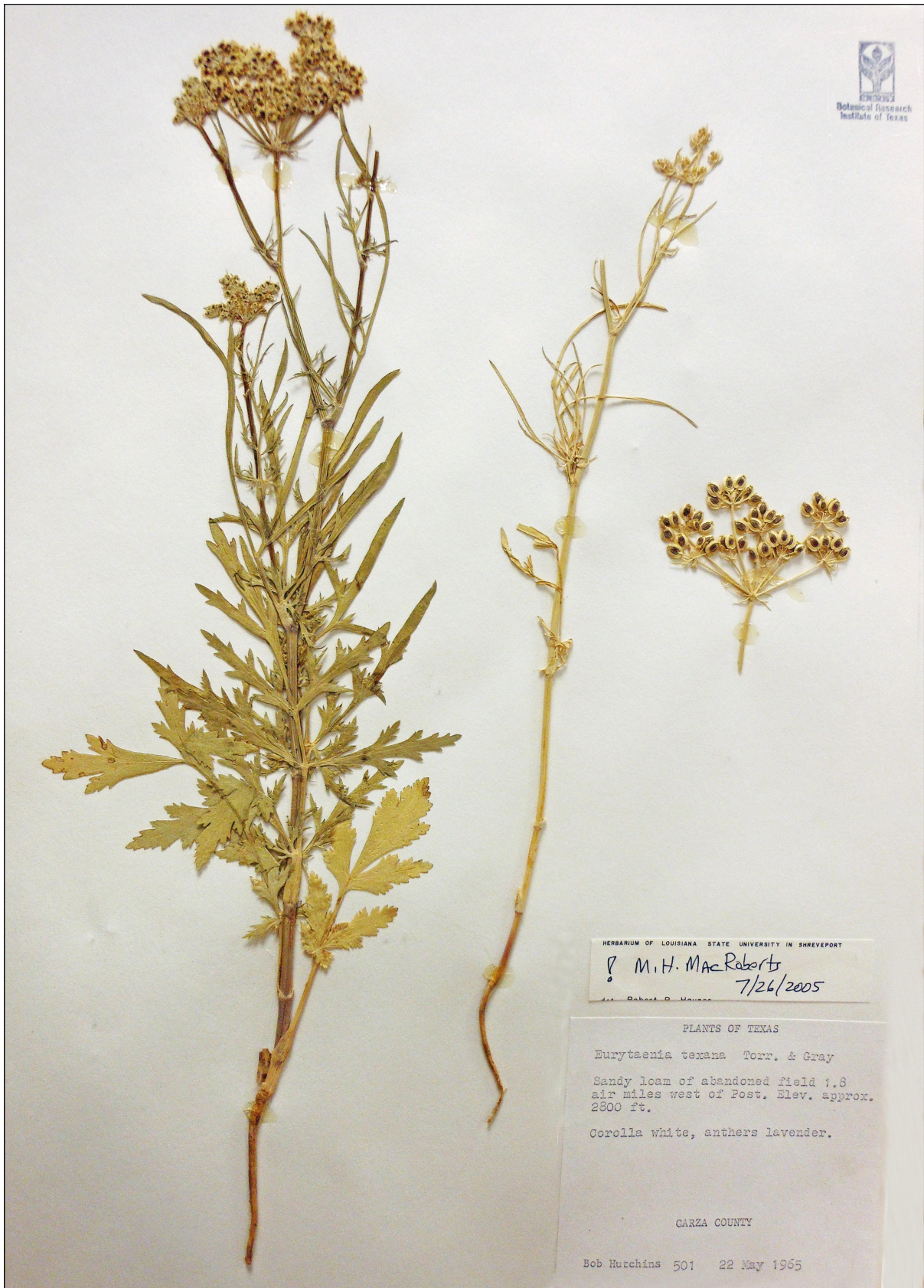
Figure 4. Representative plant of Eurytaenia texana . Garza County, Texas.