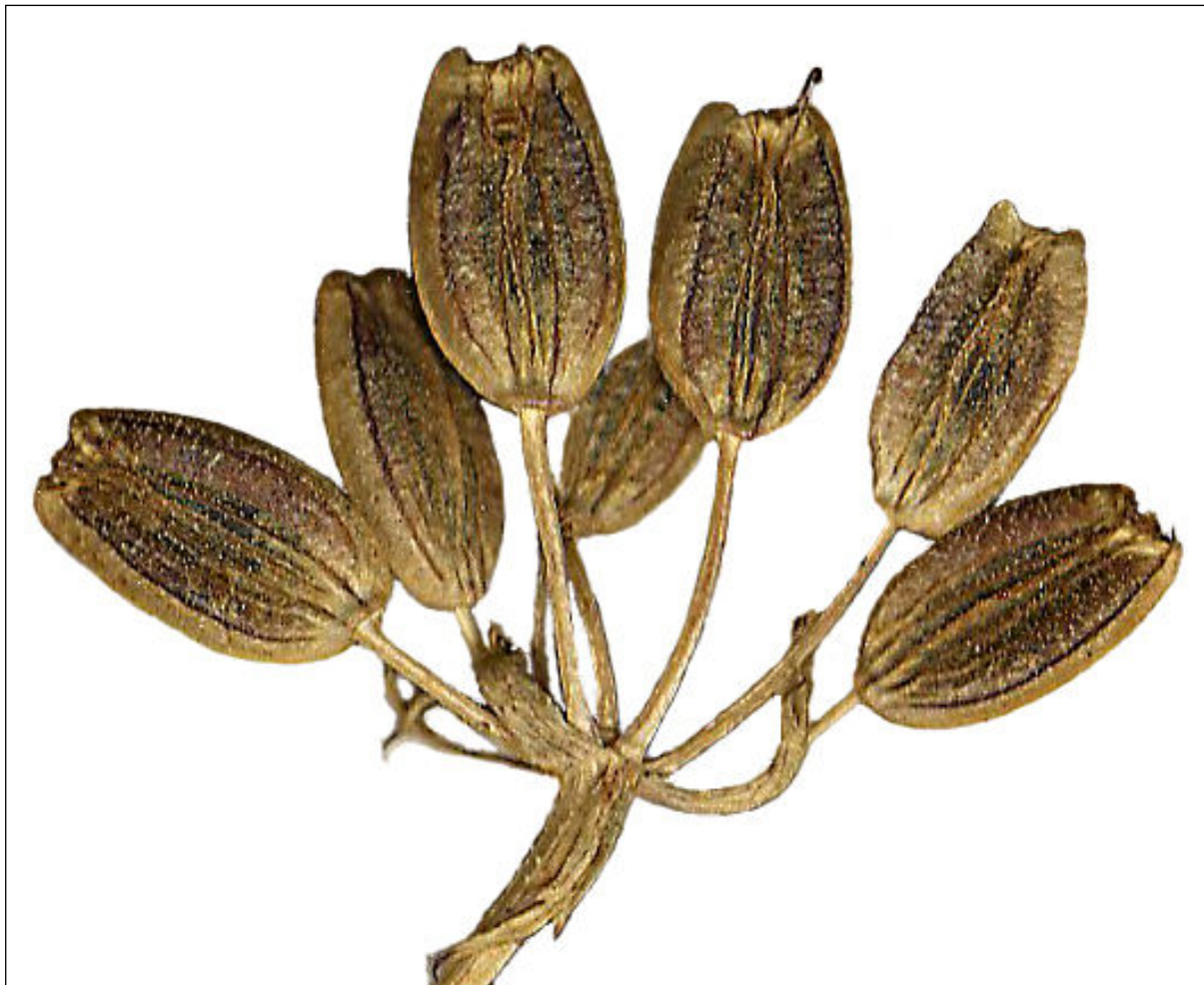
Figure 2. Umbellule of schizocarps of Eurytaenia hinckleyi . From MO isotype.