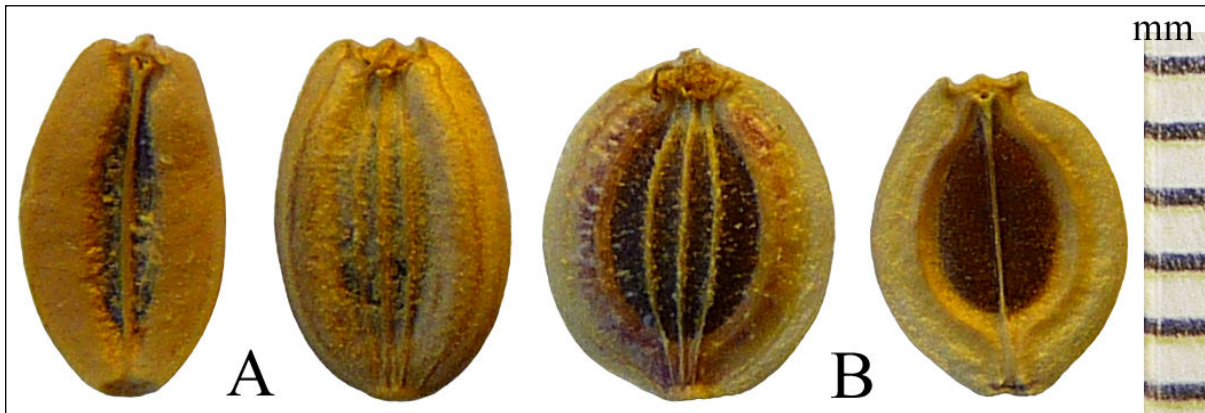
Figure 1. Mericarps of Eurytaenia hinckleyi (A) and E. texana (B), dorsal and commissural faces.

Although the mericarp differences show only relatively late in ontogeny, it often is possible to see the developing distinction soon after anthesis. In Eurytaenia texana development of the lateral wings is simultaneous at all points from the base to apex. In Eurytaenia hinckleyi the thickening begins at the apex (at the mericarp shoulders) and proceeds basipetally.