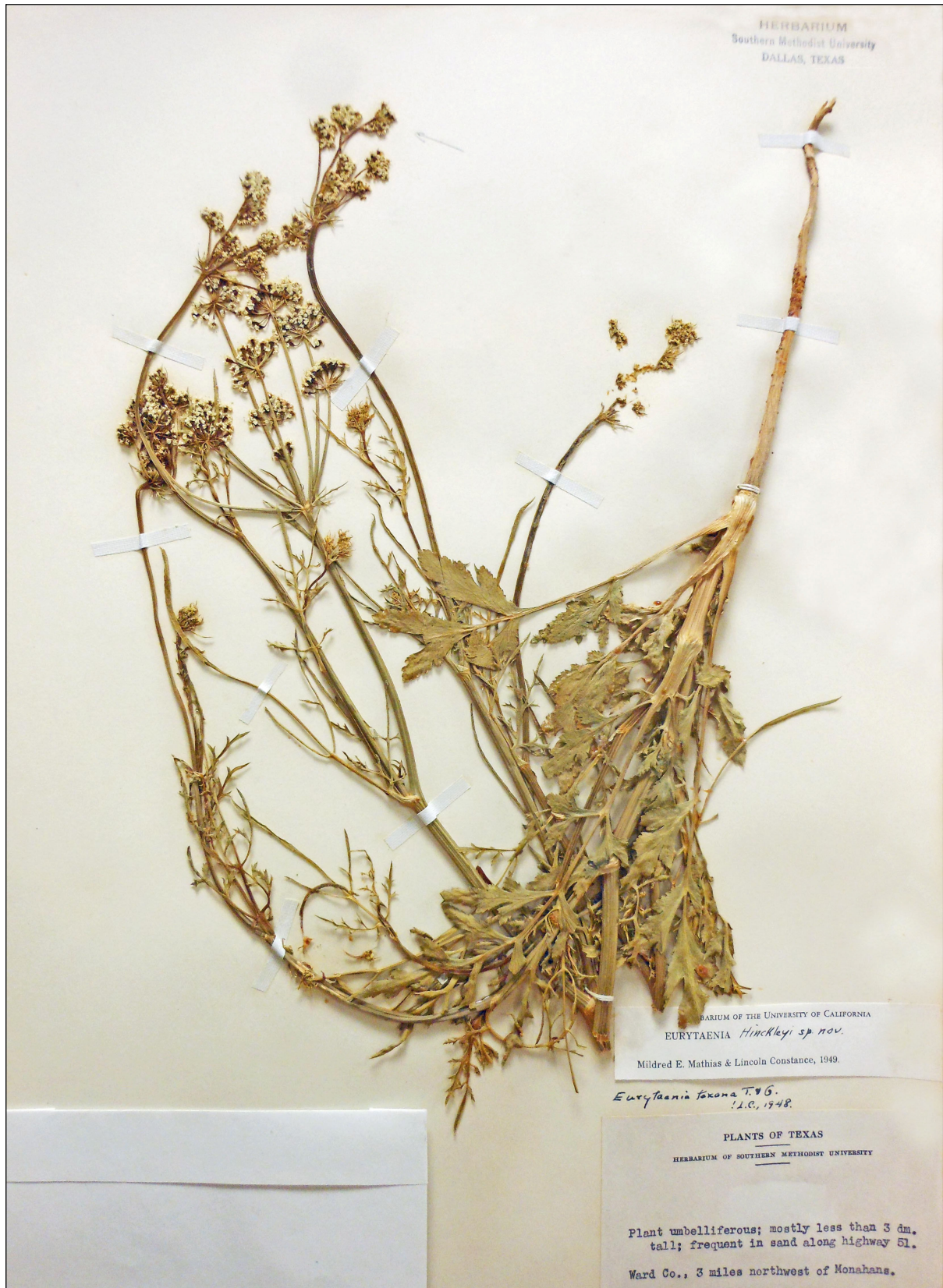
Figure 5. Representative plant of Eurytaenia hinckleyi . Ward County, Texas.