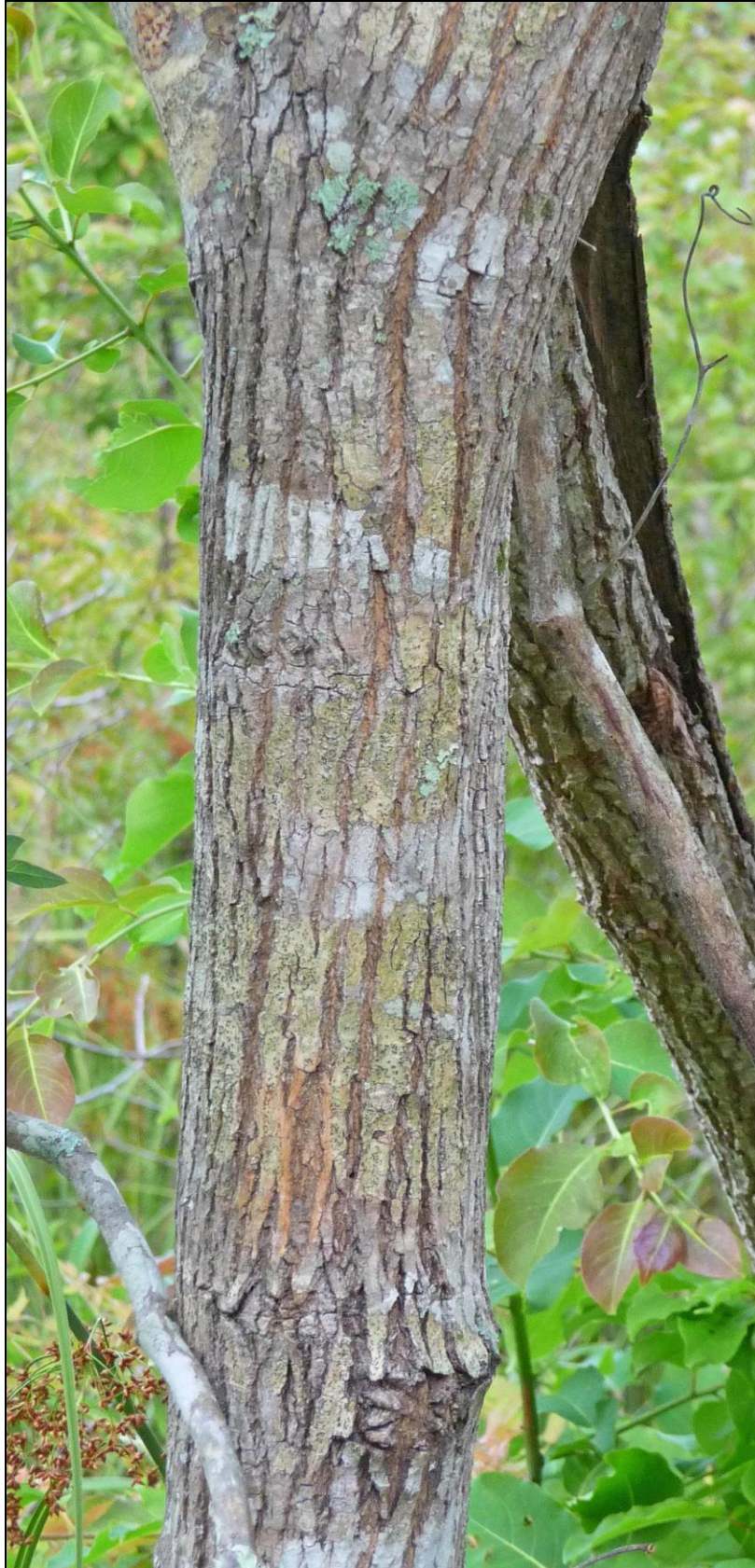
Figure 9. Fraxinus pauciflora , St. Marks National Wildlife Refuge, Wakulla Co., Florida.