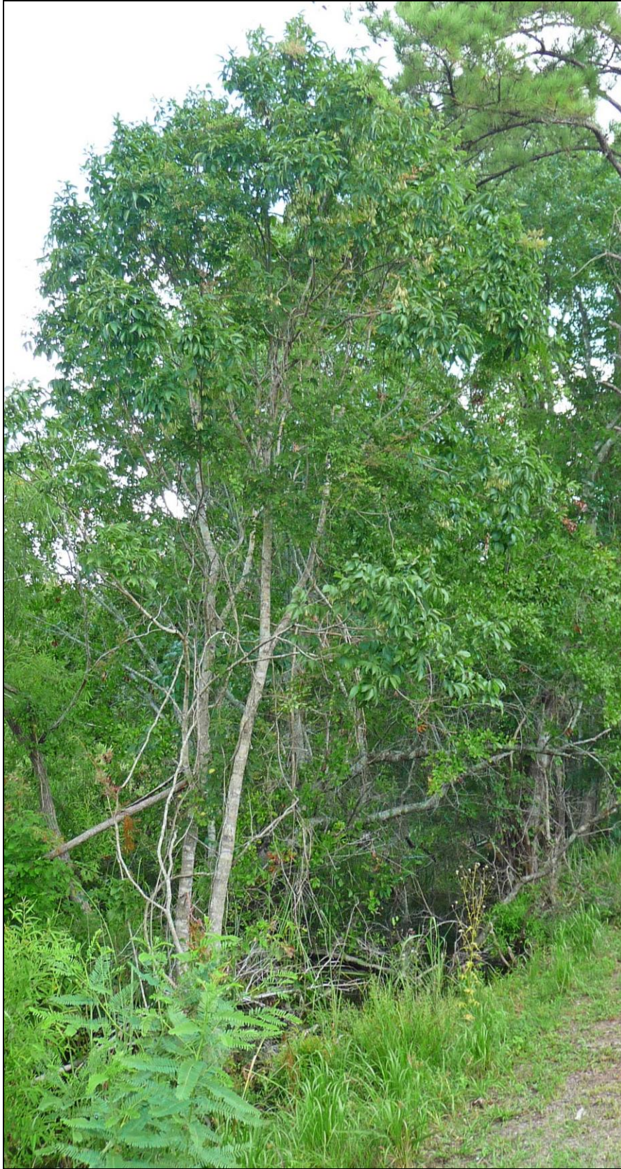
Figure 12. Fraxinus pauciflora , St. Marks National Wildlife Refuge, Wakulla Co., Florida.