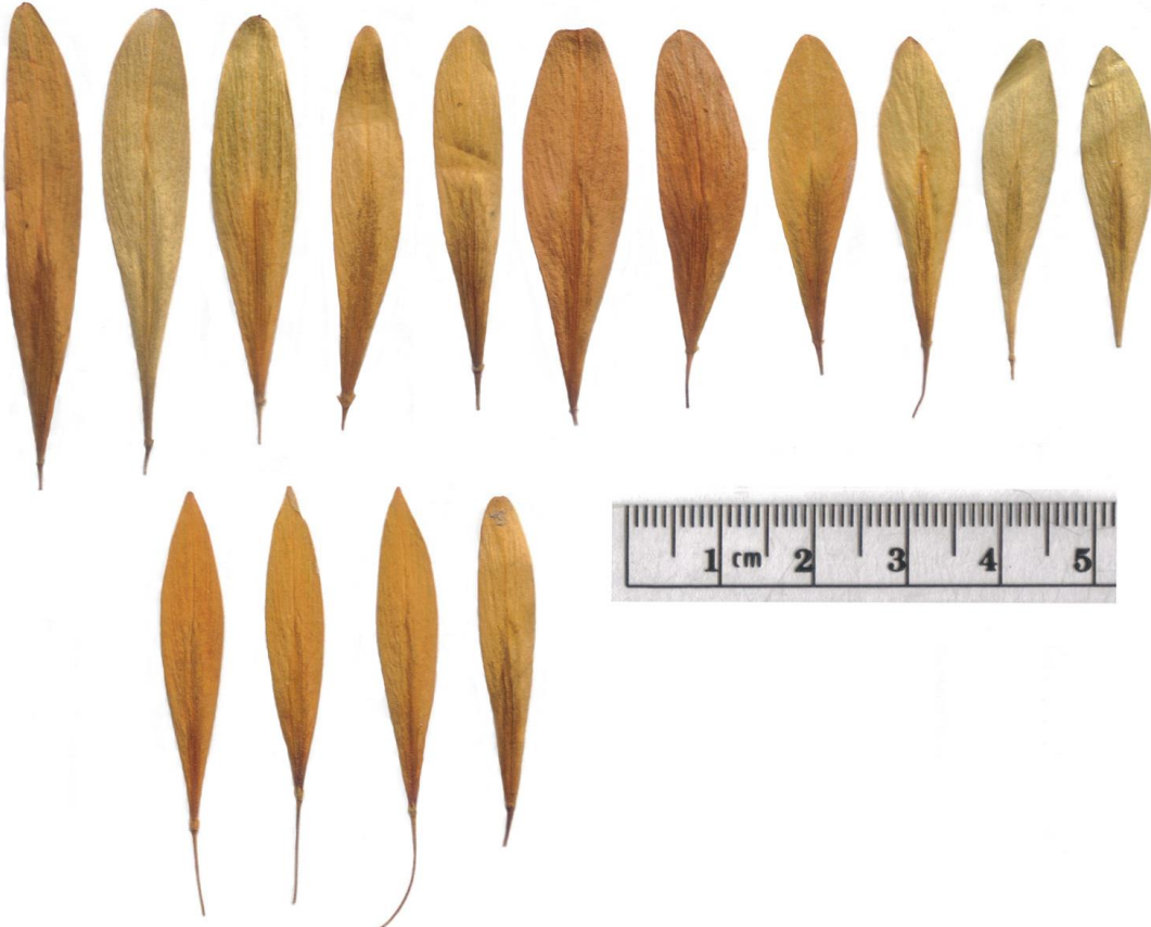
Figure 4. Representative samaras of Fraxinus cubensis .