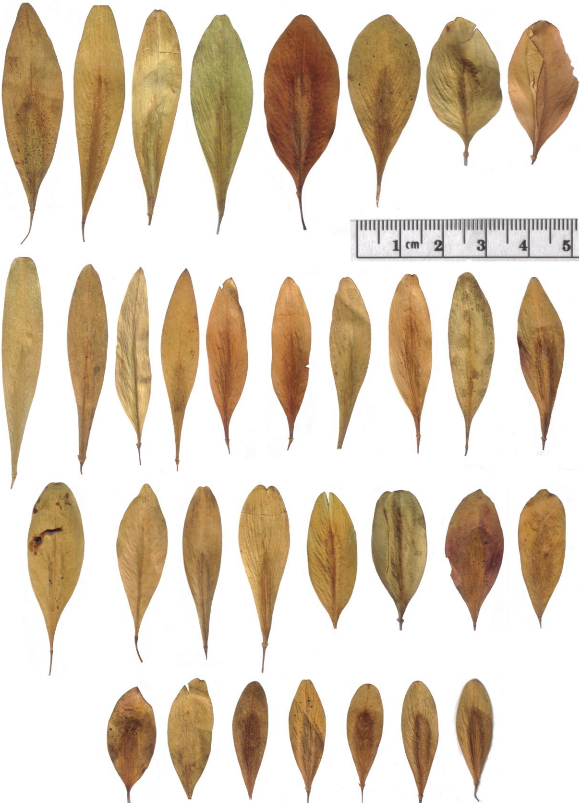
Figure 5. Representative samaras of Fraxinus caroliniana .