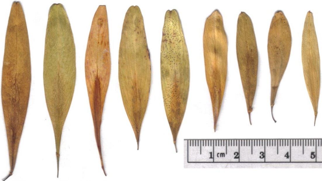
Figure 3. Representative samaras of Fraxinus pauciflora .