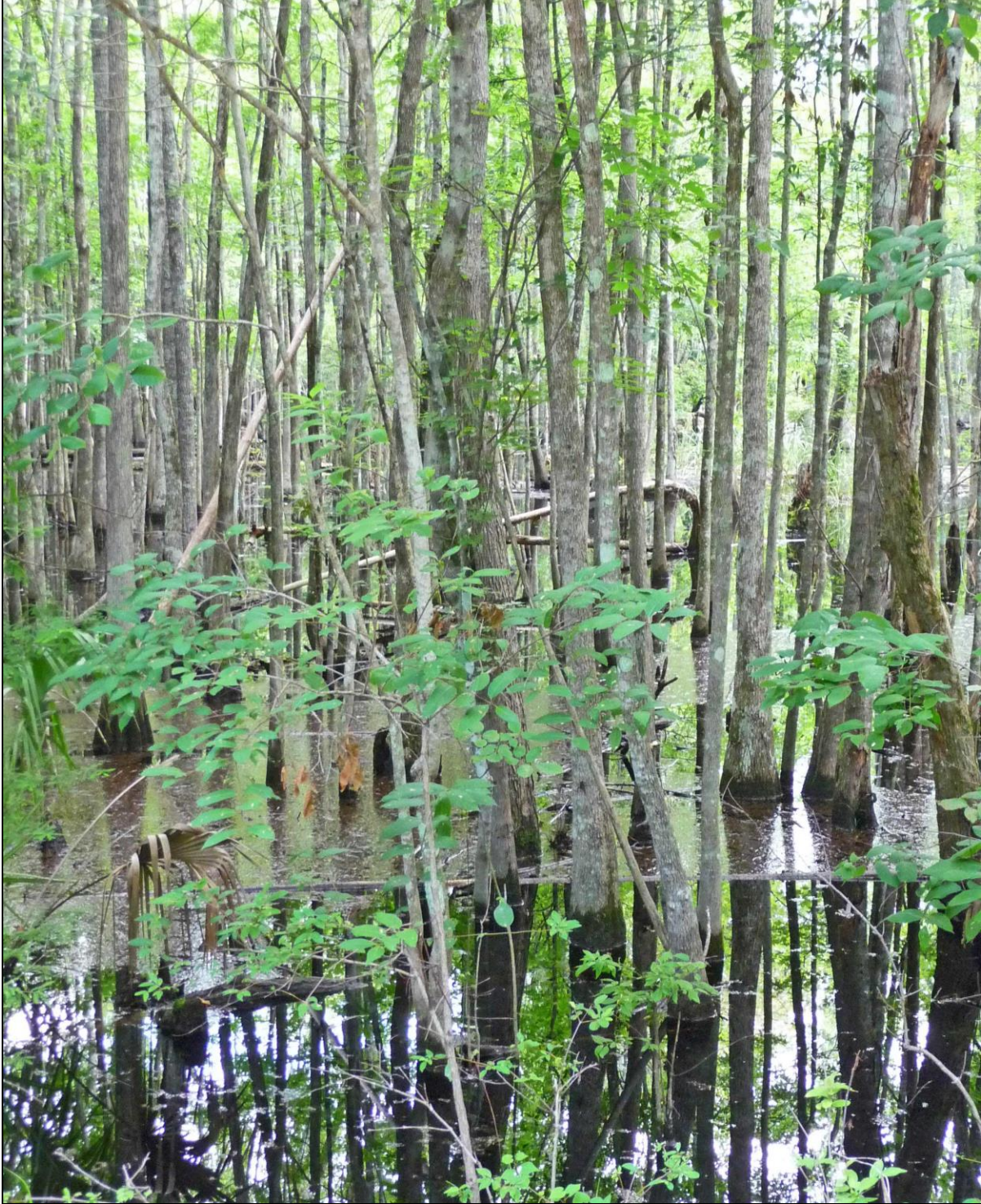
Figure 6. Fraxinus pauciflora from a swamp in the St. Marks National Wildlife Refuge, Wakulla Co., Florida. The ash is a dominant component of the woody swamp flora here. Figs. 6-13 photos, 13 July 2010, by Guy Nesom.