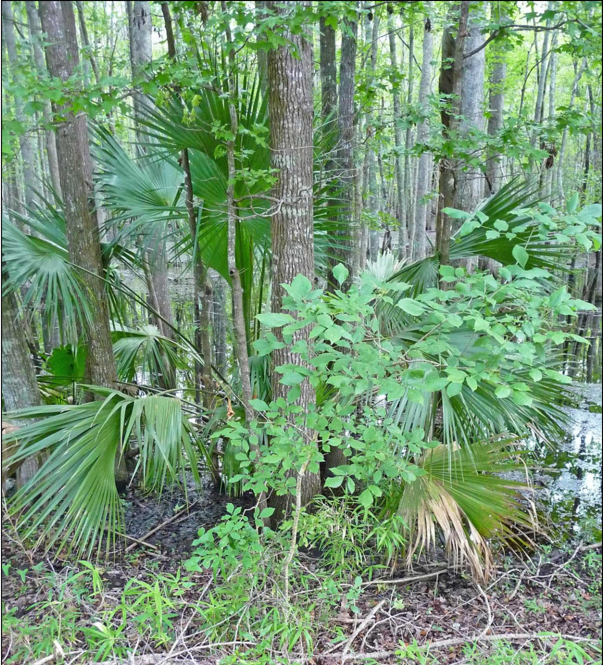
Figure 7. Fraxinus pauciflora , St. Marks National Wildlife Refuge, Wakulla Co., Florida.