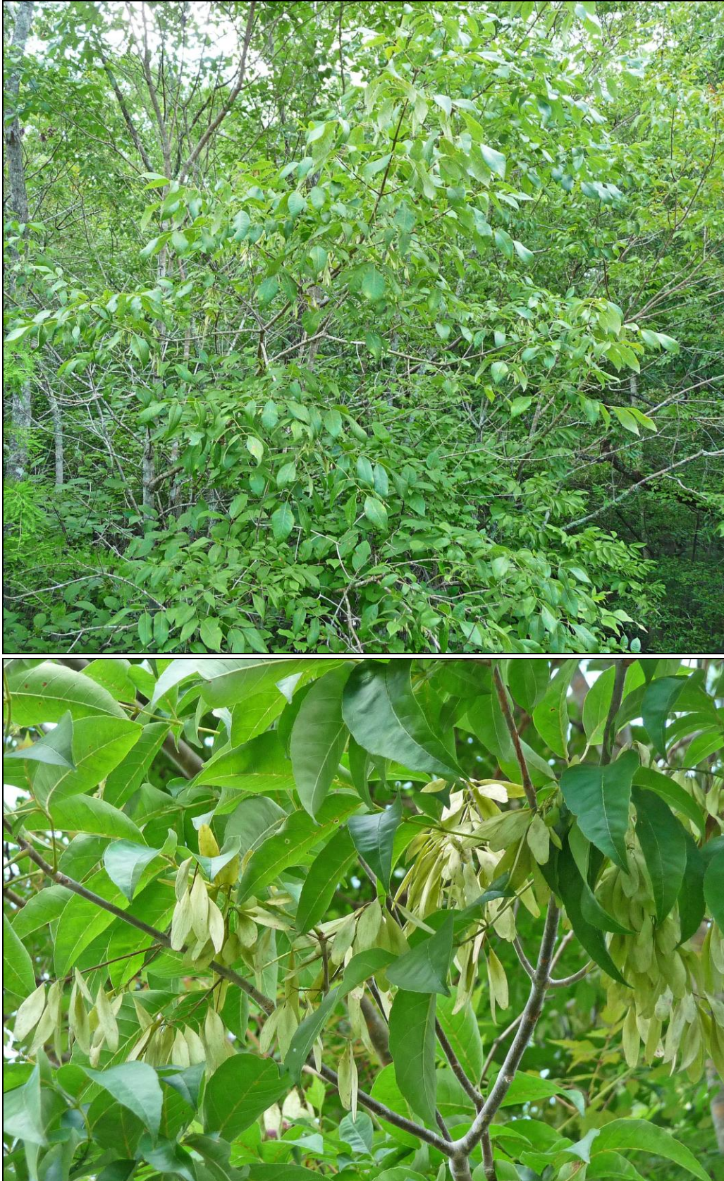
Figure 13. Fraxinus pauciflora , St. Marks National Wildlife Refuge, Wakulla Co., Florida.