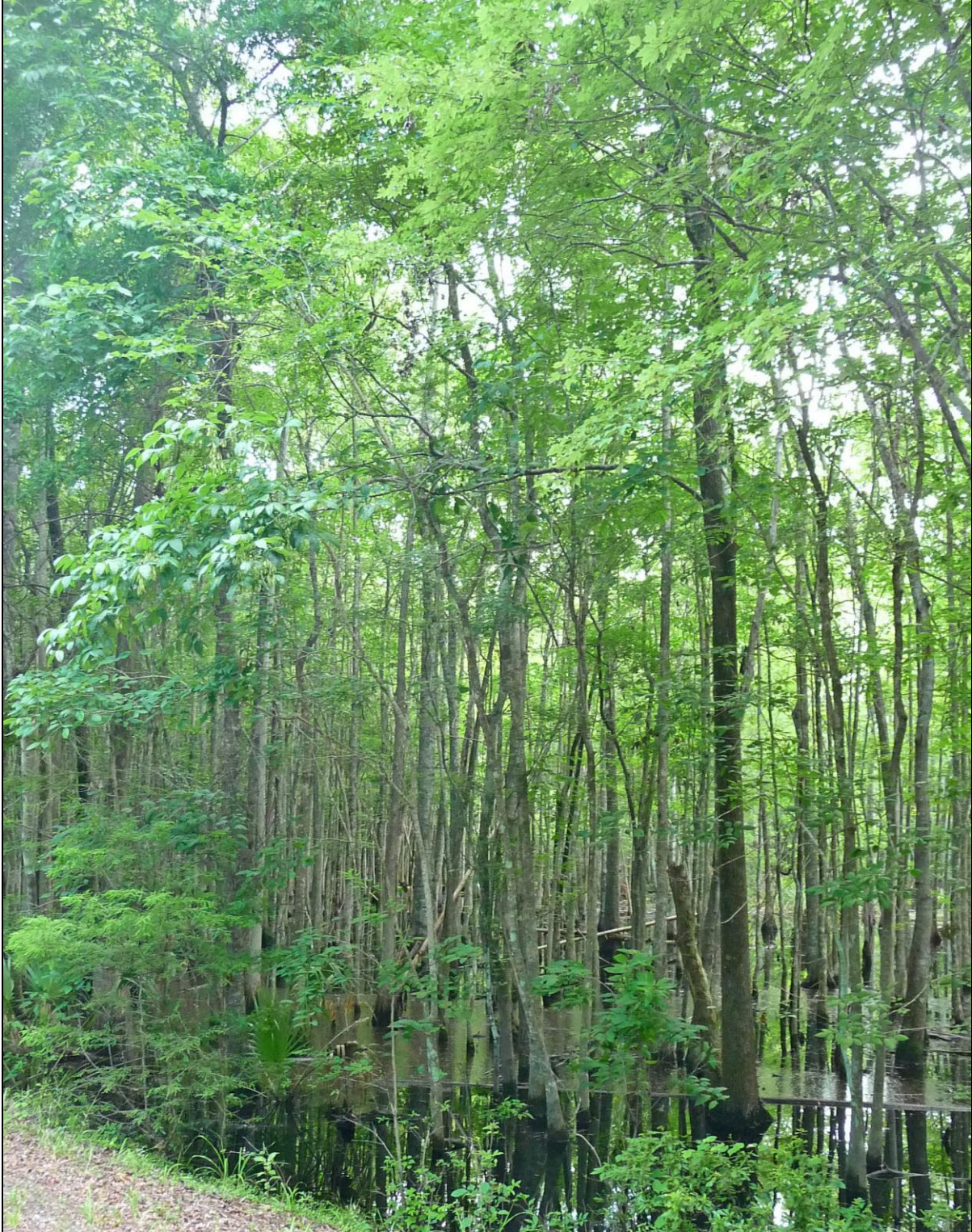
Figure 8. Fraxinus pauciflora , St. Marks National Wildlife Refuge, Wakulla Co., Florida.