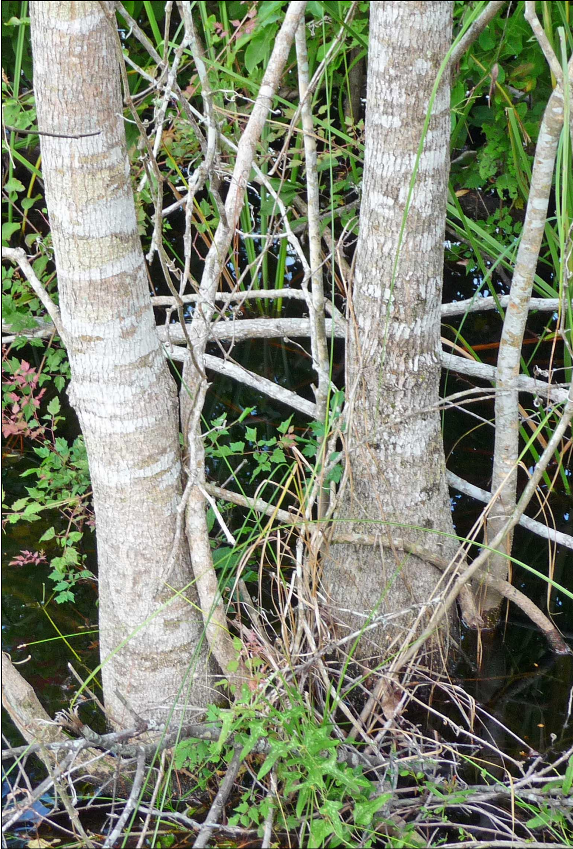
Figure 10. Fraxinus pauciflora , St. Marks National Wildlife Refuge, Wakulla Co., Florida.