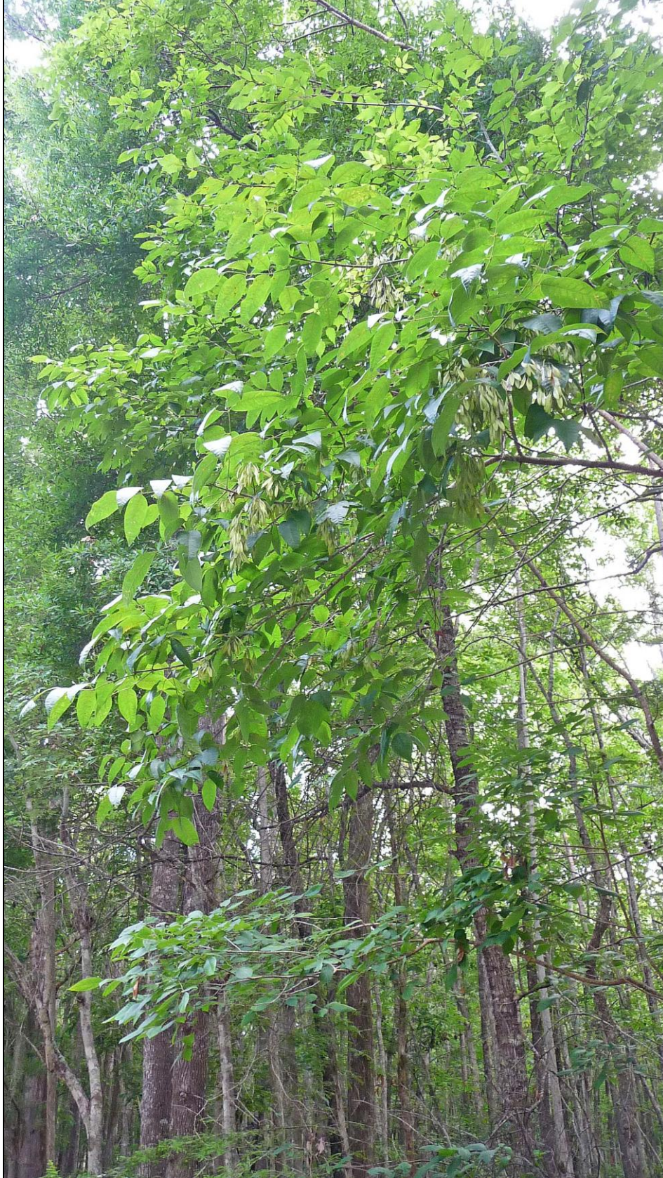
Figure 11. Fraxinus pauciflora , St. Marks National Wildlife Refuge, Wakulla Co., Florida.