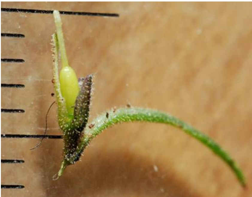
Figure 7. A young capsule and style. Styles grow to about 3.5 mm long and capsules to 5–6 mm long. Notice the glandularity on both the calyx lobe and the bractlike leaf.