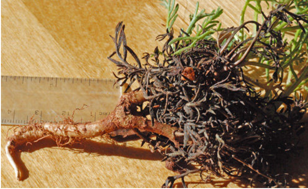
Figure 5. Tap roots are up to 24 cm long and are topped by a caudex (shown branched here) up to 6 cm long. Basal leaves are withered at anthesis.