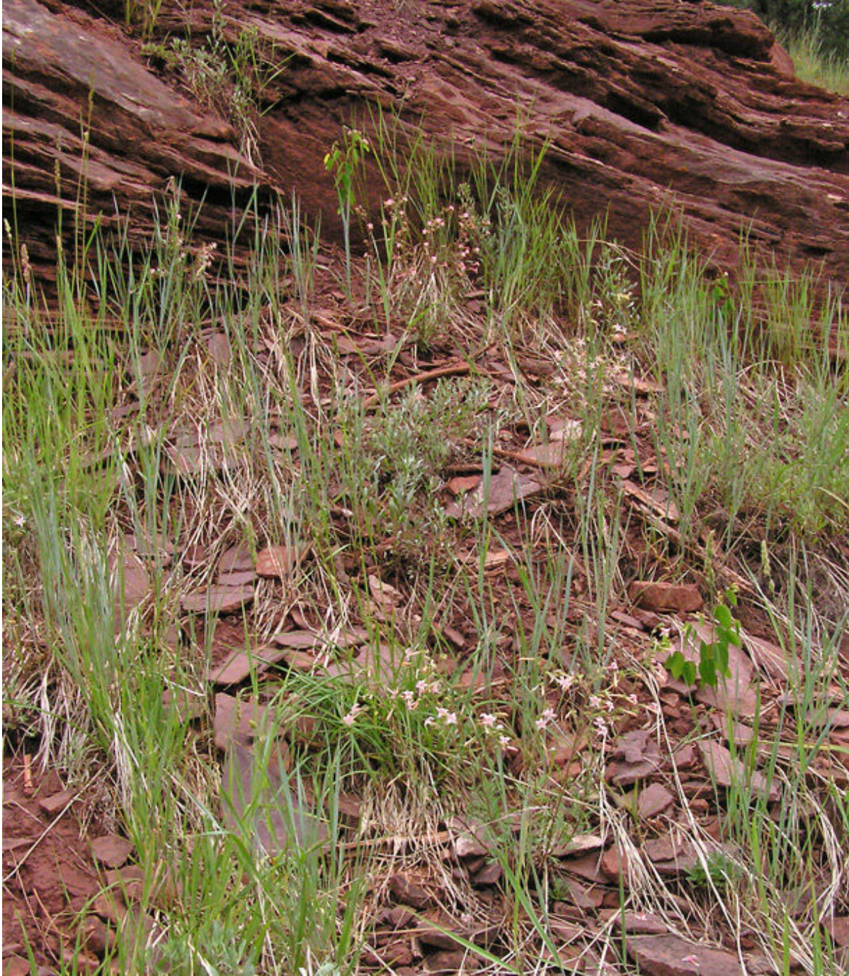
Figure 2. Typical rocky, steep, mountainside habitat and typical spacing for Ipomopsis ramosa in the Roaring Fork Canyon, the type locality.