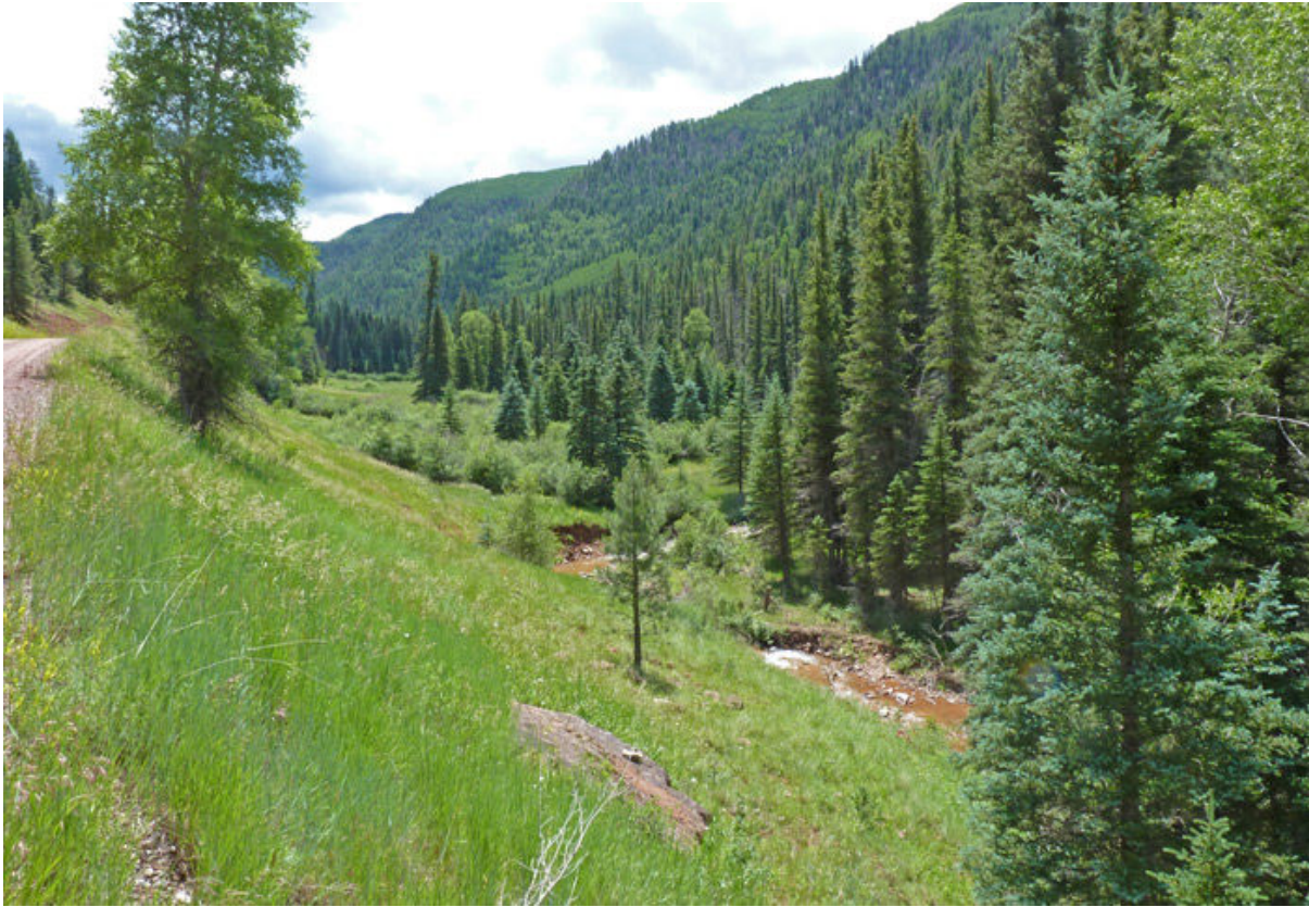
Figure 1. High above the Roaring Fork Creek, the road climbs 1500 feet along the canyon walls which are the type locale for Ipomopsis ramosa . The plant is found intermittently along the first 5 miles of the road as it climbs eastward from Colorado Highway 145.