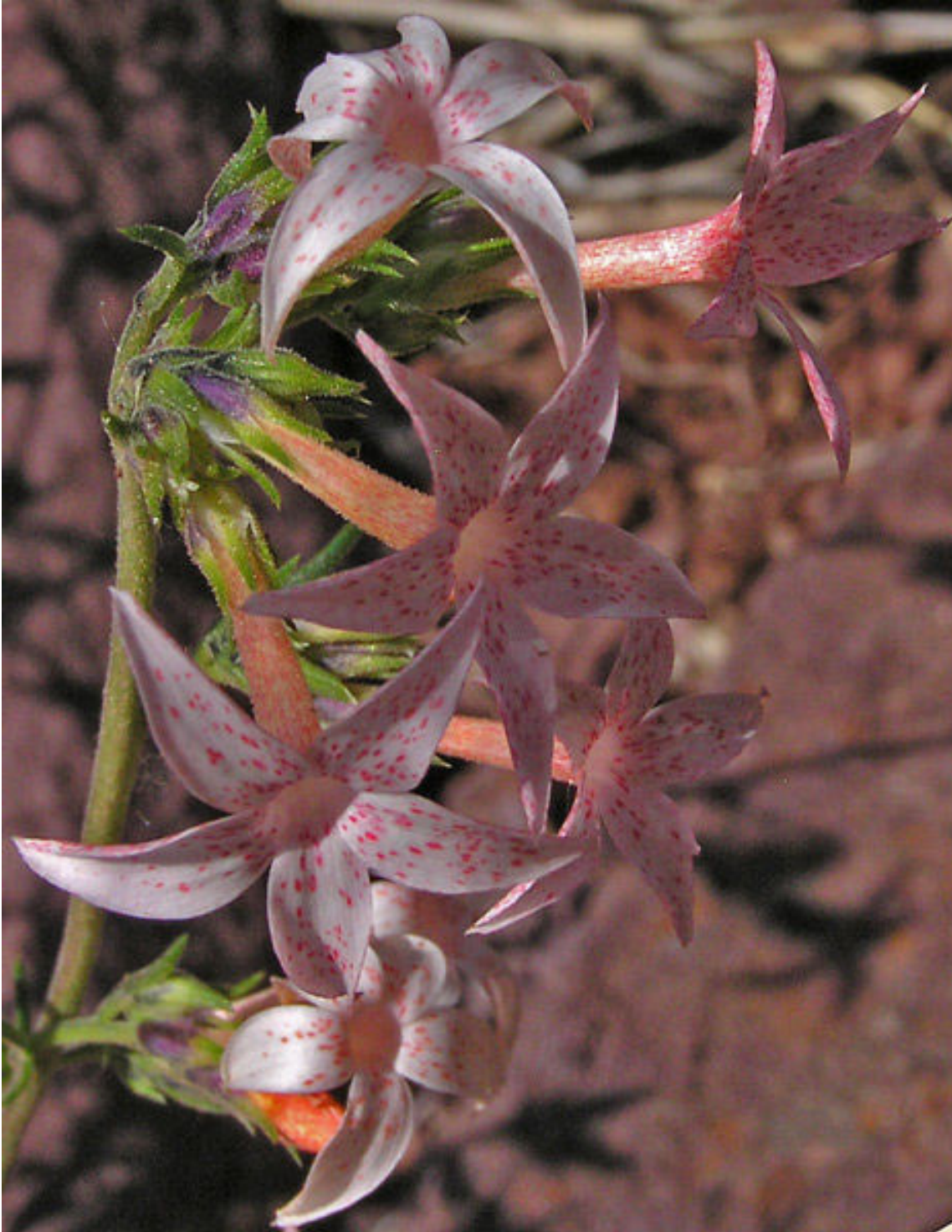
Figure 4. Corollas are slightly translucent; tubes are 14–17 mm long, 1 mm wide at their base inside the calyx, and 2 mm wide at the orifice where the lobes flair; tubes are heavily striped coral pink; lobes are 8 mm long, recurved, coral-pink dotted on the ventral surface, and more heavily coral-pink streaked on the dorsal surface. From a distance, the corollas appear salmon or orange, but a close-up examination shows them to be coral pink and white. The center area of the tube may appear yellow but that is due to the translucency that allows the yellow anther color to show through. Calyces are strongly multi-colored and, consistent with the rest of the plant, strongly glandular.