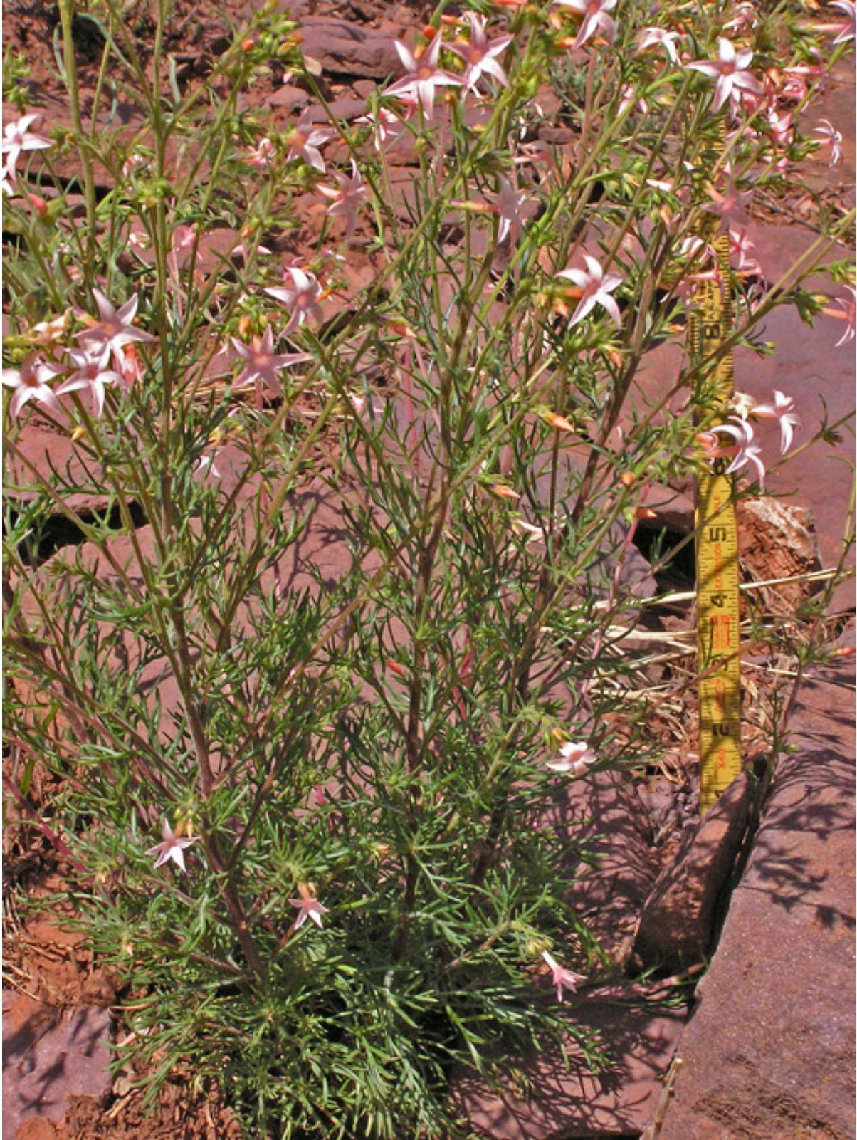
Figure 3. Ipomopsis ramosa grows 25–44 cm tall with multiple stems and/or branches and numerous panicles of flowers.