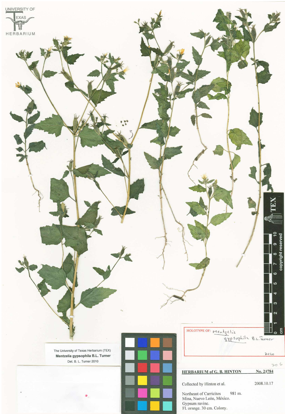
Figure 2. Holotype of Mentzelia gypsophila .