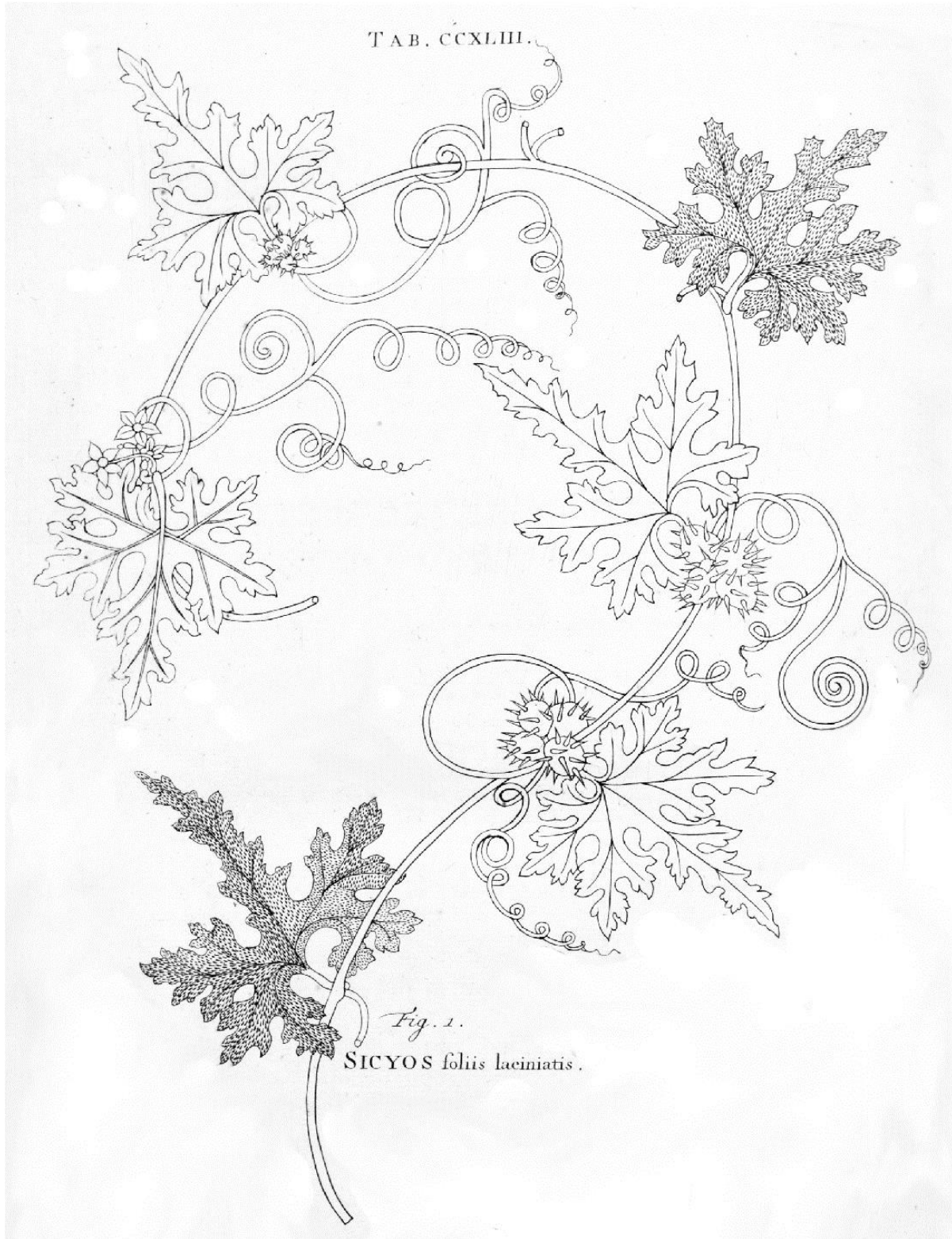
Figure 3. Lectotype of Sicyos laciniatus . " Sicyos foliis laciniatis " — Plumier in Burman, Pl. Amer. , 239, t. 243, f. 1, 1760.