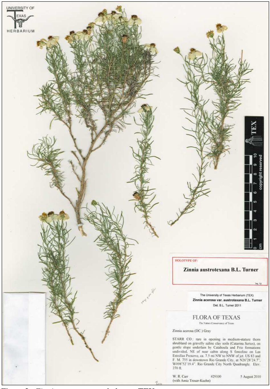
Figure 2. Zinnia austrotexana, holotype TEX.

In the fall of 2011, in company with Jana Kos, I revisited the two sites from which specimens of Zinnia austrotexana were gathered much earlier, but we were unable to relocate the taxon, perhaps due to the unusual drought conditions of that year but surely also to the considerable disturbances at the sites concerned. The Starr County location is now an assemblage of roadside houses.