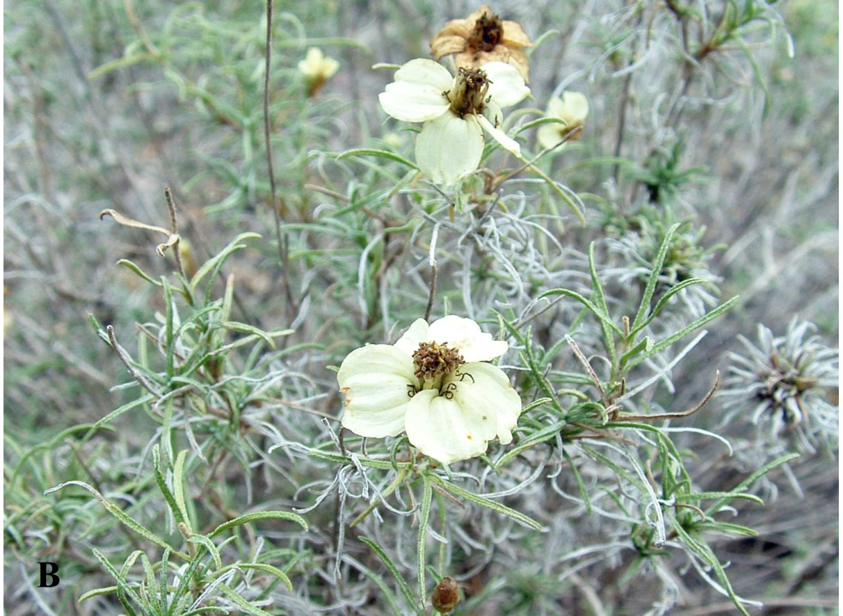
Figure 3a, b. Zinnia austrotexana at the type locality in Starr County, Texas.