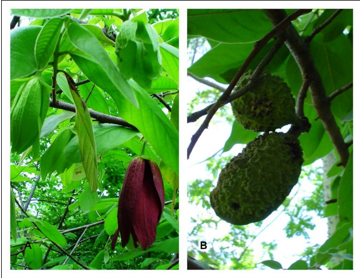
Figure 2. Sapranthus foetidus . A. Branchlet with inflorescence. B. Branchlet with fruits — fruit surface with plate-like, lamellar, lacerate excrescences.