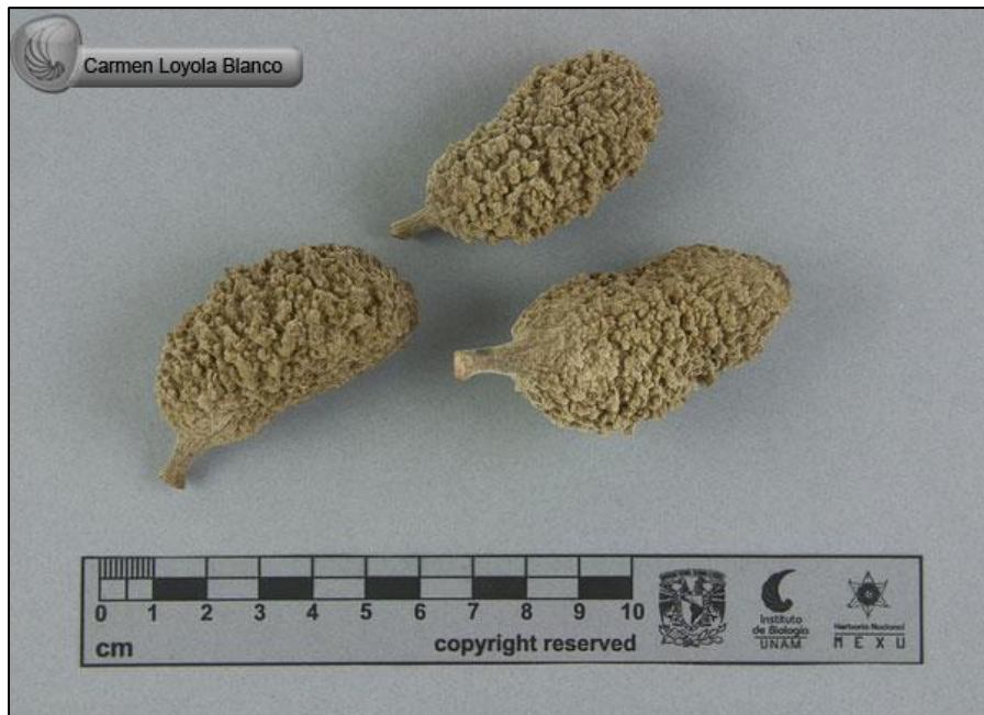
Figure 3. Fruits of Sapranthus foetidus from Tierra Colorada, Guerrero (Irekani 2021)