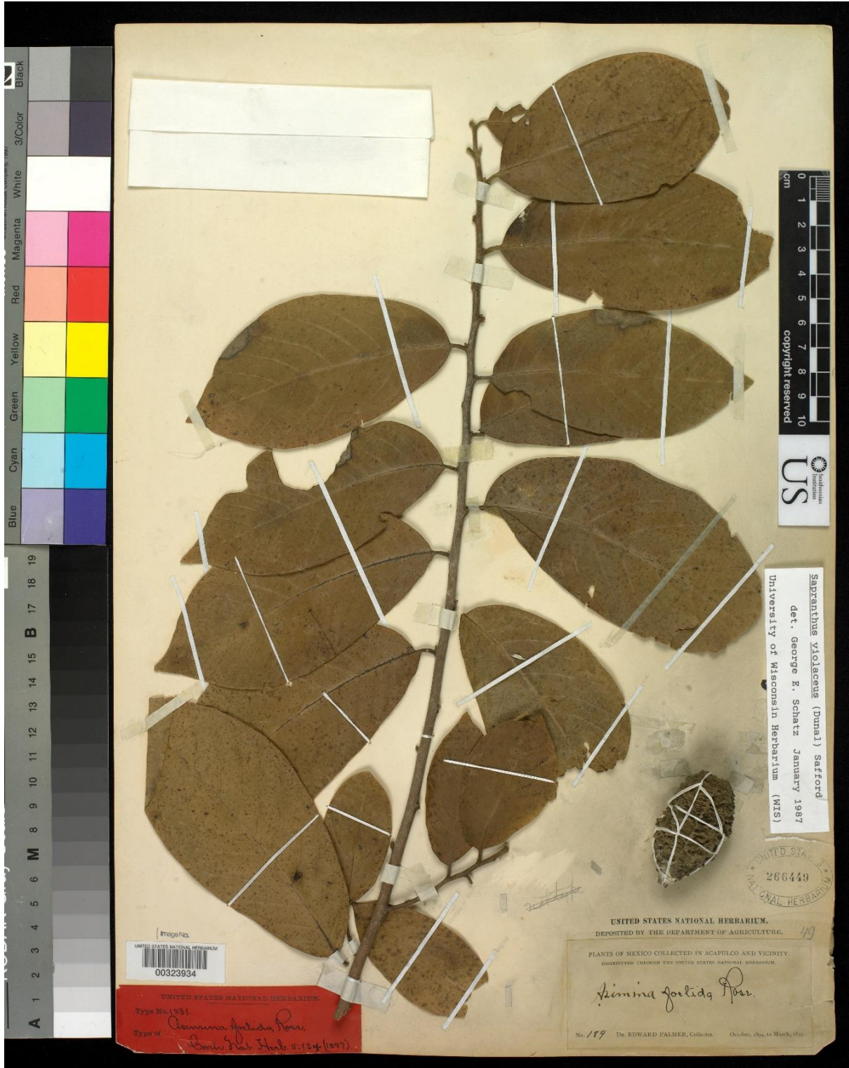
Figure 1. Sapranthus foetidus . Palmer 189 (US, type material of Asimina foetida ). The young fruit has plate-like, lamellar, lacerate excrescences on the surface.