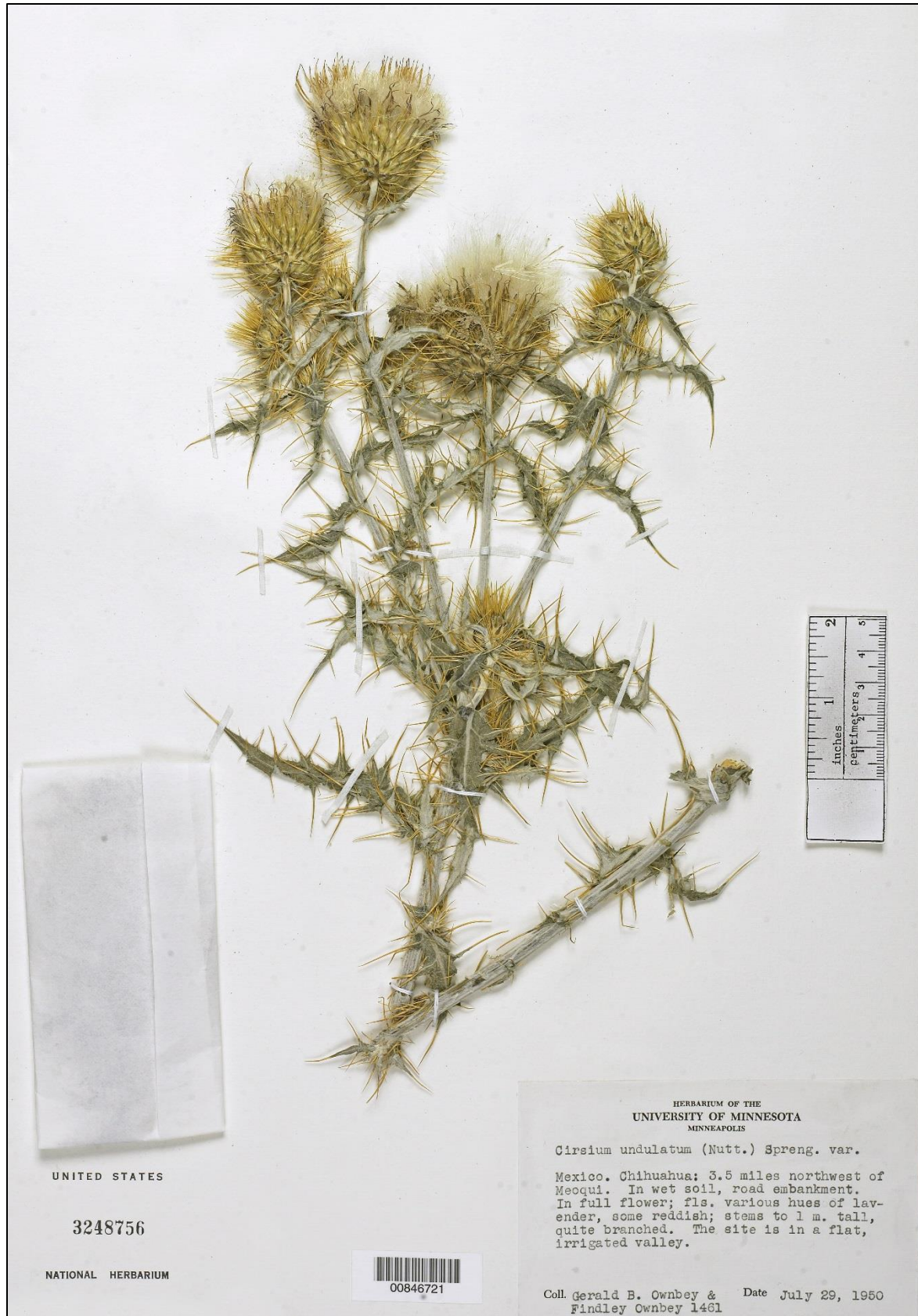
Figure 17. Cirsium townsendii . Chihuahua. Ownbey 1461 (US).

Nesom: Cirsium townsendii , comb. et stat. nov.