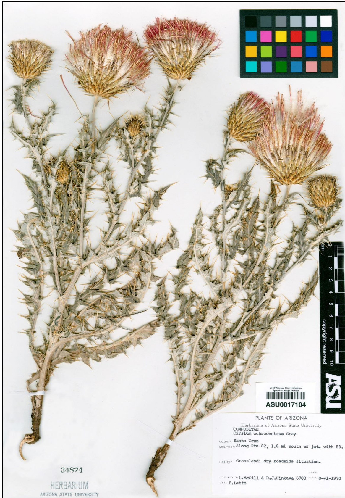
Figure 13. Cirsium townsendii . Santa Cruz Co., Arizona. McGill & Pinkava 6703 (ASU).