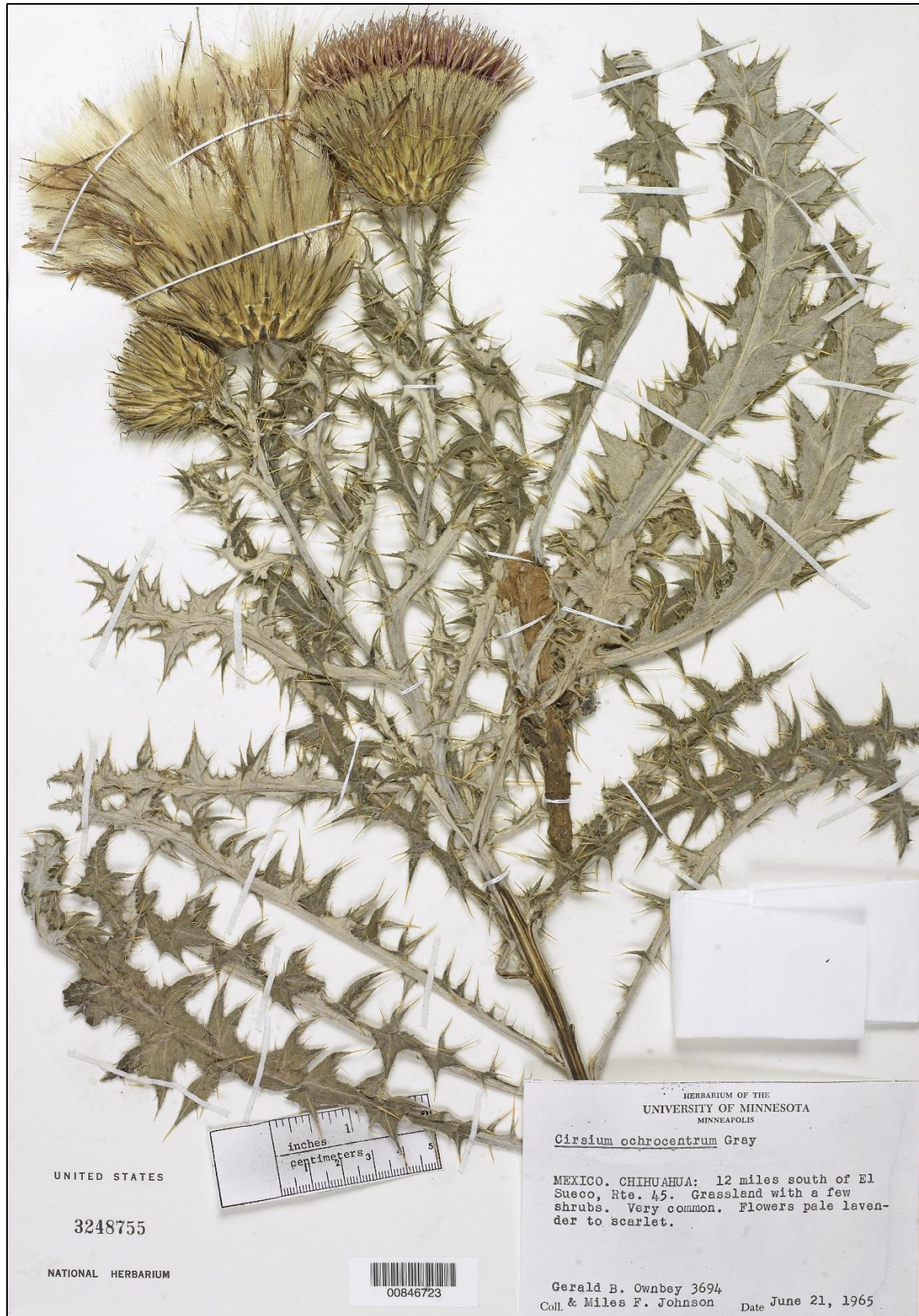
Figure 16. Cirsium townsendii . Chihuahua. Ownbey 3694 (US).