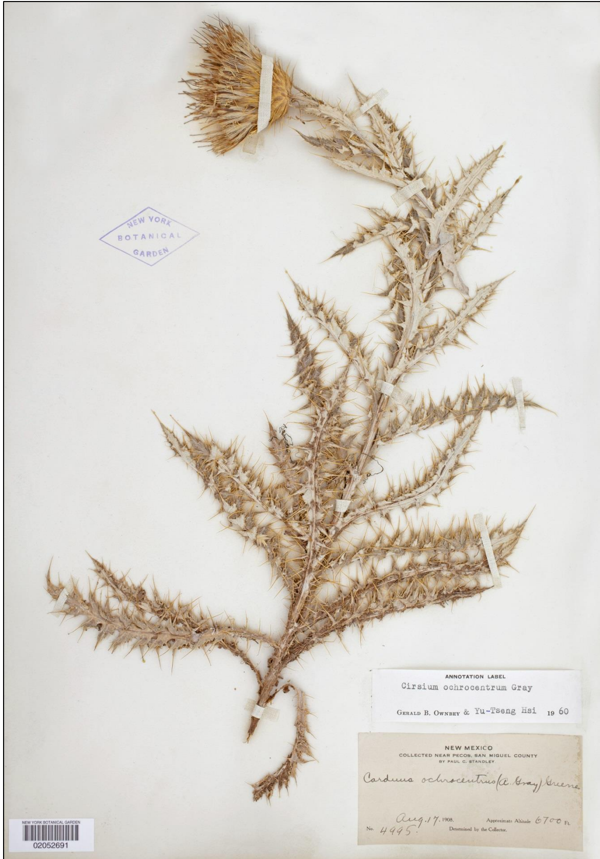
Figure 4. Cirsium ochrocentrum . San Miguel Co., New Mexico. Standley 4995 (NY).