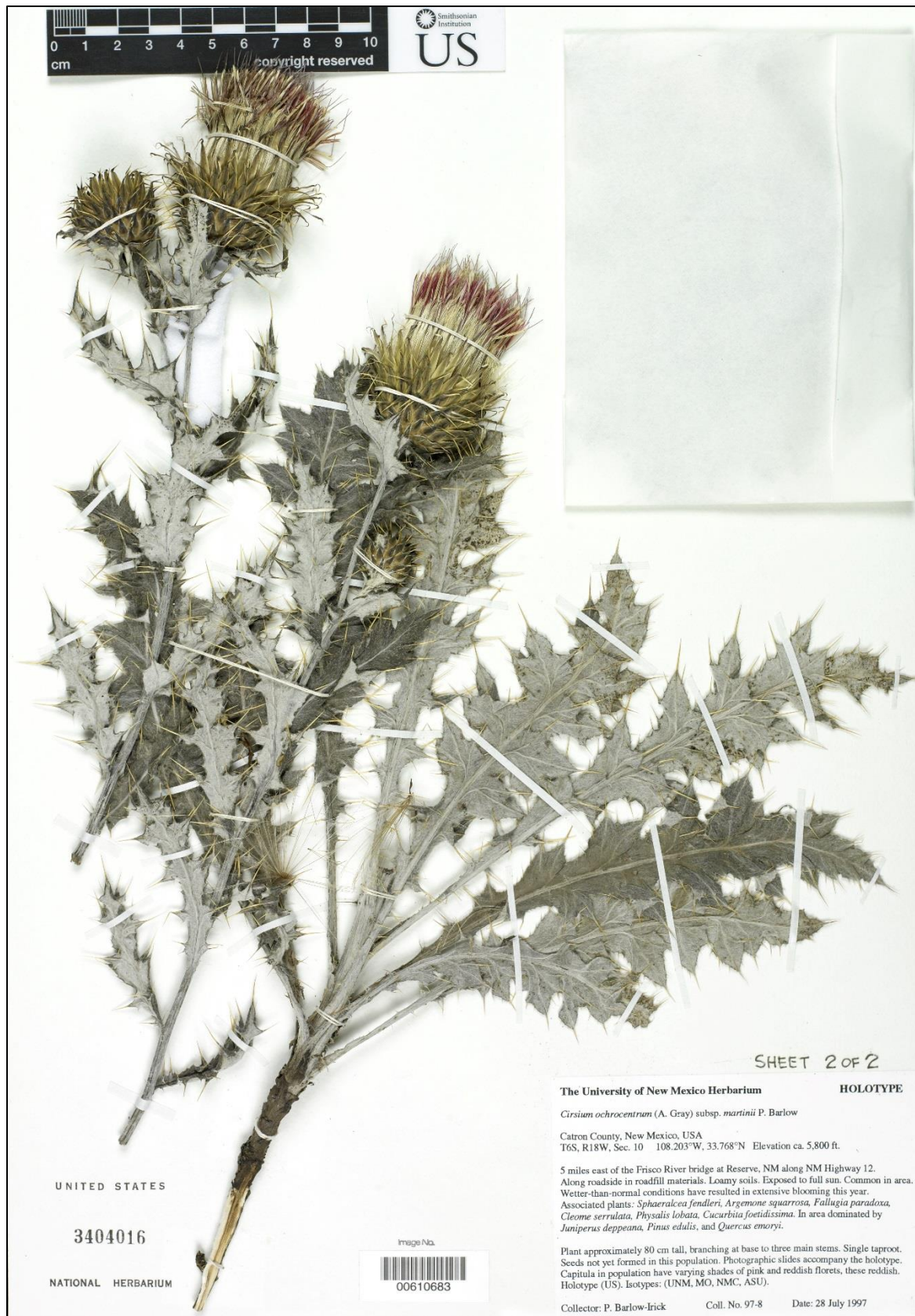
Figure 12. Cirsium townsendii . Catron Co., New Mexico. Holotype (US, sheet 2).