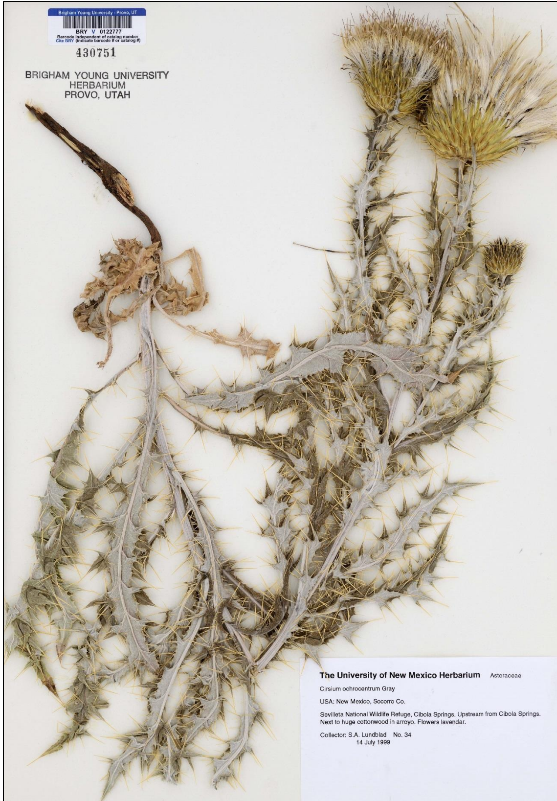
Figure 5. Cirsium ochrocentrum . Socorro Co., New Mexico. Lundblad 34 (BRY).