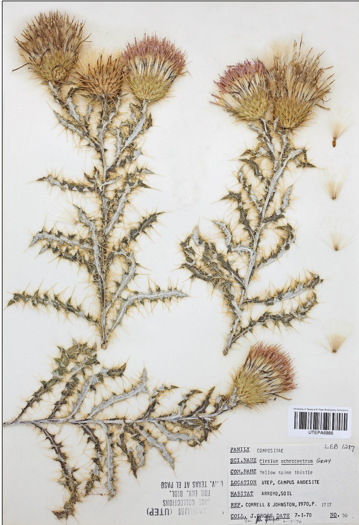
Figure 6. Cirsium ochrocentrum . El Paso Co., Texas. Cross 50 (UTEP).