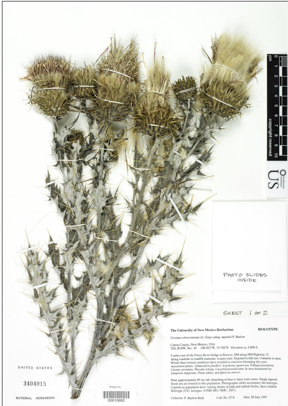
Figure 11. Cirsium townsendii . Catron Co., New Mexico. Holotype (US, sheet 1).