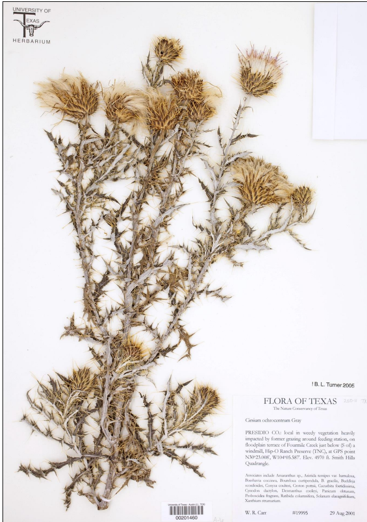
Figure 8. Cirsium ochrocentrum . Presidio Co., Texas. Carr 1995 (TEX).