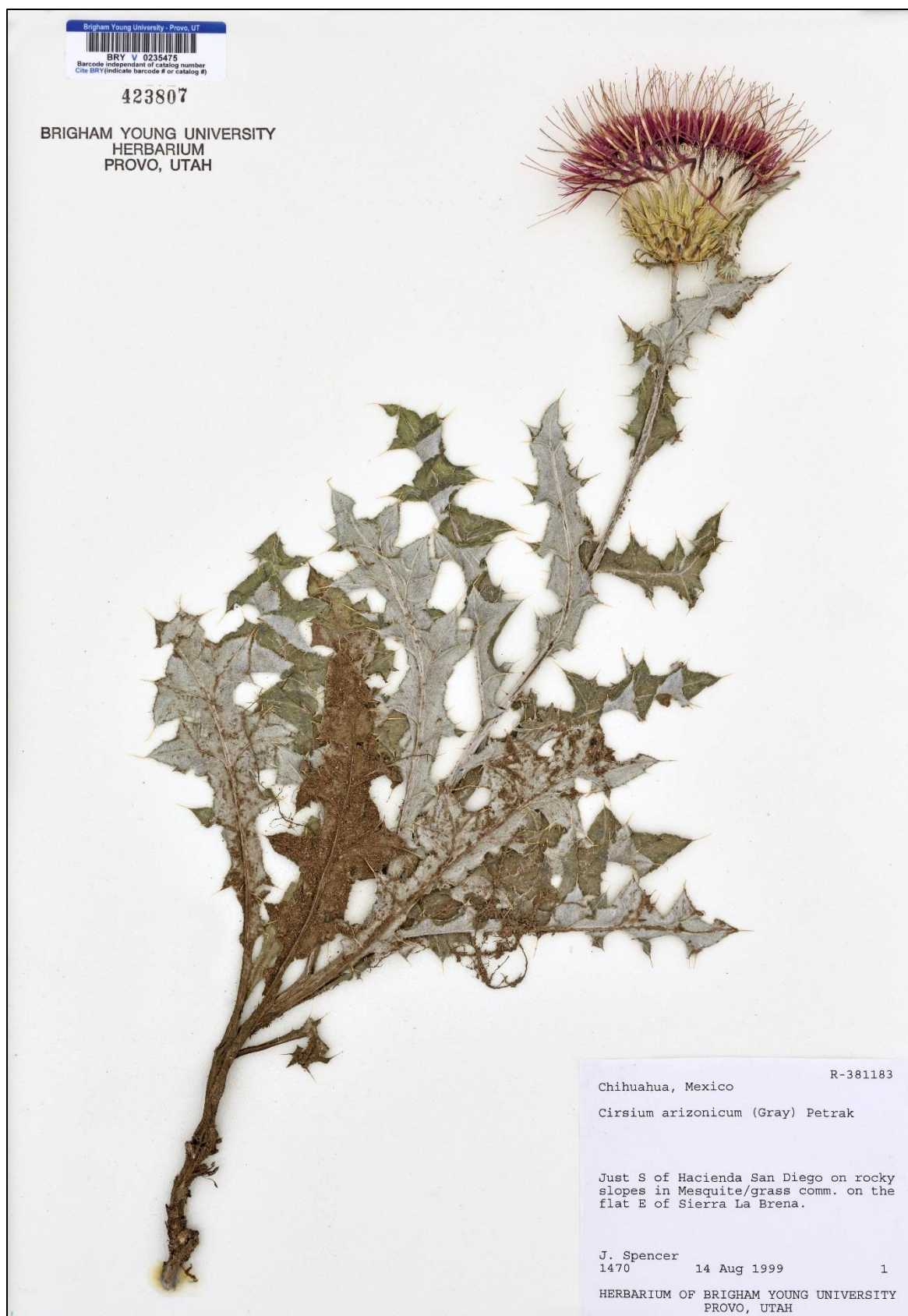
Figure 15. Cirsium townsendii . Chihuahua. Spencer 1470 (BRY).