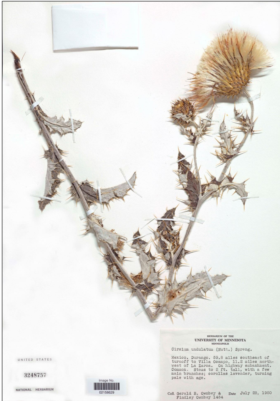
Figure 18. Cirsium townsendii . Durango. Ownbey 1454 (US).