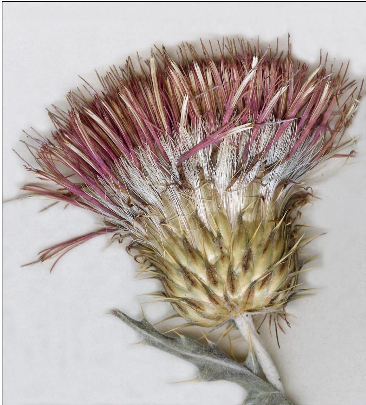
Figure 10. Cirsium townsendii . Chihuahua, Mexico. Head from GH isotype, Figure 9.