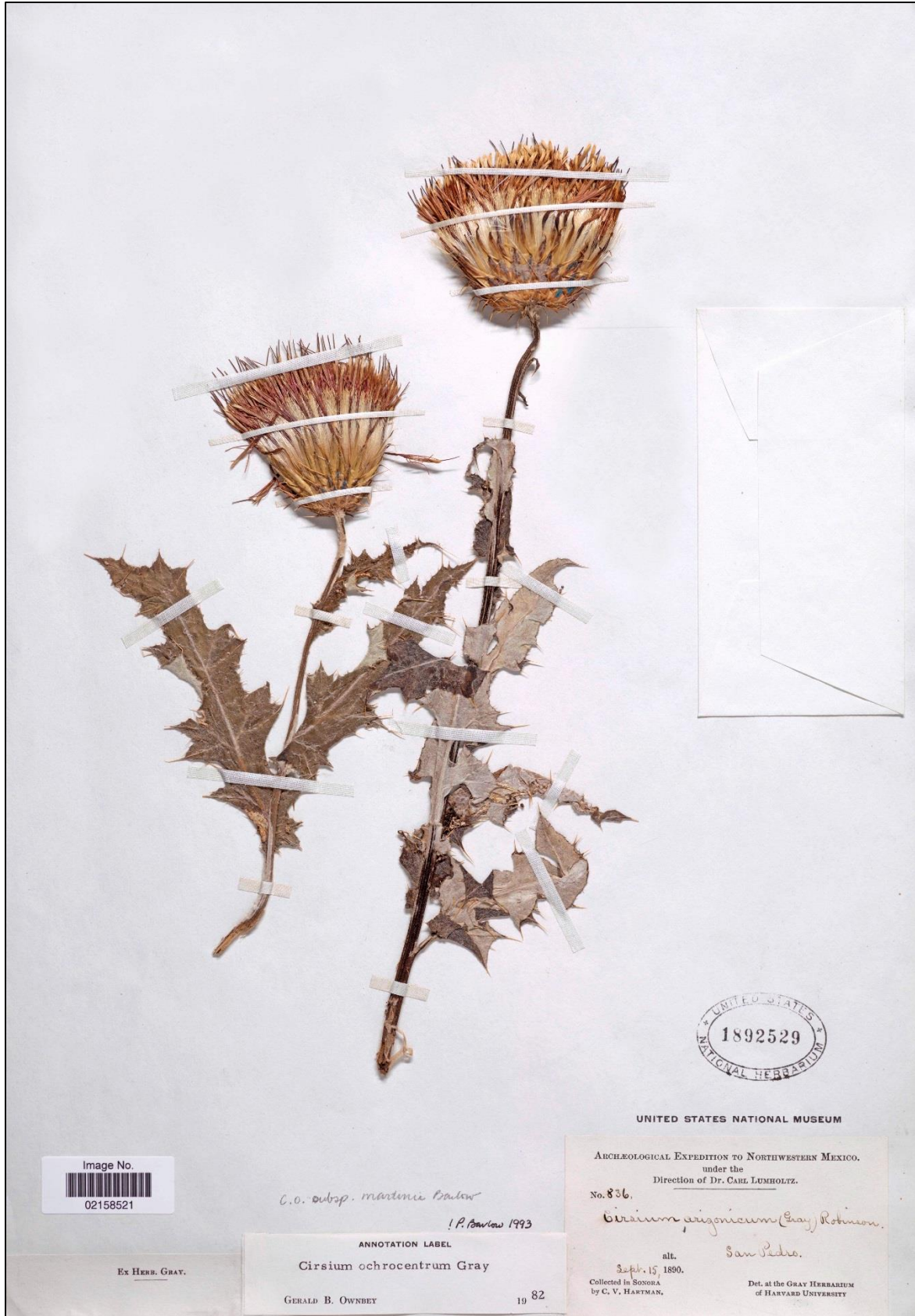
Figure 14. Cirsium townsendii . Sonora. Hartman 836 (US).