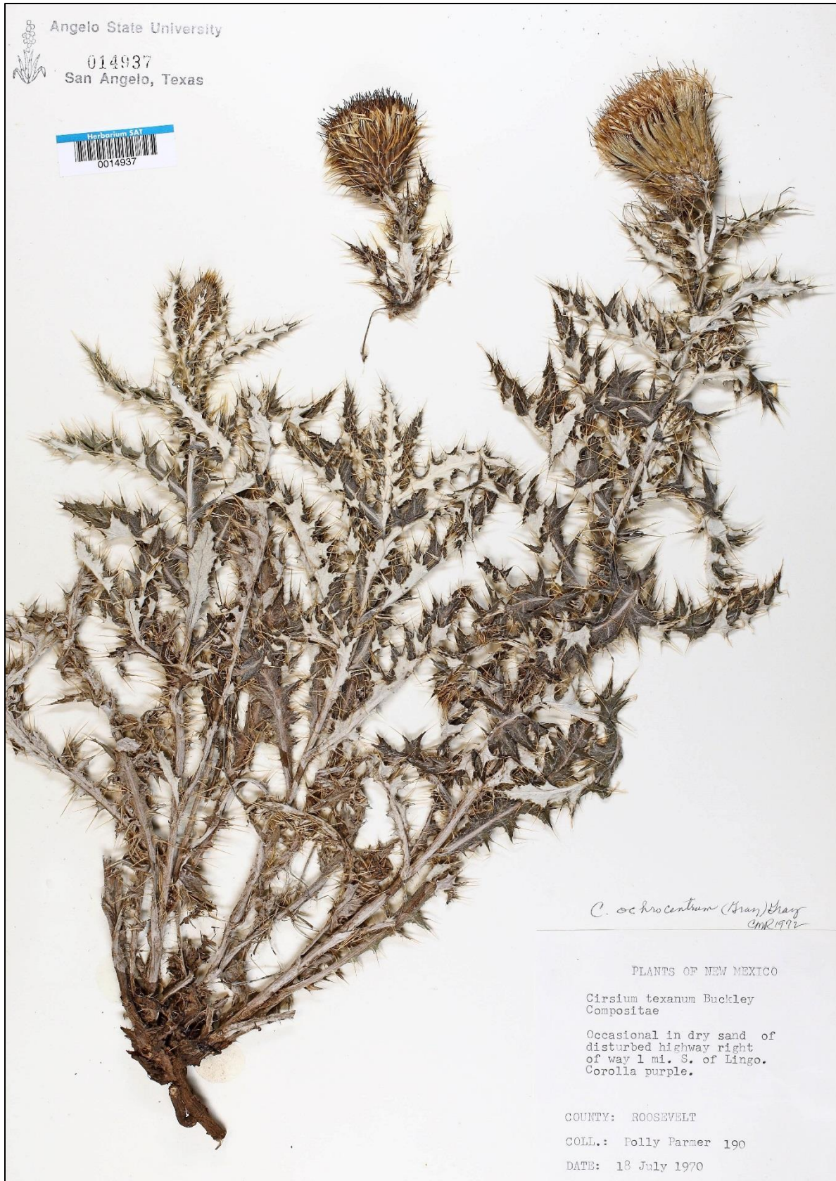
Figure 3. Cirsium ochrocentrum . Roosevelt Co., New Mexico. Parmer 190 (SAT).