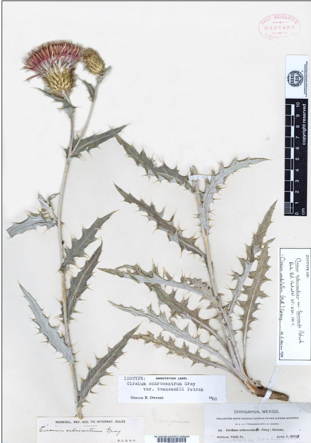
Figure 9. Cirsium townsendii . Chihuahua, Mexico. Isotype (GH).