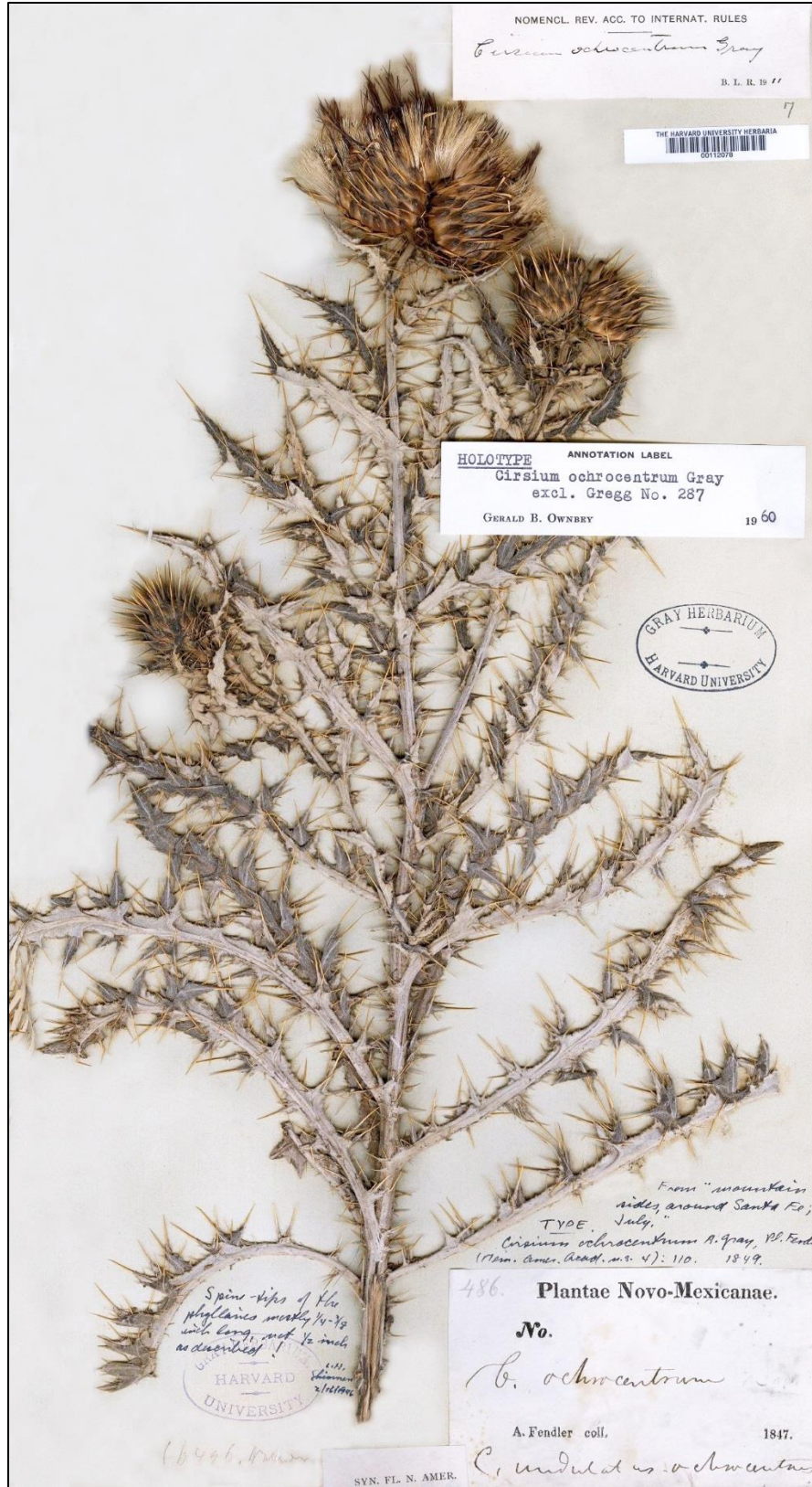
Figure 2. Cirsium ochrocentrum . Santa Fe Co., New Mexico. Holotype (GH).

Nesom: Cirsium townsendii , comb. et stat. nov.