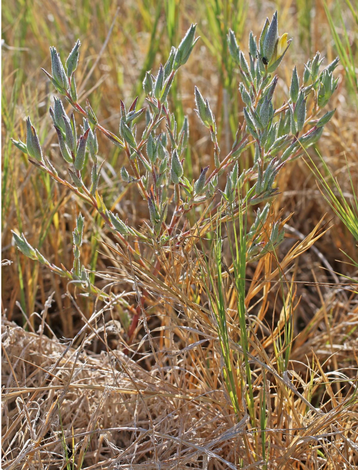
Figure 10. Chloropyron maritimum subsp. parryi , much-branched plant. Meadow Hot Springs, Millard Co., Utah. Photo by A. Zharkikh, 17 August 2019.