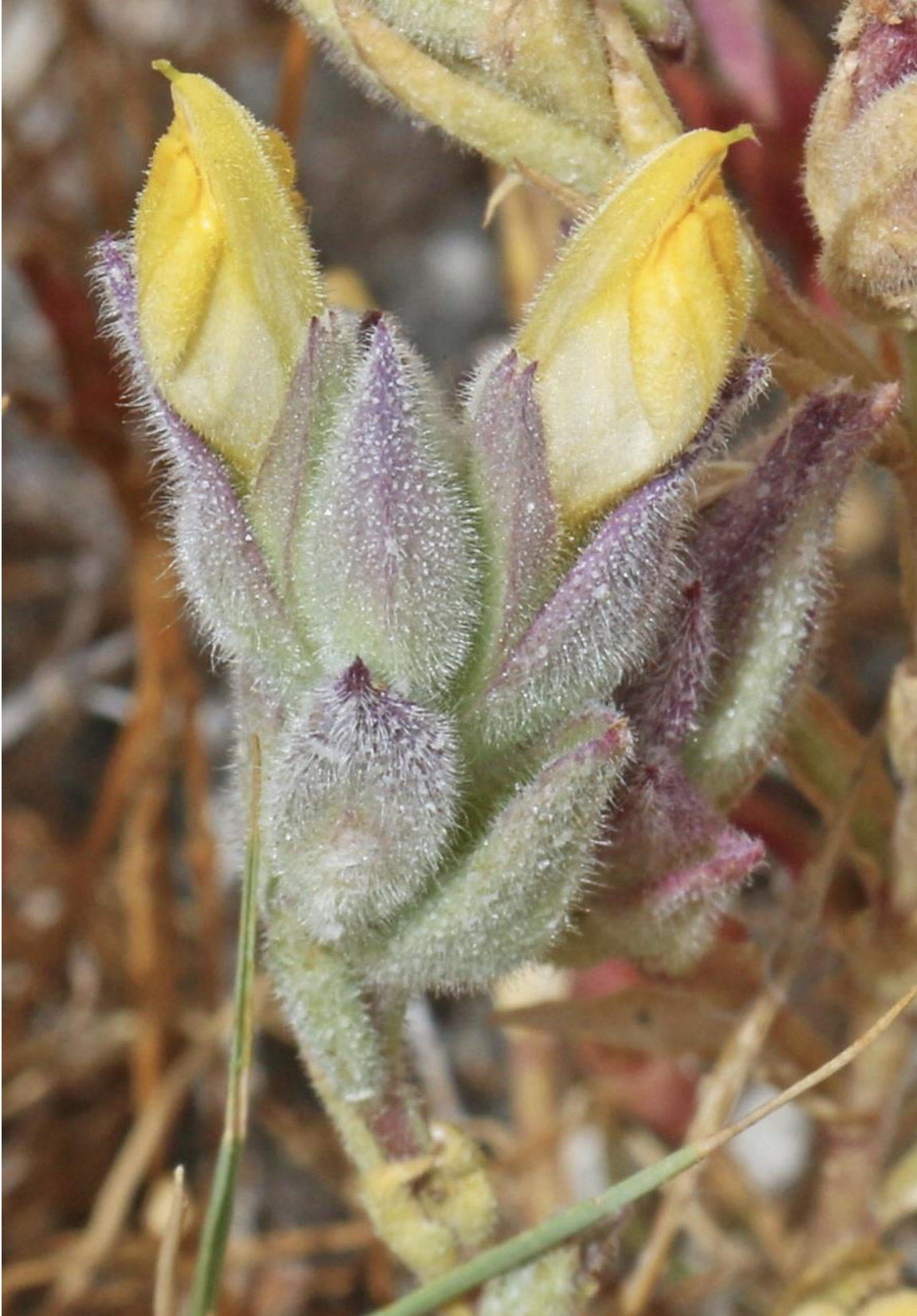
Figure 9. Chloropyron maritimum subsp. parryi , inflorescence. Utah Lake Wetland Preserve, Utah Co., Utah. Photo by A. Zharkikh, 8 September 2018.