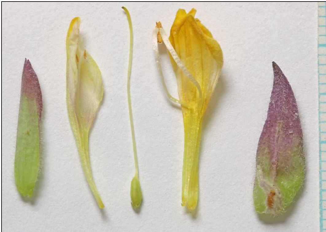
Figure 6. Subsp. parryi , dissection 2, left to right: calyx, adaxial corolla and galea with two stamens, pistil, abaxial corolla lip with two stamens, floral bract. Both photos: Utah Lake Wetland Preserve, Utah Co., Utah, 7 September 2019, by A. Zharkikh. 1 mm grid.