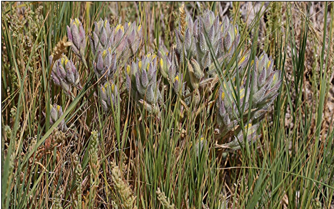
Figure 8. Chloropyron maritimum subsp. parryi and associated species, along Hwy. 83, around former rail tracks. Box Elder County, Utah. 3 August 2019.