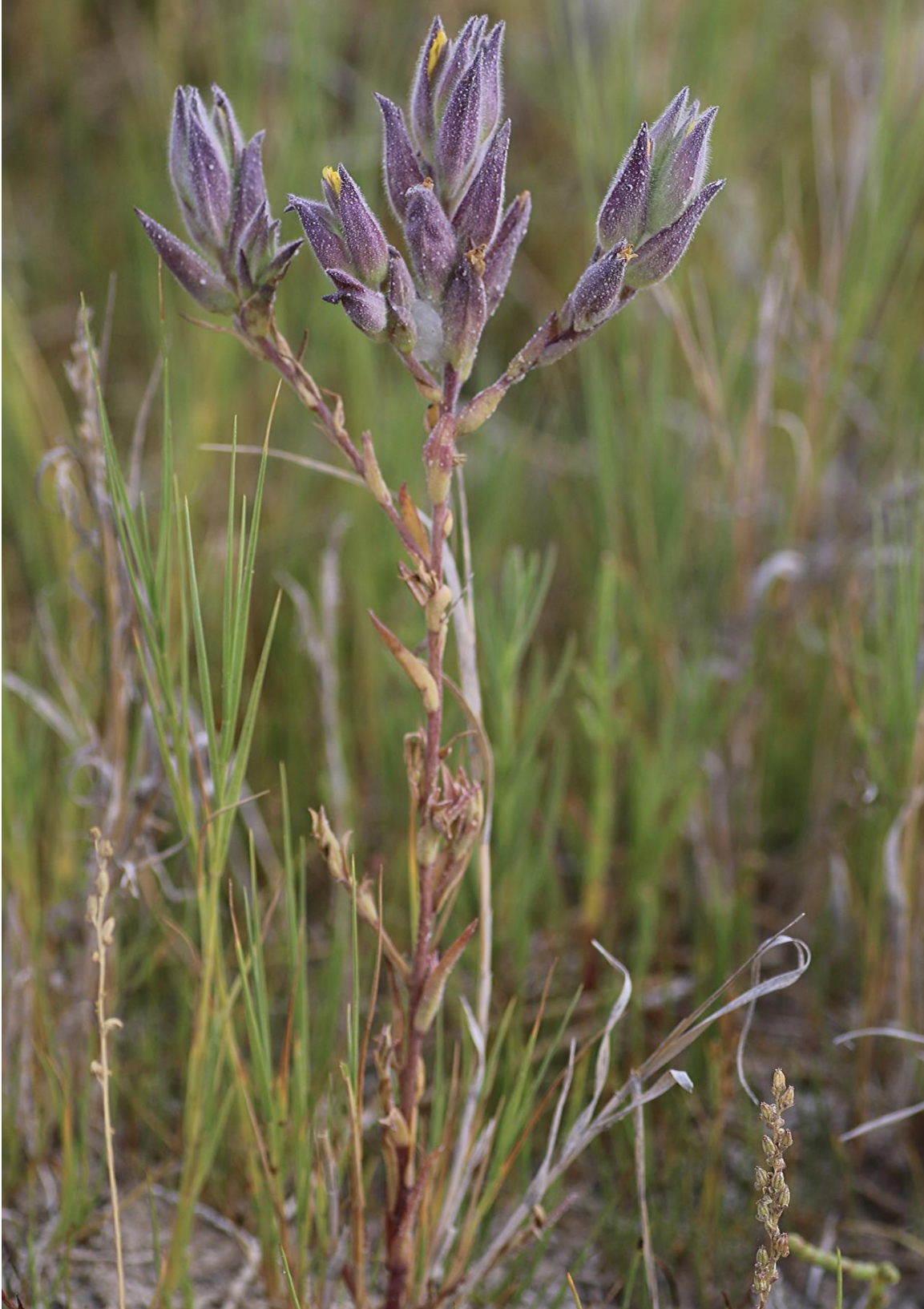
Figure 12. Chloropyron maritimum subsp. parryi , stem and branched inflorescence. Utah Lake Wetland Preserve, Utah Co., Utah. Photo by J.M. Egger, 24 Jul 2019.