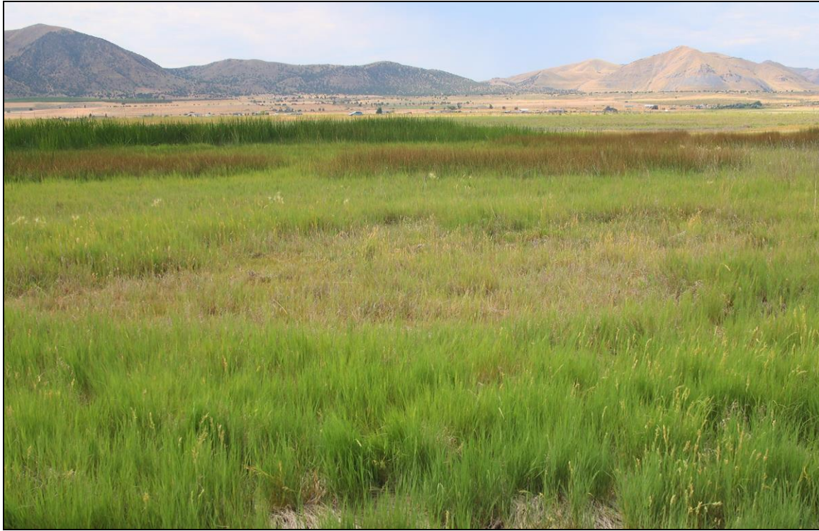
Figure 7. Habitat of Chloropyron maritimum subsp. parryi , Utah Lake Wetland Preserve, Utah Co., Utah. The Chloropyron occurs only within the low, saline swale in the center of the image. Photo by J.M. Egger, 24 Jul 2019.