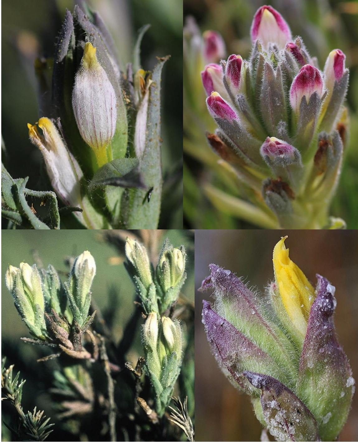
Figure 2. The subspecies of Chloropyron maritimum : subsp. canescens , Inyo Co., California, upper left; subsp. palustre , Humboldt Co., CA, upper right; subsp. maritimum , Orange Co., California, lower left; ssp parryi , Utah Co., Utah, lower right. Note the consistent bract lobing, a pair of distal lobes in the maritime subspecies vs. entire margins in the interior subspecies).