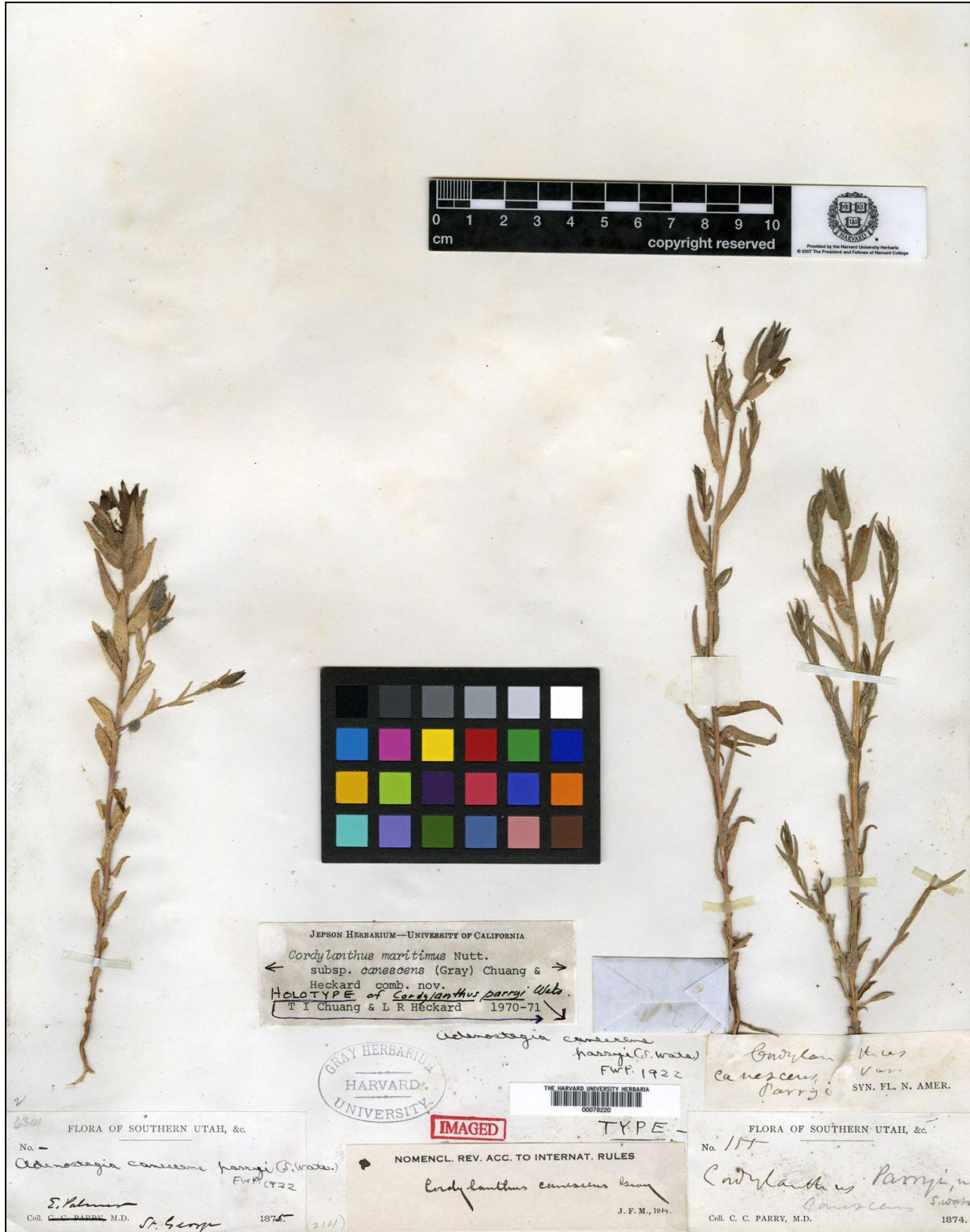
Figure 3. Parry 155, holotype of Cordylanthus parryi , represented by the two stems on the right. On the left is a stem of Palmer 6301, collected in the same area the following year.