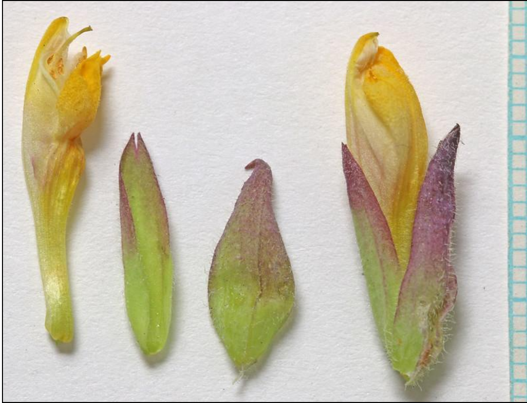
Figure 5. Subsp. parryi , dissection 1, left to right: corolla, calyx, floral bract, complete flower.