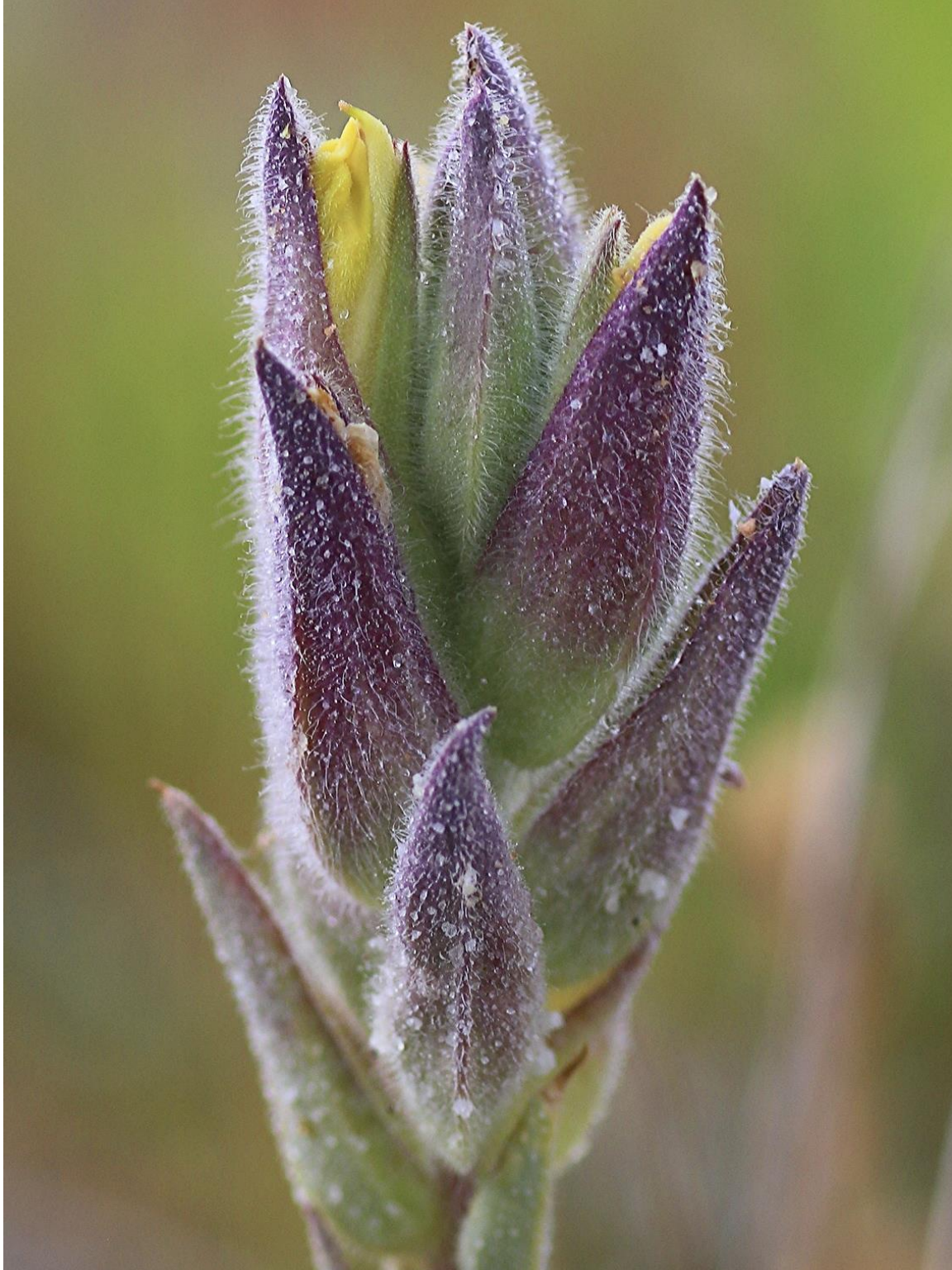
Figure 11. Chloropyron maritimum subsp. parryi , inflorescence. Utah Lake Wetland Preserve, Utah Co., Utah. Photo by J.M. Egger, 24 Jul 2019.