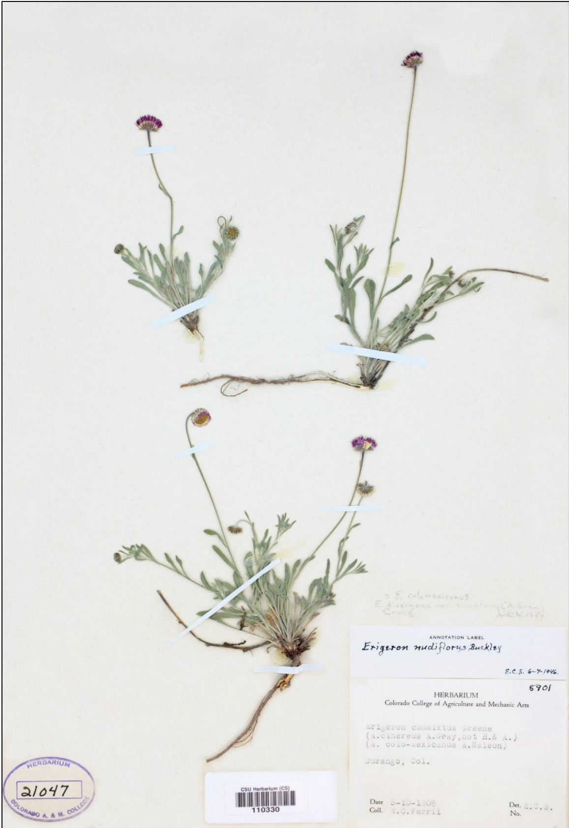
Figure 13. Erigeron tracyi . La Plata Co., Colorado, Ferril s.n. (CS).