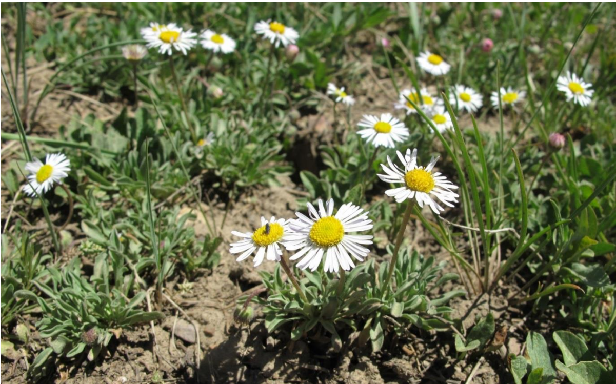
Figure 5. Cat Creek Erigeron . Photo by R. McCauley, 6 May 2021.