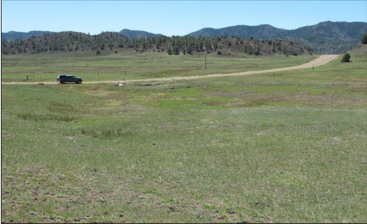
Figure 4. Locality of Cat Creek Erigeron . Archuleta Co., Colorado, looking south. Photo by R. McCauley, 6 May 2021.