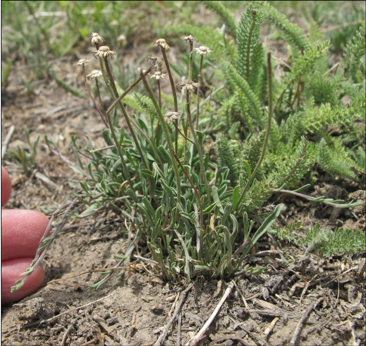
Figure 7. Cat Creek Erigeron . Photo by R. McCauley, 18 July 2021.