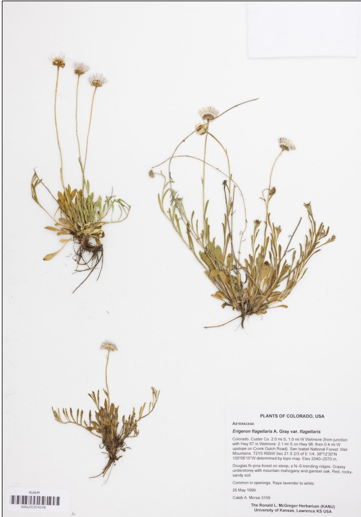
Figure 16. Erigeron flagellaris . Custer Co., Colorado, Morse 3159 (CS).