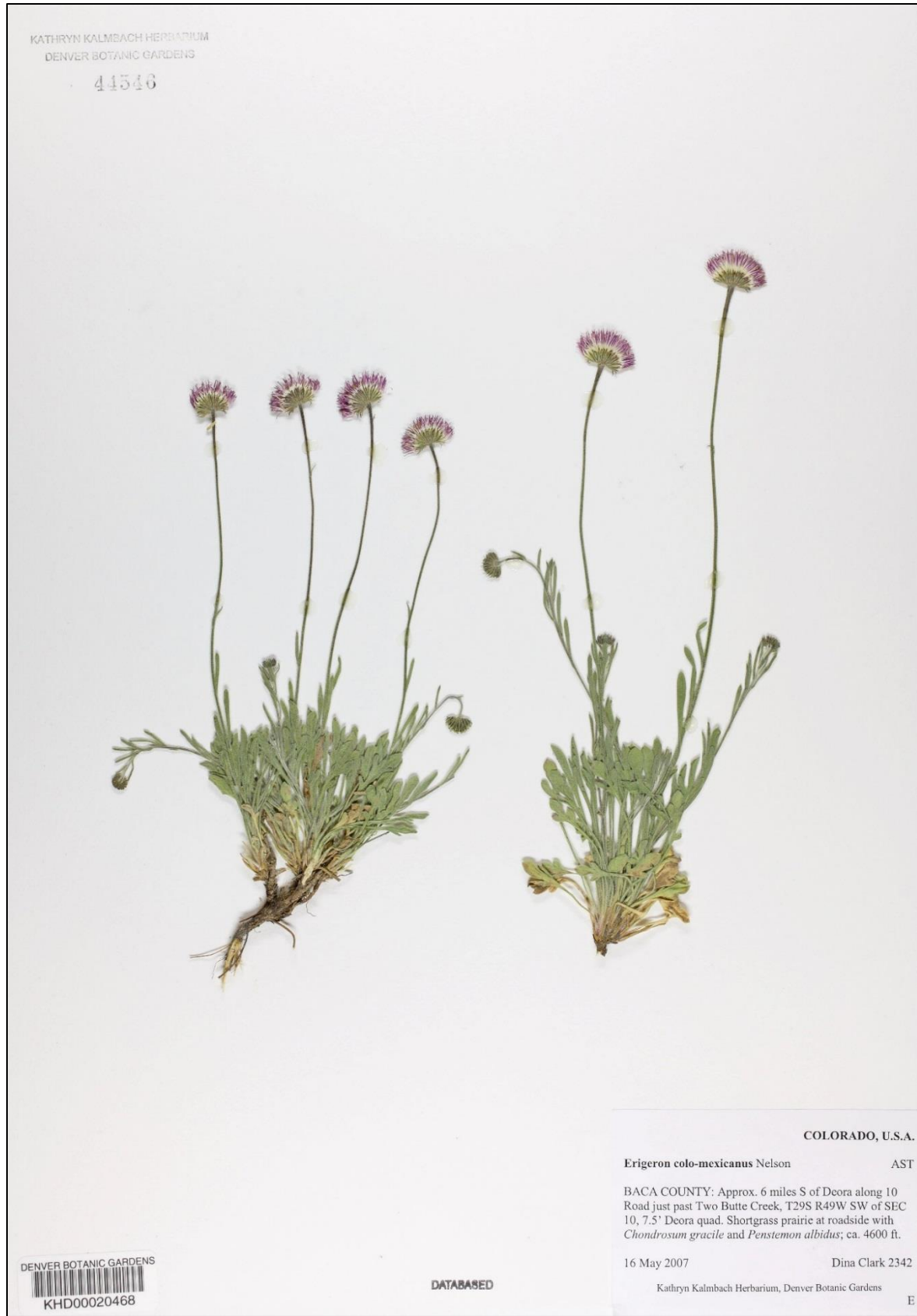
Figure 11. Erigeron tracyi . Baca Co., Colorado, Clark 2342 (KHD).