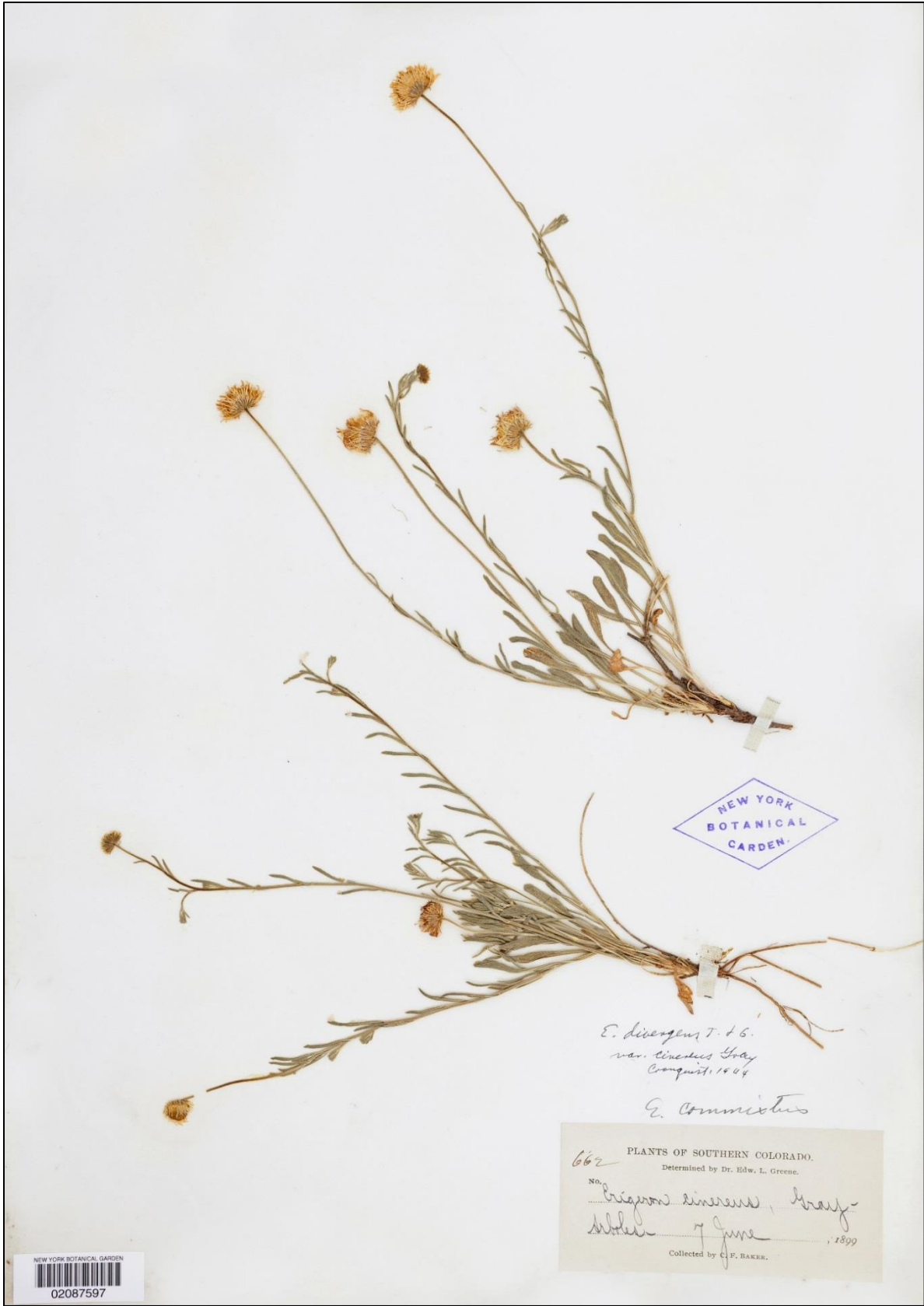
Figure 10. Erigeron tracyi . Archuleta Co., Colorado, Baker 662 (NY).