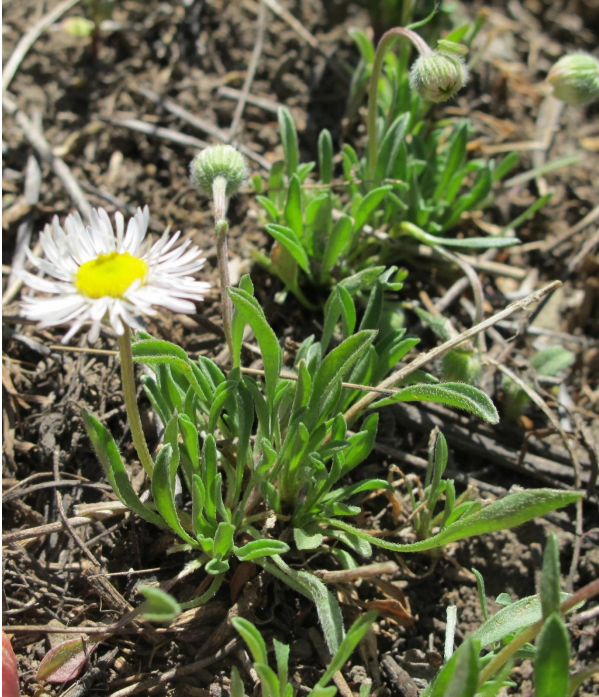
Figure 6. Cat Creek Erigeron . Photo by R. McCauley, 6 May 2021.