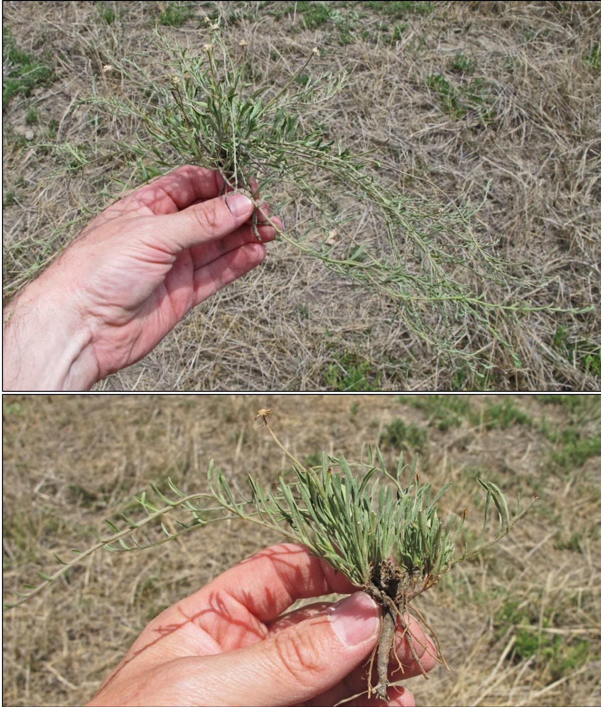
Figure 8. Cat Creek Erigeron . Photo by R. McCauley, 18 July 2021.