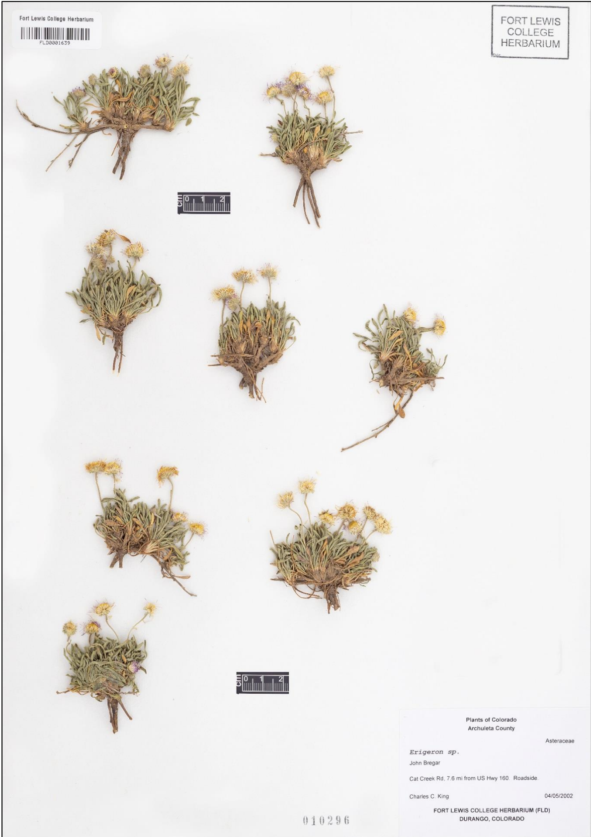
Figure 1. Cat Creek Erigeron . King s.n. (FLD), collected 4 May 2002.