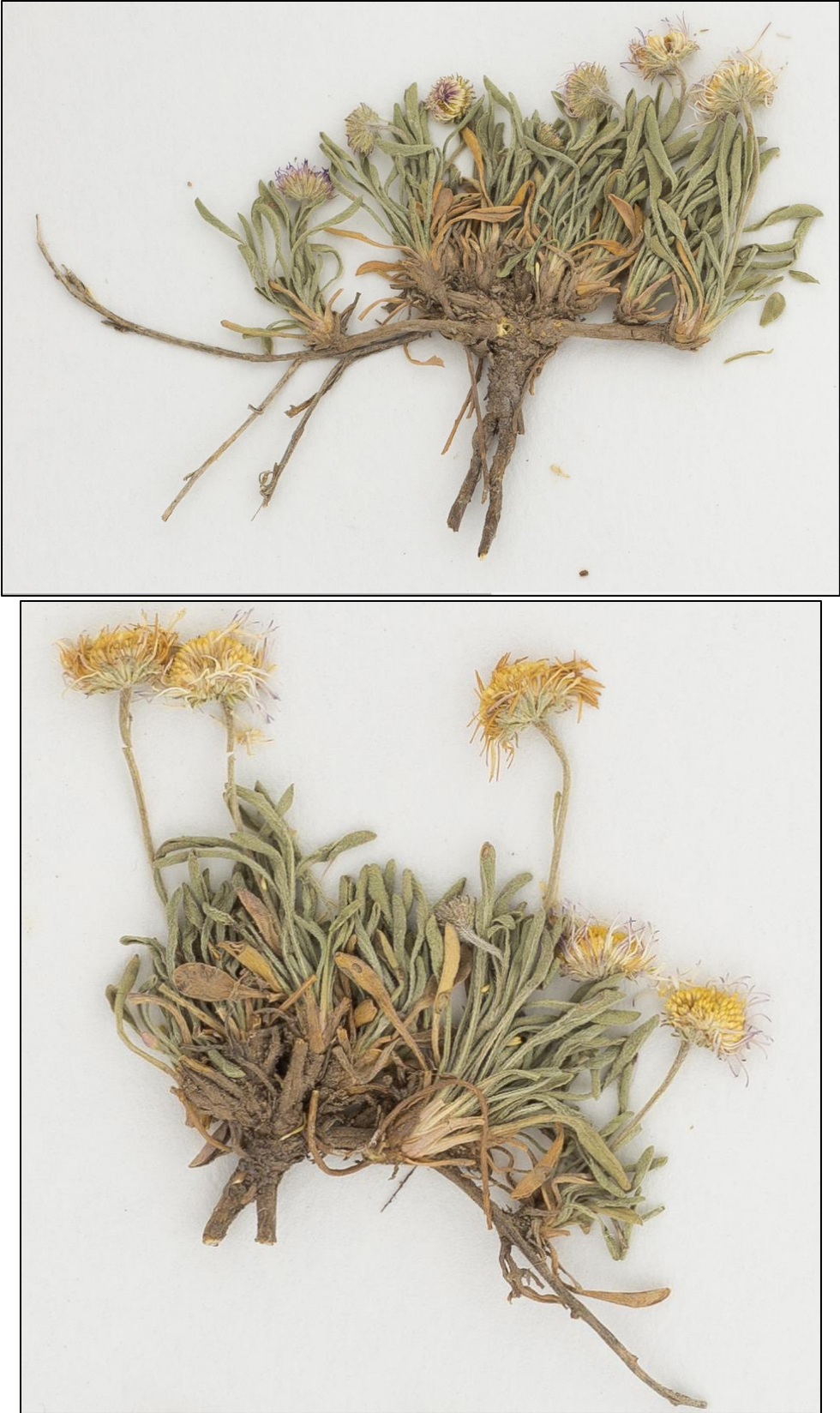
Figure 3. Cat Creek Erigeron , single plants from King s.n. Lignescent remnants of runners are showing.