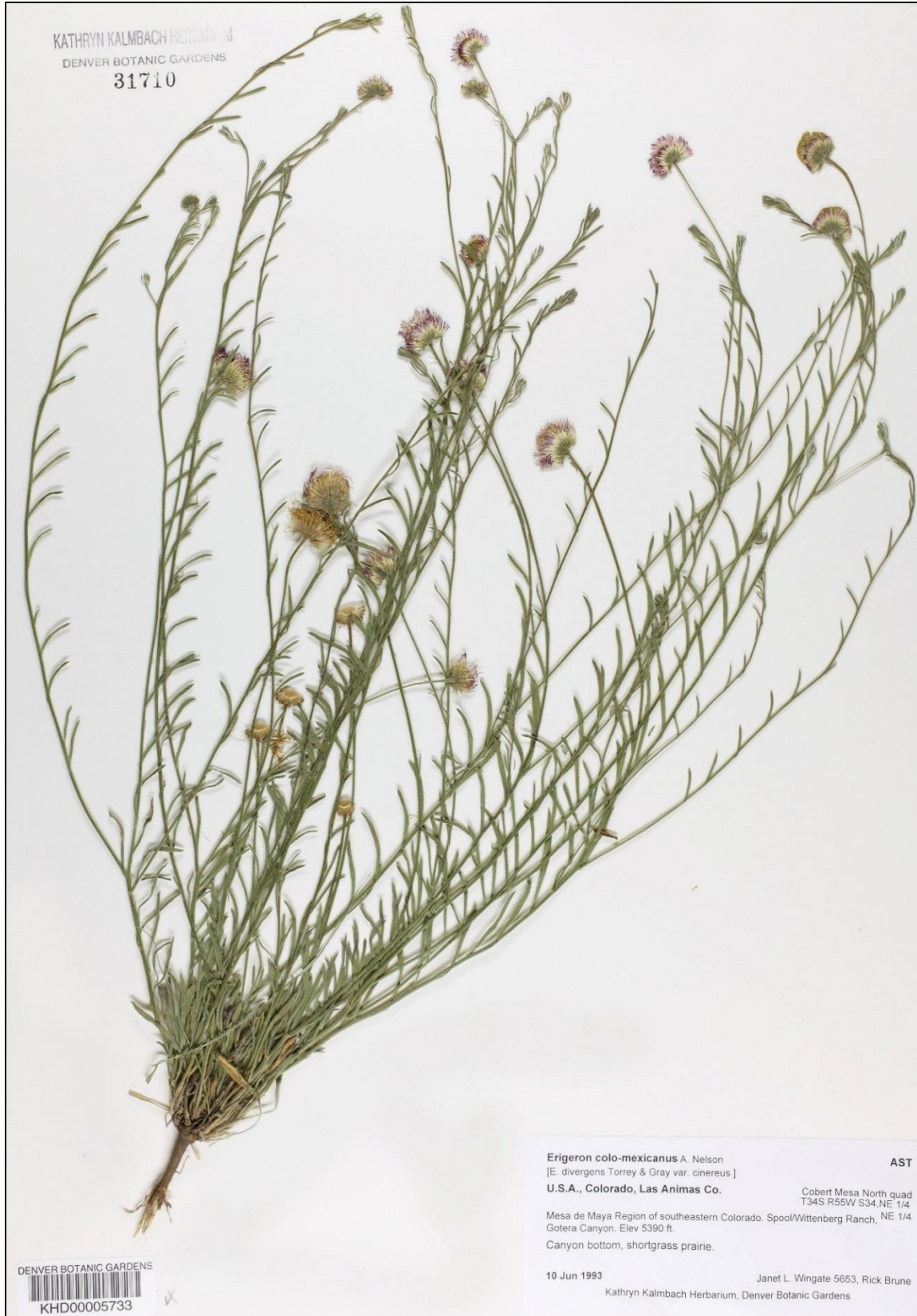
Figure 14. Erigeron tracyi . Las Animas Co., Colorado, Wingate 5653 (KHD). Long runners are producing heads at the tips.