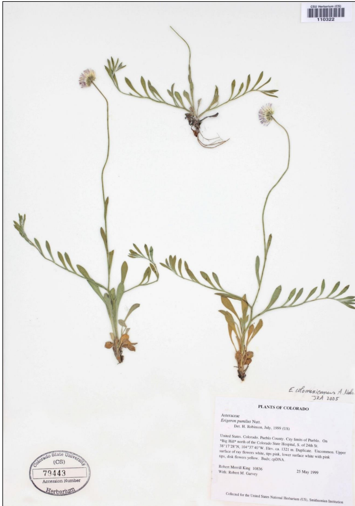
Figure 15. Erigeron tracyi . Pueblo Co., Colorado, King 10836 (CS).