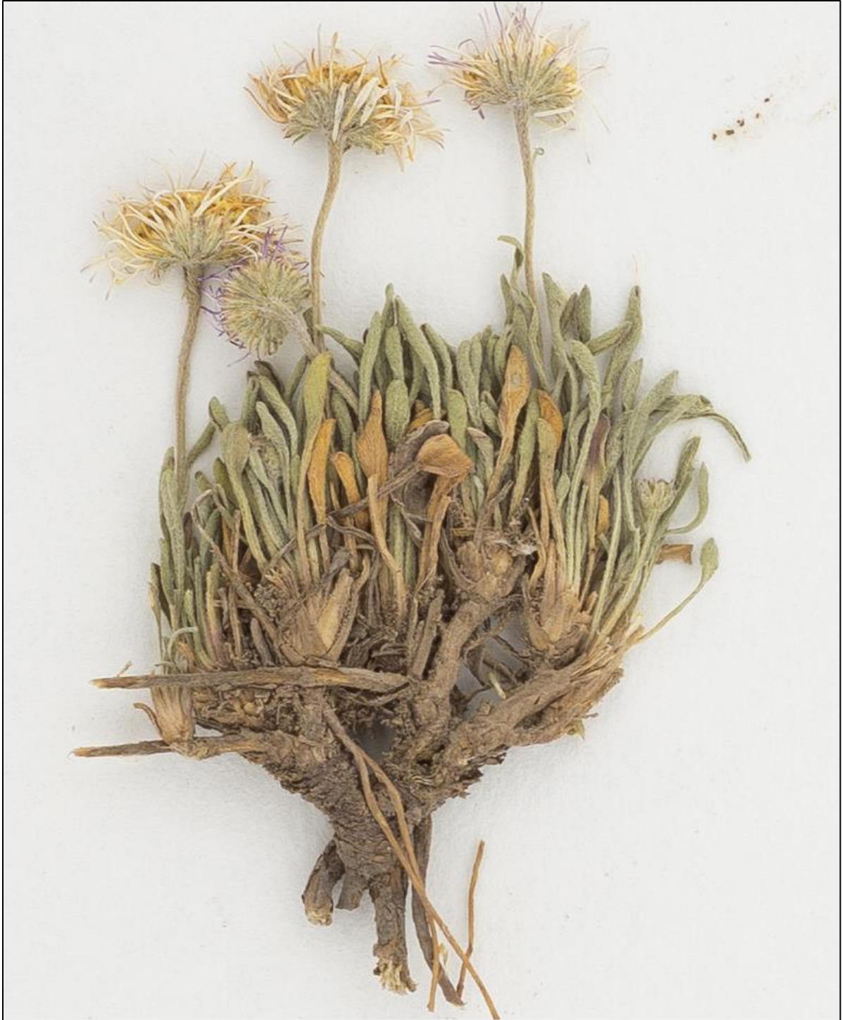
Figure 2. Cat Creek Erigeron , single plant from King s.n.