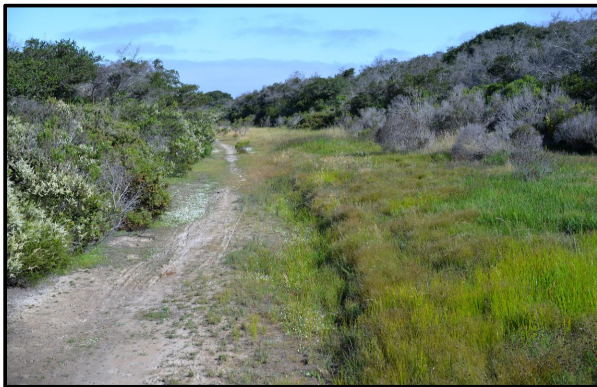
Figure 4. Habitat of Eryngium montereyense at type locality on Fort Ord National Monument. Photo by Dean Taylor, 27 May 2016.

Taxonomic relationships. The California species of Eryngium , together with E. petiolarum of Oregon and southern Washington, comprise Eryngium sect. Indiana Wolff subsect. Armatum Wolff. Wolff (1913) was ambiguous about whether to treat subsect. Armatum as a section or subsection. Sheikh (1978) concluded that recognition of sect. Armatum was warranted, although he never published the rank change. Subsequently, Calviño et al. (2008, 2010) found that neither sect. Indiana nor subsect. Armata are monophyletic, and support for infrageneric ranks in Eryngium will require additional data.