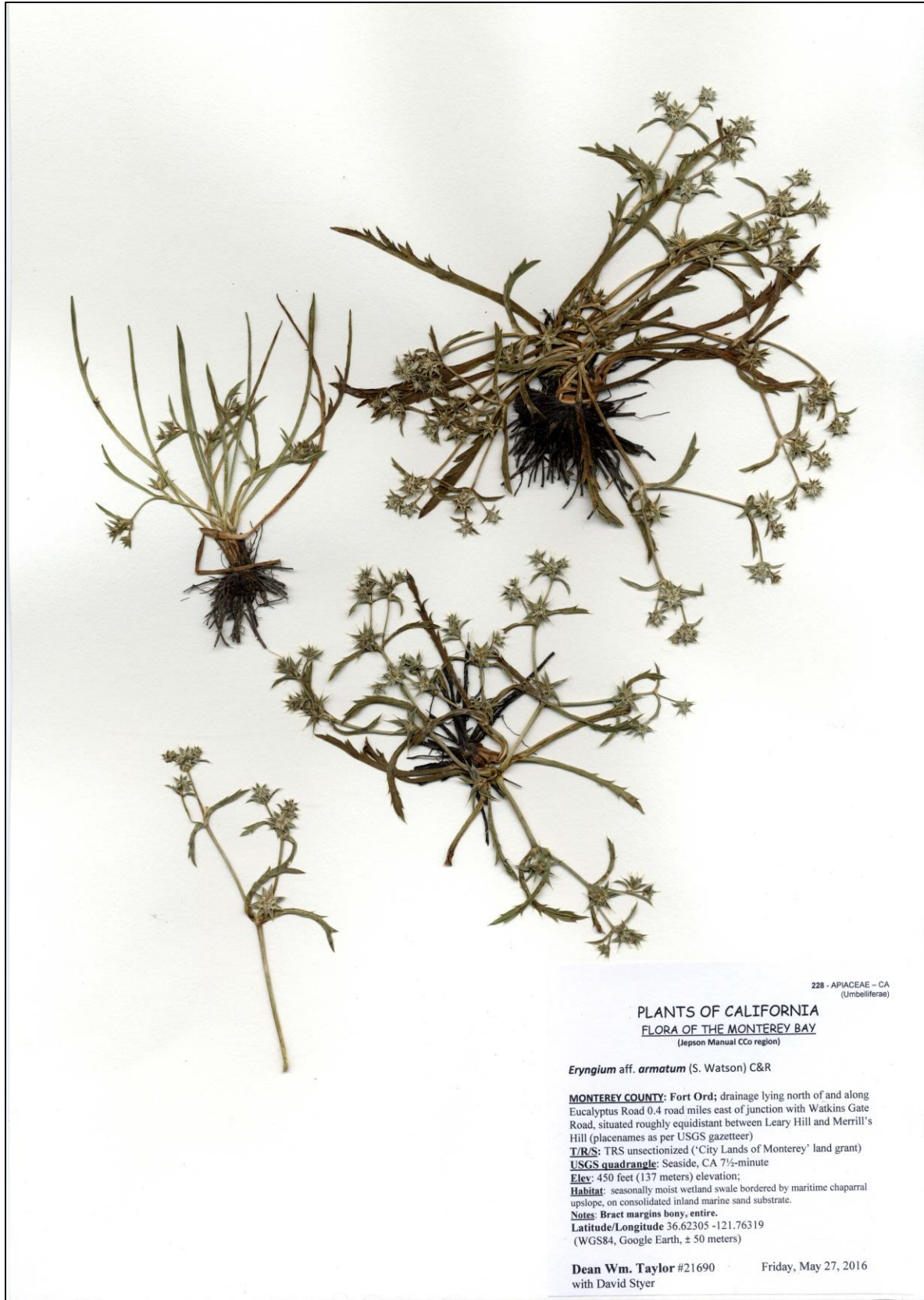
Figure 1. Eryngium montereyense , holotype, Taylor 21690 (JEPS).