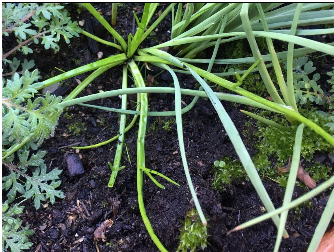
Figure 2. Eryngium montereyense , detail of basal leaves in plants in cultivation. Photo by Dean Taylor, 02 November 2016.