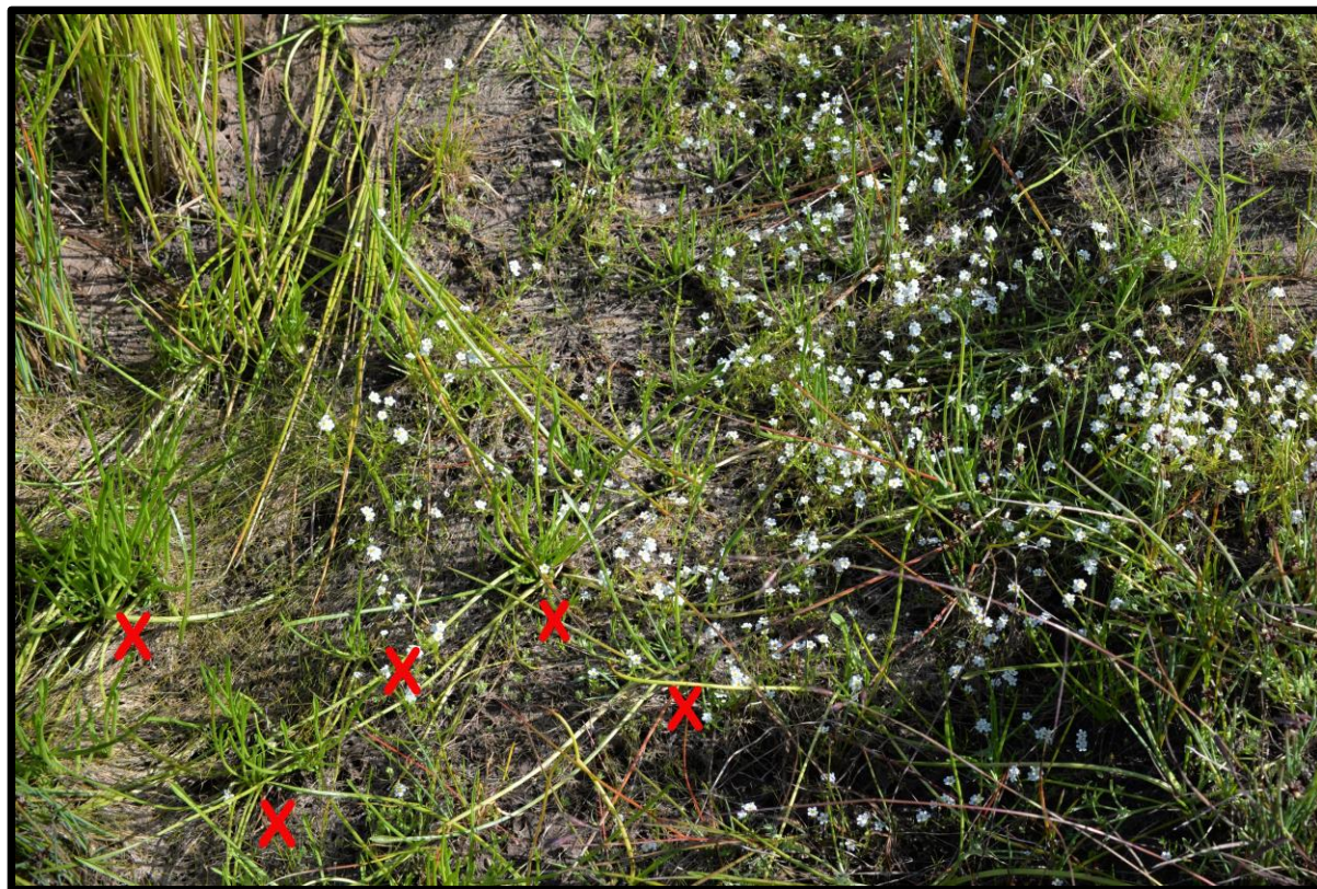
Figure 5. Eryngium montereyense in situ at type locality. Photo by Dean Taylor, 27 May 2016. Individual plants are marked with a red “X”.

Eryngium montereyense is similar to three other species, E. armatum , E. pendletonense and E. pinnatisectum , all of which are characterized by unlobed capitular bracts with thickened, spineless margins (Preston et al. 2012). Eryngium armatum is the most widespread of the four species, being distributed along coastal California from Humboldt County to San Diego County, where it grows in grasslands and meadows on coastal bluffs and terraces. Eryngium pinnatisectum occurs on vernal wet clay or adobe soils along swales and streambanks in the central and northern Sierra Nevada foothills. Eryngium pendletonense grows on exposed coastal bluffs and grasslands on clay soils, with adjacent vegetation consisting of disturbed native grasslands and coastal scrub, in northern San Diego County (Marsden & Simpson 1999). Like E. montereyense , E. pendletonense is restricted to a small area within a military base (Camp Pendleton).