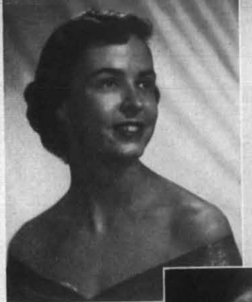
PHI BETA KAPPA