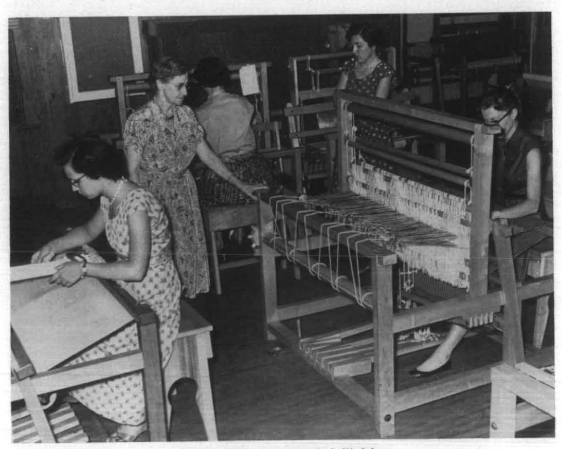
Weaving Class at Summer Craft Workshop

Last year Sevier County raised 6% of the funds for school operation in the County and the State contributed 94%. The proposed change in the allocation of funds for education to the various Counties will necessitate a curtailment of the program in the Sevier County schools or the raising of more money locally. The problem of dividing the funds will fall to the next legislature. The enrollment has increased which means more teachers are required. Is there any doubt that the Pi Beta Phi teachers are needed?