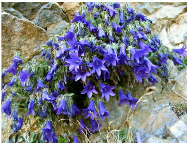
Campanula oreadum endemic to Mt Olympia

Above the forest zone rocky gullies shelter drifts of yellow Doronicum columnae and purple Geranium macrorrhizum , the latter with its characteristically musky-scented leaves. Here you might be lucky and find the odd plant of Aquilegia ottonis subsp. amaliae . On rocky slopes the endemic, silver-leaved Potentilla deorum is frequent, while on rock faces the endemic Campanula oreadum forms conspicuous blue patches. On the Plateau of the Muses, the ground is subject to solifluction, the sorting of stones and soil particles into stripes and polygonal