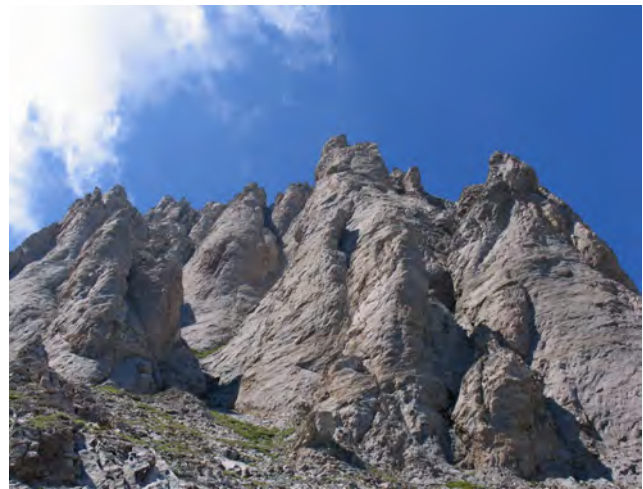
Mt. Olympus, Greece

near the Aegean coast of northern Greece. Olympus, the mythical home of the gods, is the highest mountain in