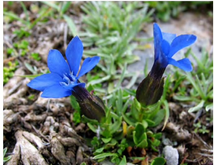
Gentiana verna subsp. balcanica

patterns by the action of freezing and thawing. The vegetation is mainly grasses, with abundant Lotus alpinus in places and a few plants of the brilliant blue Gentiana verna subsp. balcanica . The final approach to the summits of Olympus involves climbing vertical cliffs or steep gullies. The easiest route requires no climbing equipment, but you need a head for heights. It is a broad gully with 6-inch-wide rock-ledge steps