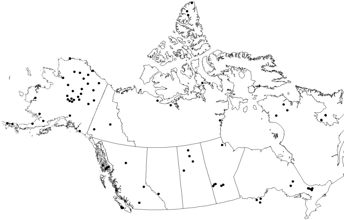
Figure 1 Geographic distribution of 80 wolf–human encounters described in the case history. Clusters of encounters in central Alaska, southeastern Ontario, southwestern Manitoba, and on Vancouver Island are associated with National or Provincial Parks. The higher density of encounters in northern Alaska resulted from a combination of wolf research activities, the trans-Alaska pipeline, rabies, and nonaggressive encounters near remote villages.