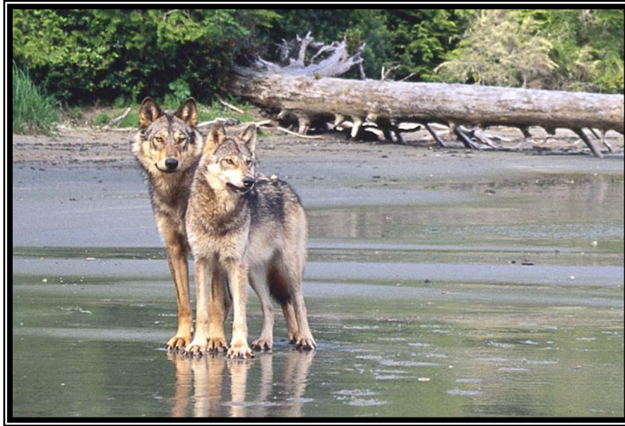
These wolves became highly habituated and food conditioned on Vargas Island, British Columbia after they were repeatedly fed by people. The male (left) subsequently attacked and severely bit a man who was in a sleeping bag at a popular campsite (Case 1).