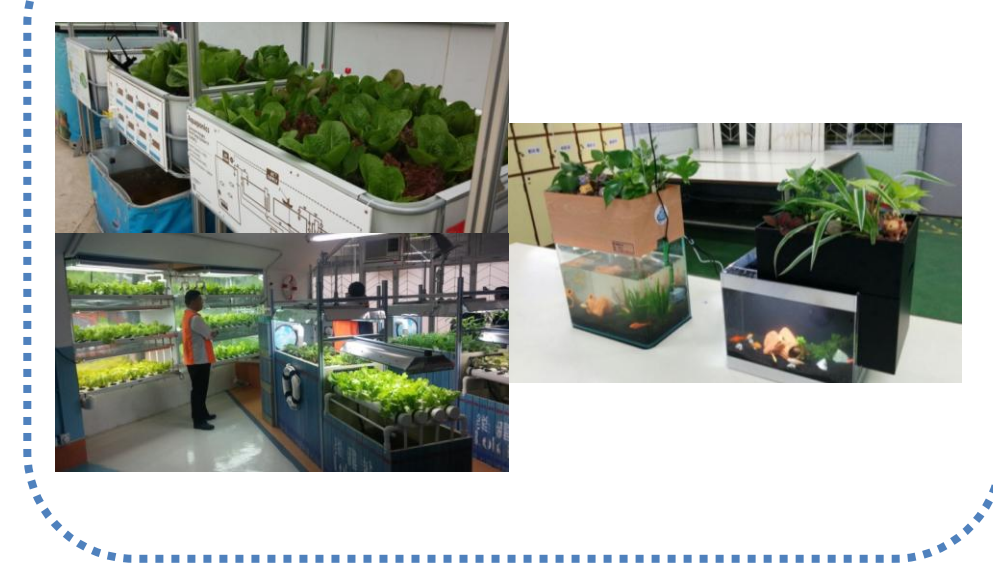
Figure 13: Aquaponics in Hong Kong