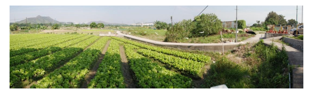
Figure 17: Farming in Hong Kong

3.3 Taking into account the public's views, the Government announced in the 2016 Policy Address the decision to implement the NAP. Major measures included establishing an Agricultural Park (Agri-Park), exploring the feasibility of designating "Agricultural Priority Areas" (APA), setting up a $500 million Sustainable Agriculture Development Fund (SADF), providing better support and assistance to help farmers move up the value chain in areas such as product marketing and brand building, and developing leisure and educational activities related to agriculture. Some of the measures, such as the establishment of the Agri-Park and the consultancy study to explore the feasibility and merits of designating APA in Hong Kong, would have implications on land use planning for agricultural uses.