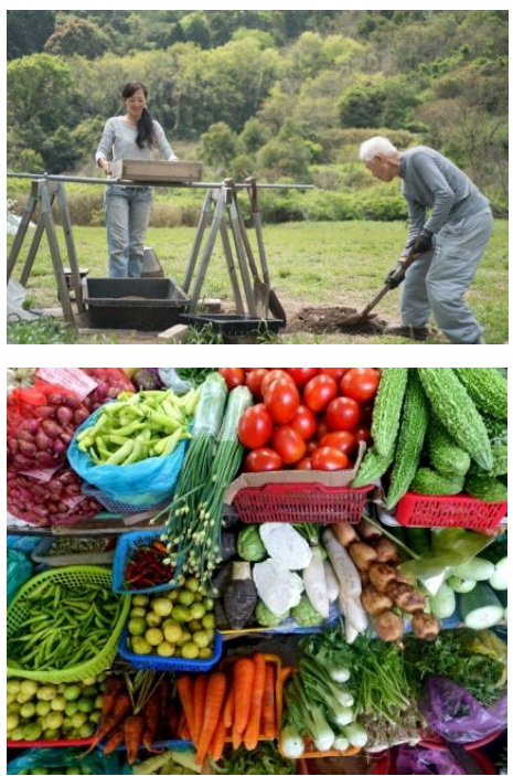
Figure 8: Organic certificate by Hong Kong Organic Resource Center