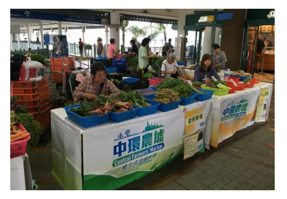
Figure 14: Farmer's Market in Hong Kong

2.9 A number of farmers' markets have been set up by private initiatives in Hong Kong to facilitate local farmers to sell their produce to local consumers. These initiatives help promote sales of local farm produce on the one hand, and provide a platform for farmers to reach out to customers. Examples include Lam Tei and Tai Po farmers' markets organized by the Federation of Vegetable Marketing Co-operative Societies, the Organic Farmers' Market at Central and Organic Farmers' Market at Kadoorie Farm and Botanical Garden by Kadoorie Farm and Botanical Garden, and Organic Farmers' market at Mei Foo by Young Men's Christian Association.