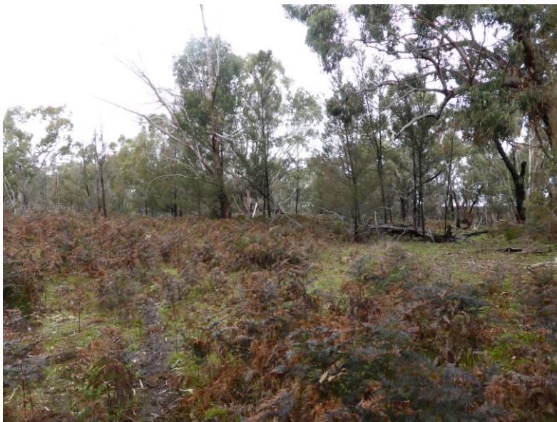
Plate 5 Barton Rd, Moyston – Sand Forest proposed for removal (August 2018)