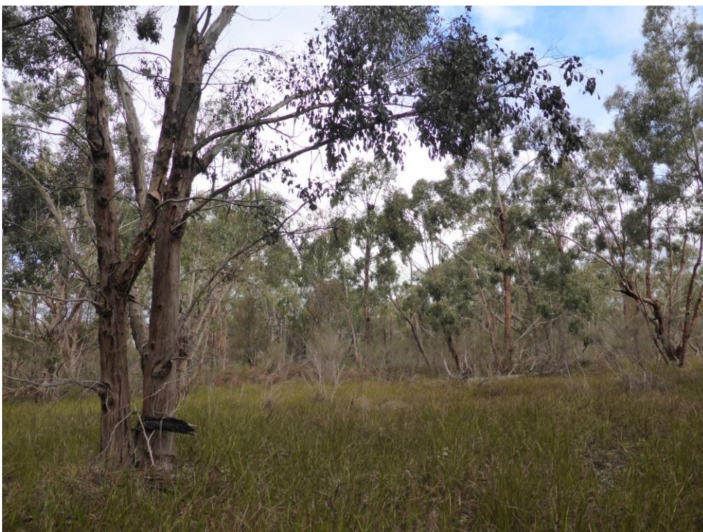
Plate 2 Barton Road, Moyston – Sedgy Riparian Woodland