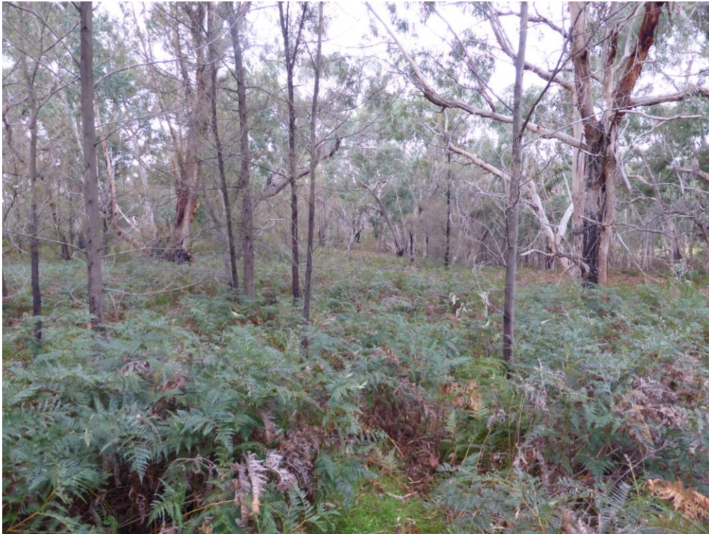
Plate 1 Barton Rd, Moyston – Sand Forest