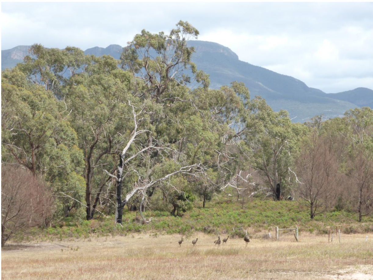
Plate 3 Barton Rd, Moyston — Open pasture adjoining Sand Forest

The remainder of the study area supports improved pasture, comprising predominantly exotic pasture grasses (see Plate 3). This area supports few habitat values relative to the woodland and forest habitat within the study area, predominantly providing foraging habitat for open-country, ground-feeding bird species, such as the Little Corella Cacatua sanguinea , Galah Eolophus roseicapilla , Australian Magpie Cracticus tibicen and Emu Dromaius novaehollandiae . Raptors, such as the Brown Falcon Falco berigora and Whistling Kite Haliastur sphenurus are also likely to forage over areas of pasture, as well as adjoining areas of woodland and forest. The Eastern Grey Kangaroo, which shelters within woodland and forest habitats during the day, is likely to move out into open pasture to feed between dawn and dusk. A small turkey-nest farm dam is located in the north-west of the property in areas of pasture. This dam supports bare banks and no aquatic vegetation, and is therefore of limited value for native fauna species.