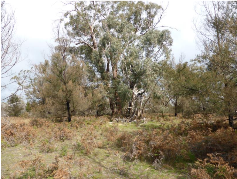
Plate 4 Barton Rd, Moyston – Sand Forest proposed for removal (August 2018)