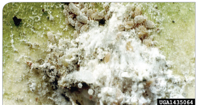
Comstock's mealybug infestation; note the white waxy covering surrounding infested plant parts