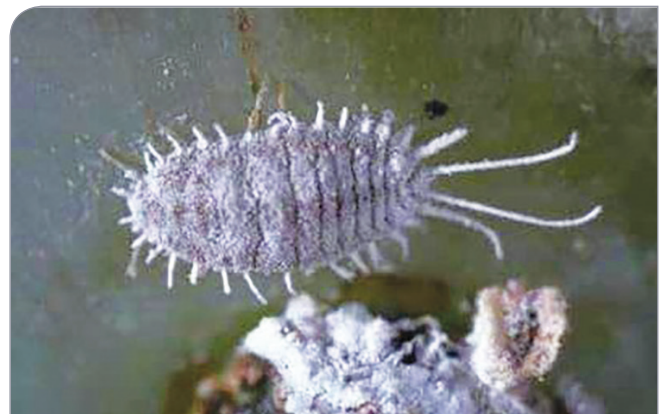
Grape mealybug; note the long tail filaments present with this species of mealybug

Martin Hauser, California Department of Food and Agriculture