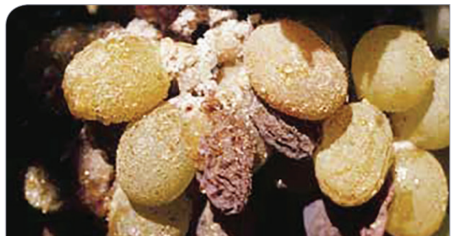
Mealybug infested grape bunch; note the white powdery wax and honeydew on grapes, which are typical symptoms of infestation