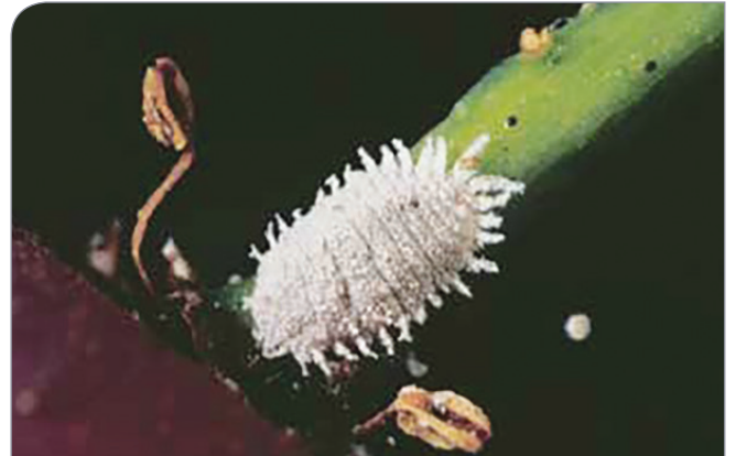
Adult vine mealybug; note that this species of mealybug does not have long tail filaments

If you observe mealybugs or signs of mealybug infestation that appear unusual or more severe than usual, or are not as responsive to normal management strategies, you should report this to the Emergency Plant Pest Hotline on 1800 084 881.