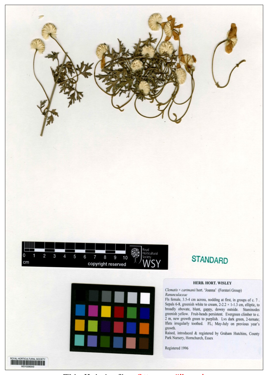
Wisley Herbarium Sheet C. × cartmanii 'Joanna'