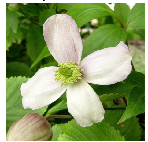
C. × vedrariensis 'Highdown'