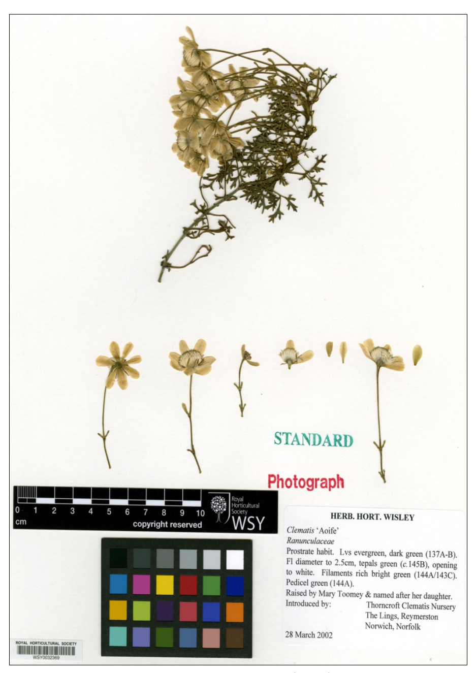
Wisley Herbarium Sheet C. 'Aoife'