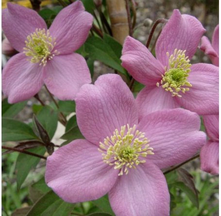
Clematis montana var. rubens 'Veitch'