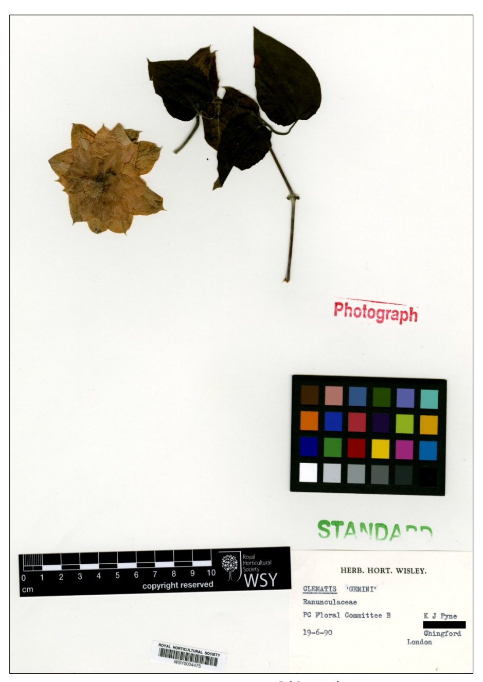
Wisley Herbarium Sheet C. 'Gemini'