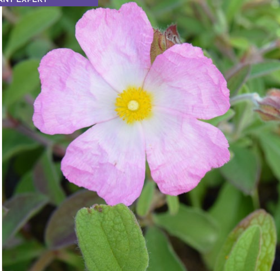
Cistus × lenis 'Grayswood Pink'

In Crete this has been collected from C. creticus and exported for centuries. This is done by dragging a rake with long thongs over the bushes – very hard work – or by letting goats browse through the bushes and cutting off their beards when enough ladanum has clung to them. Herodotus describes these methods in the 5th century BC. On 17 October 1998 a villager from the only village where ladanum is still collected handed a lump to me. I asked him how he came by it. “By cutting it from the hair of my goat,” he replied.