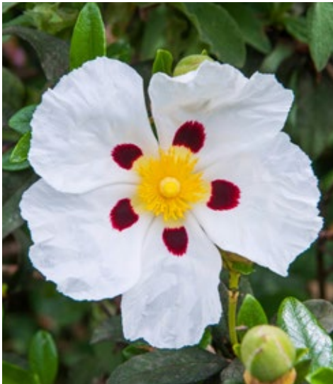
Cistus x dansereau 'Jenkyn Place'