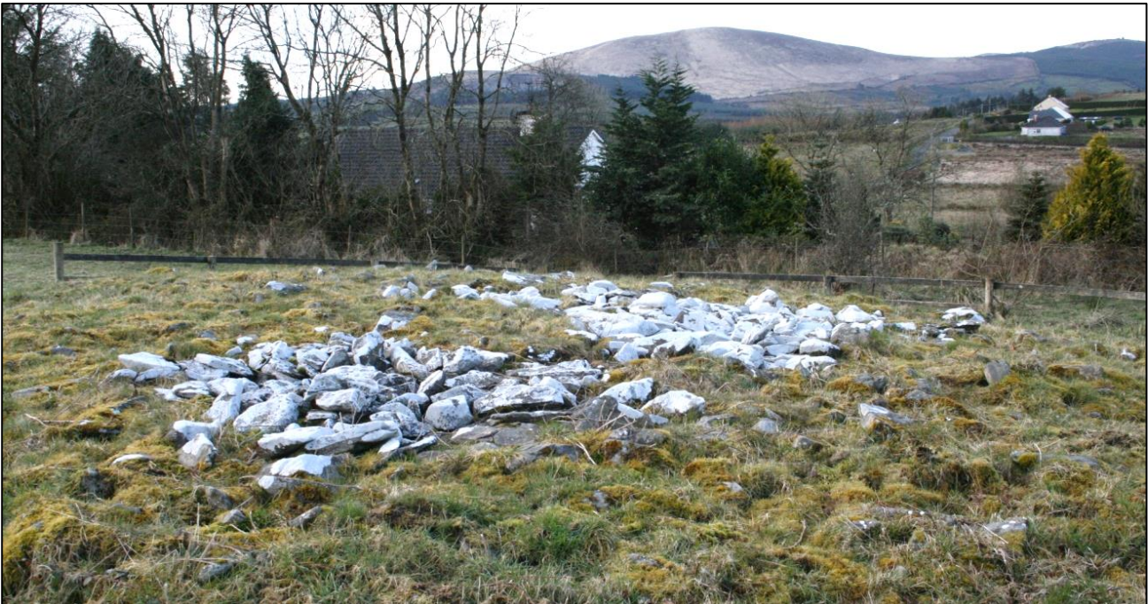
Neolithic Period: Cairn and Cist at Baurnadomeeny

Another probable Neolithic monument class is a cairn, and one such monuments is c1.1km north of the study area (UWF Grid Connection). This cairn, located at Baurnadomeeny, (TN038-007001), is located on the southwest of Mauherslieve and contains a cist burial (TN038-007002)