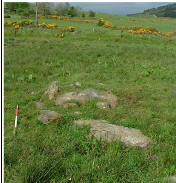
Megalithic Tomb in Knockcurraghbola Commons townland