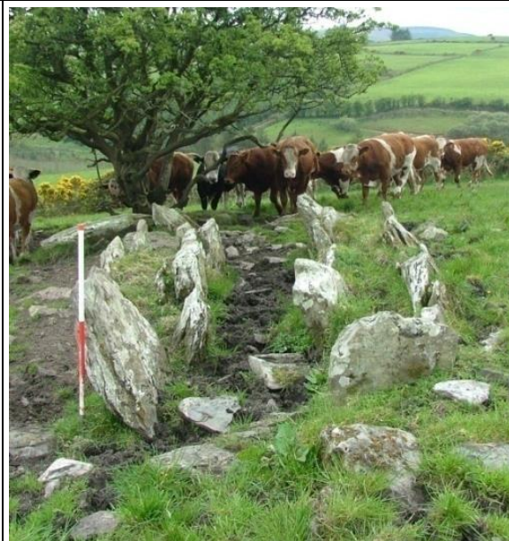
Megalithic Tomb in Knockcurraghbola Commons townland