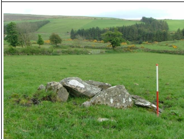
Megalithic Tomb in Knockcurraghbola Commons townland