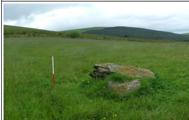
Megalithic Tomb in Knockcurraghbola Commons townland