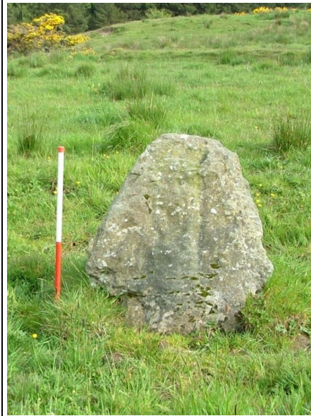
Standing Stone in Knockcurraghbola Commons