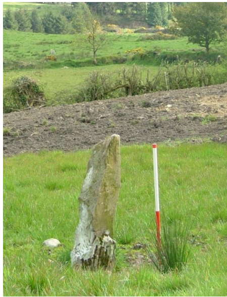
Standing Stone in Knockcurraghbola Crownlands

striking pattern: they are overwhelmingly placed at positions which overlook the numerous rivers and streams.