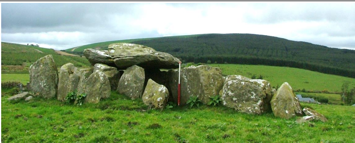
Wedge Tomb in Knockcurraghbola Commons townland

Elsewhere, excavations at the Baurnadomeeny Wedge tomb (c800m north of the proposed UWF Grid Connection) by O’Kelly yielded 21 burials and a range of flint tools (Raleigh 1985). A distribution analysis of the tombs of the study area and the immediate surroundings of the Silvermine Mountains revealed that these types of burial monuments were not on the summits of hills like in the Neolithic but were more generally on lower lying, sloping land. The Wedge tombs are associated with a series of rivers and streams that ultimately flow into the River Shannon, with the exception of the Knockcurraghbola Commons group, which are at the juncture where streams flow to both the Bilboa River (and on to the Shannon) and the Turraheen River, which connects with the Suir River.