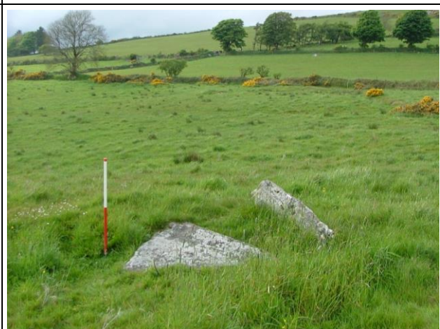
Megalithic Tomb in Knockcurraghbola Commons townland