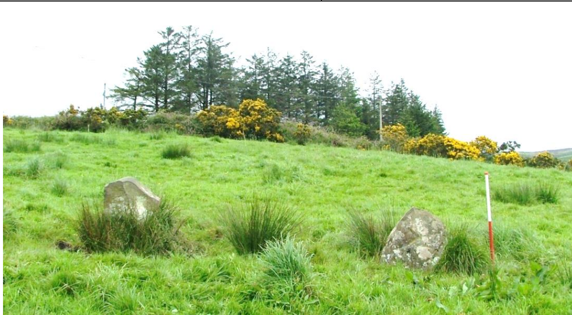
Stone Row in Knockcurraghbola Commons

Test excavations were also carried out in the vicinity of the Stone Row in Knockcurraghbola Commons townland (shown in the photo directly above) by the author in 2017 as part of the EIAR studies for the UWF Related Works project. The investigation revealed nothing of archaeological significance.