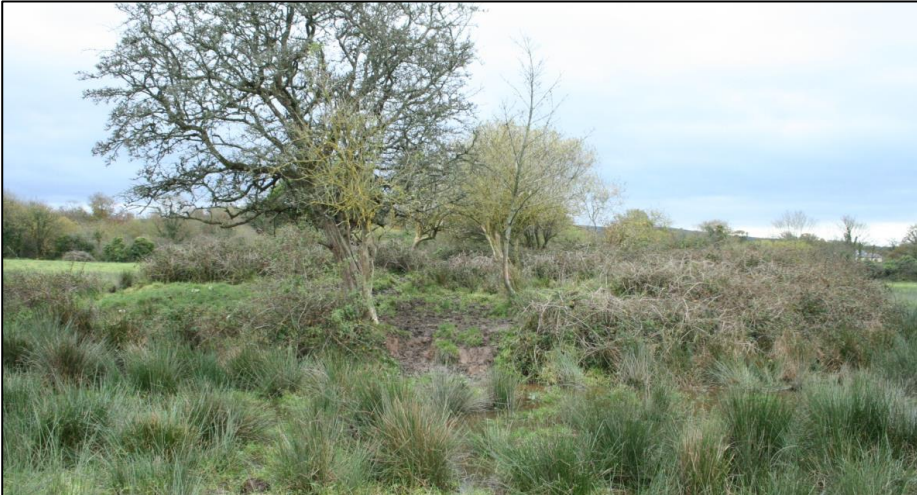
Site GL13 - Bowl Barrow from south

No work has been carried out on any of the examples from within the study area to more accurately date these monuments. As with the earlier megalithic examples there is a high concentration of these monuments evident in the wider landscape of the development area. One example, a well preserved bowl-barrow (Site GL13) is located c.125m from the UWF Grid Connection development area.