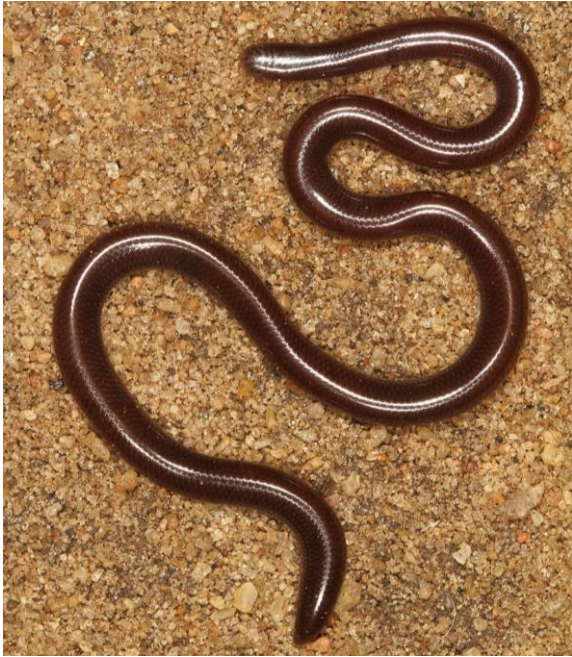
Dorsal view of living specimen from Sri Lanka.