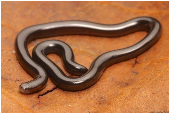
Specimen from Florida, USA, catalogued as UF 191326.