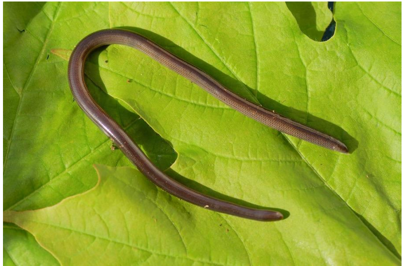
Third locality specimen from Cheshire, Massachusetts, 2008.