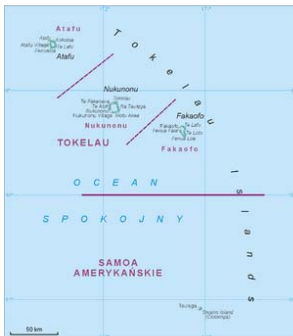
Map of all Tokelau Islands. Swains Island is shown to the south

Tokelau comprises three atolls in the South Pacific Ocean, approximately midway between Hawaii and New Zealand, and about 500 km north of Samoa.