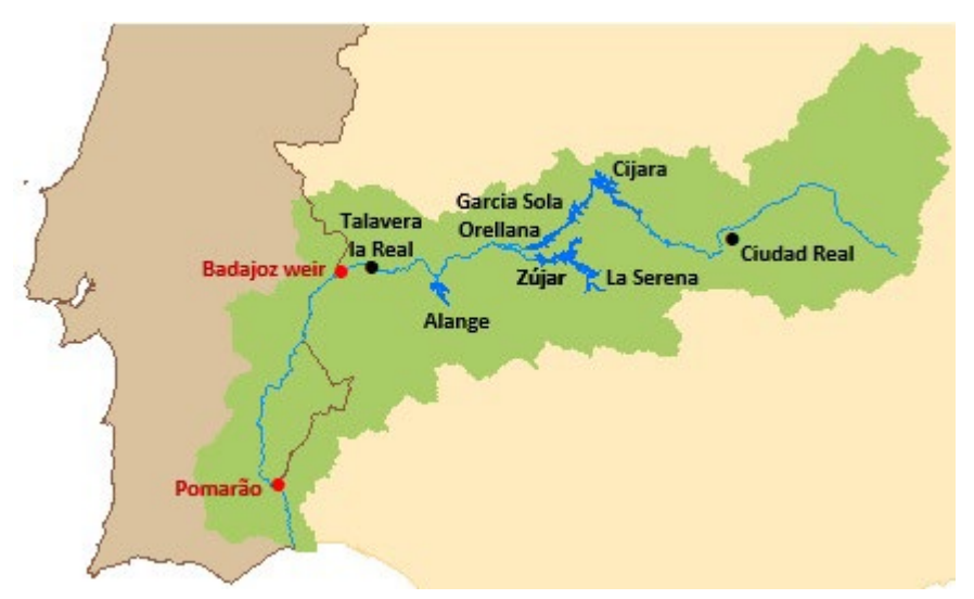
Figure 2: Variables used to define the minimum flow regimes of the Albufeira Convention in the Badajoz weir and Pomarão hydrometric station sections, in the Guadiana river basin.

When comparing the MFR defined in the Albufeira Convention with the EF defined in the Spanish Hydrological Plan (SHP), it is possible to verify that, in the Badajoz section, in terms of quarterly values, the EF defined in the SHP: