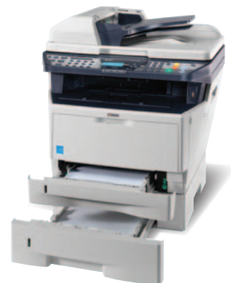
Product depicted includes optional extras.

Windows Vista and the Windows Vista logo are trademarks or registered trademarks of Microsoft Corporation in the United States and/or other countries.