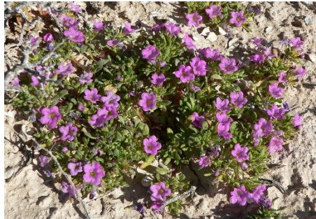
Purple Mat Nama demissum Borage ( Boraginaceae ) Tivimaasita Seeds eaten as a mush.