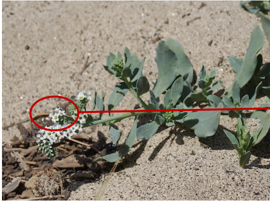
Seaside Heliotrope Heliotropium curassavicum Borage ( Boraginaceae )