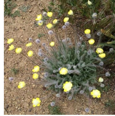
Cream Cups Platystemon californicus Poppy ( Papaveraceae )