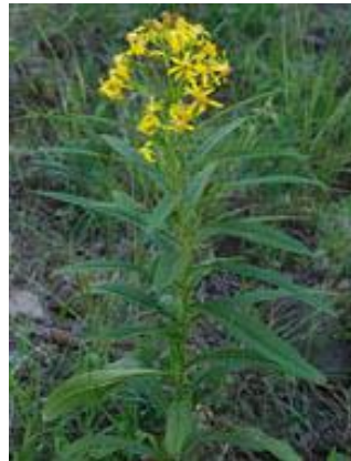
Ragwort Packera breweri Sunflower ( Asteraceae )