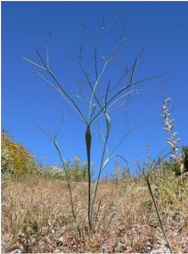
Desert Trumpet Eriogonum inflatum Buckwheat ( Polygonaceae ) tiniporobi In August, seeds were pounded and eaten dry or mixed with water. Also used for pipes, with tobacco placed in the swollen part.