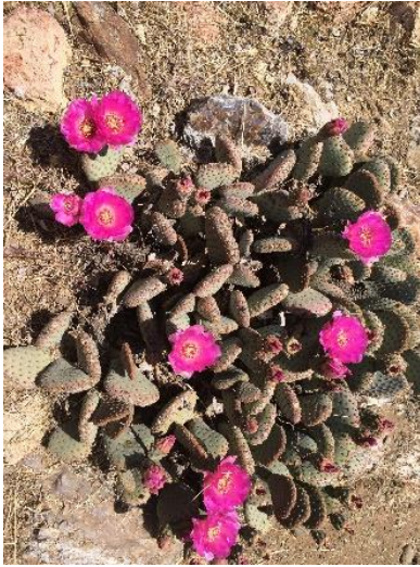
Beavertail Cactus Opuntia basilaris Cactus ( Cactaceae ) navu Spring buds were cooked and eaten.