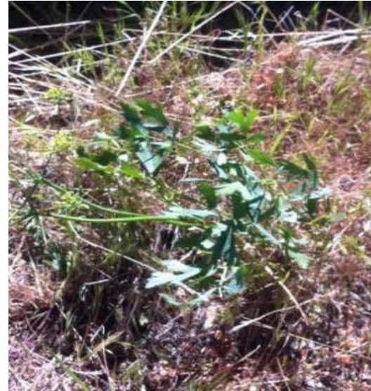
Wild Celery Apium graveolens Parsley ( Umbelliferae ) Smells like celery. Not native to Tomo Kahni; introduced. Grows only in the rocks on the trail to the cave.