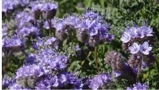
Phacelia/Caterpillar Phacelia tanacetifolia Borage ( Boraginaceae )