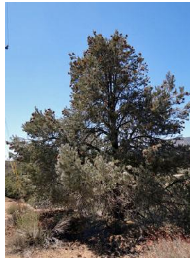
Single Leaf Pinyon Pine Pinus monophylla Pine ( Pinaceae ) tivapi Pinon nuts may have been regarded as a favorite food. Green cones collected in August were placed in a fire pit; raw nuts were removed and pounded into a meal for gruel. Ripe cones were collected in September. Nuts were roasted or boiled into a mush. Pine pitch was used to waterproof baskets and smeared on cuts as a salve. The stars in the Milky Way ( tuva tove ) are pinyon nuts leading to the mountains.