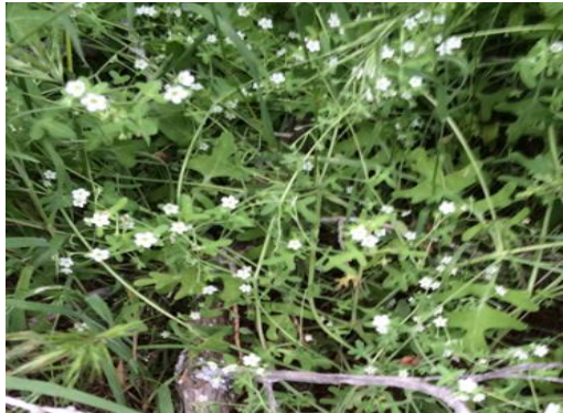
White Fiesta Flower Pholistoma membranaceum Borage ( Boraginaceae ) Kaawanavi