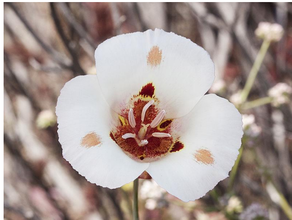
Mariposa Lily (white) Calochortus venustus Lily ( Liliaceae )