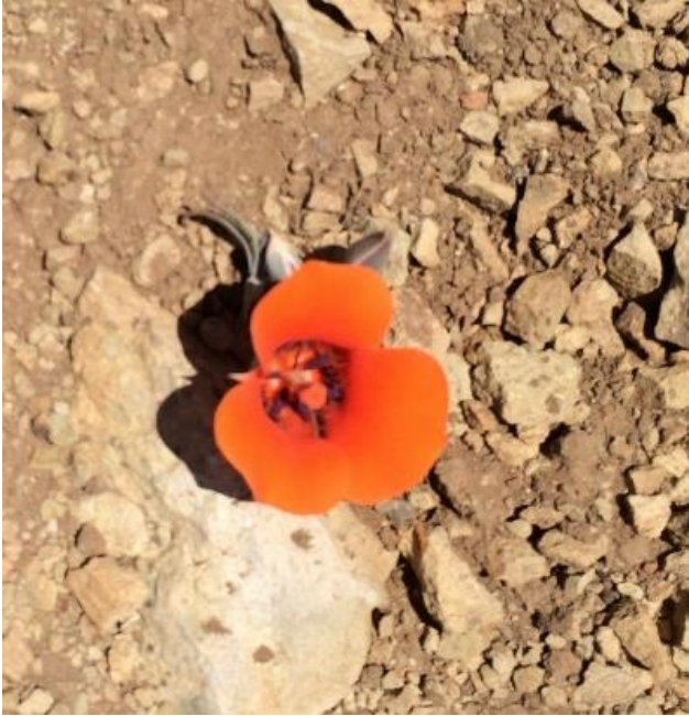
Mariposa Lily (orange) Calochortus kennedyi Lily ( Liliaceae ) Bulbs were used for food. Picked to prevent over-harvesting.