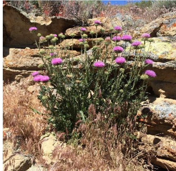
Thistle Cirsium occidentale Sunflower ( Asteraceae ) ciiyavi In the spring, the stems were skinned and eaten raw.