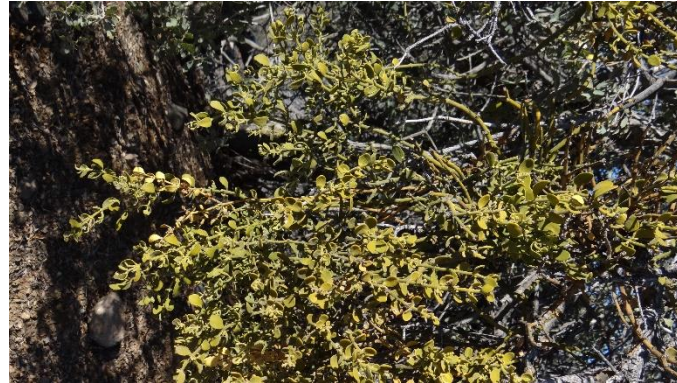
Oak Mistletoe Phoradendron leucarpum Mistletoe ( Viscaceae )