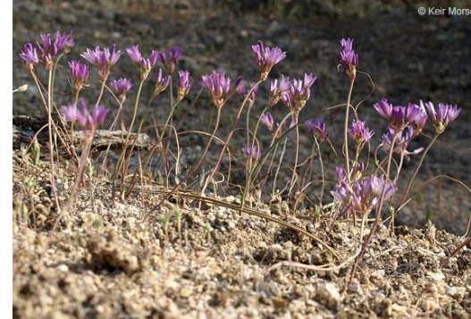
Mojave Allium (aka Mojave Onion) Allium fimbriatum Lily ( Liliaceae ) hagaziizi Roots and top were eaten raw and fresh.