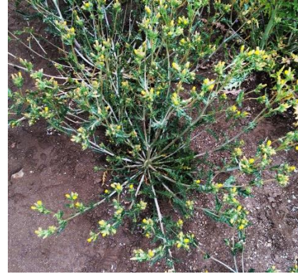
Small-flowered Blazing Star (aka White-stemmed Stick Leaf) Mentzelia albicaulis Loasa ( Loasaceae ) ku uvi Seeds collected in June. Knocked with seed beater and placed in seed gathering basket. Oils expressed from grinding the seed meal becomes like peanut butter.