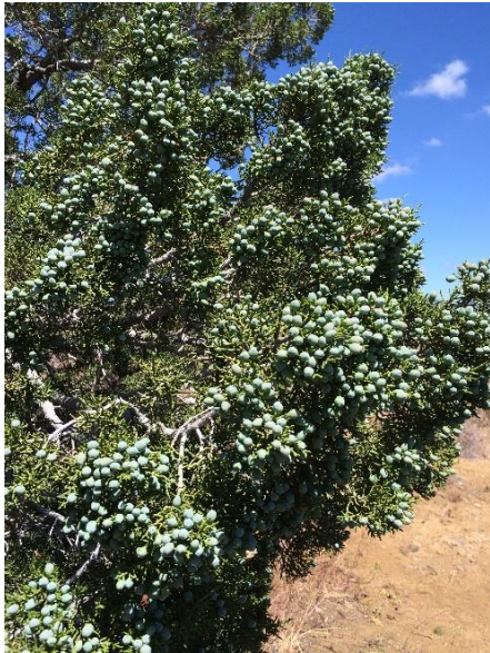
California Juniper Juniperus californica Cypress ( Cupressaceae ) wa adabi Provided an important source of food and manufactured items. Around August, juniper berries were knocked into a winnowing basket or gathered. Berries may be boiled fresh or dried and eaten or boiled. Meal was made from seeded berries and made into cakes. Juniper wood was the primary material for making bows. Juniper bark was used for lining diapers.