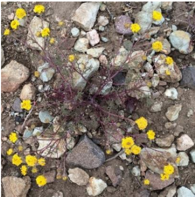
Pebble Pincushion Chaenactis glabriuscula Sunflower ( Asteraceae )