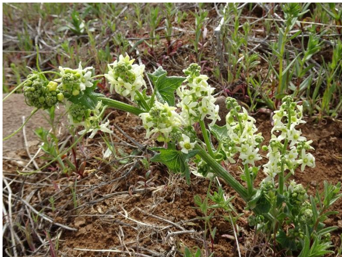
California Manroot Marah fabacea Cucumber ( Cucurbitaceae ) parivibi Known for having a very long root. Seeds were roasted & mashed; used to treat sores, baldness, & earaches. Zigmond identified as Marah horrida .