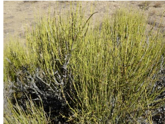
Desert Tea Ephedra viridis and Ephedra nevadensis Ephedra ( Ephedraceae ) tutupivi Stems were brewed into a tea. Wood provided the best charcoal for tattooing. Designs were made and scratched in with a horsebrush thorn.