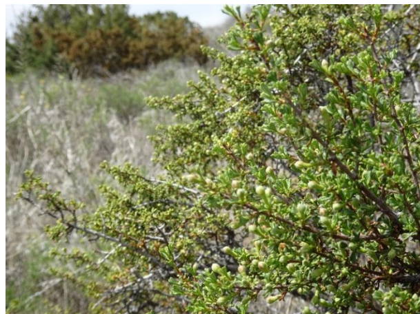
Antelope (Desert) Bitterbrush Purshia tridentata (var. glandulosa ) Rose ( Rosaceae ) hinavi Leaves and inner bark were used to make tea. Also used as an emetic, as a strong laxative, and to treat gonorrhea.