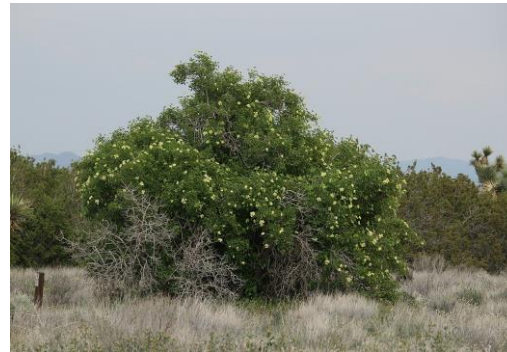
Blue Elderberry Sambucus nigra Honeysuckle ( Caprifoliaceae ) Kunuguvi