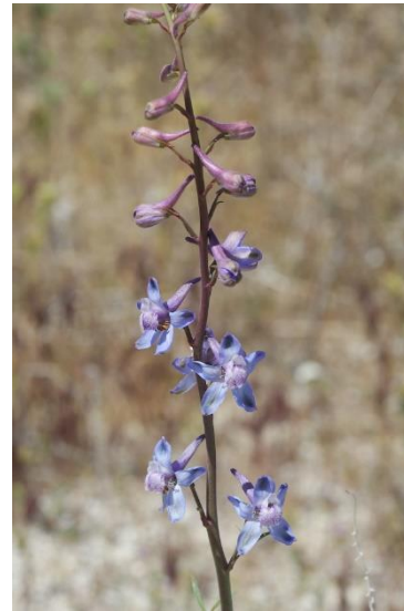
Parish's Larkspur Delphinium parishii Buttercup ( Ranunculaceae ) motoobi Root was dried and ground. Water added to make a salve for swollen limbs.