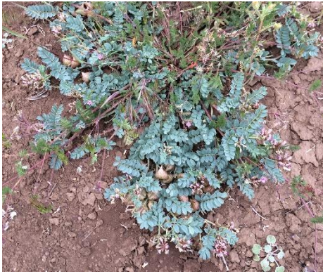
Freckled Milkvetch Astragalus lentiginosus Legume/Pea ( Fabaceae )