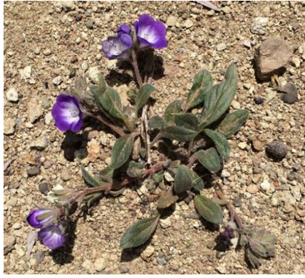
Baby Purple Eyes Nemophila menziesii Borage ( Boraginaceae )