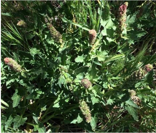
Curly Dock Rumex crispus Buckwheat ( Polygonaceae ) avaanaribi Stems boiled with sugar (like rhubarb) or roasted in hot ashes. Inner pulp pushed out of burned skin and eaten like a banana. Seeds cooked into a thick gravy. Root is dried or mashed and mixed with water to form a salve for cuts and sore limbs.