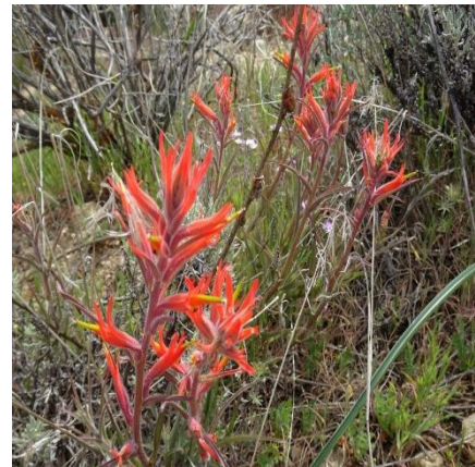
Desert Paintbrush Castilleja linearifolia Figwort ( Scrophulariaceae ) agakibibi Semi-parasitic spring plant; grows on roots of another species.