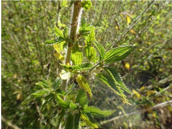
Stinging Nettles Urtica dioica Goosefoot ( Urticaceae ) kwichizi ataa (Bad Plate) One of the four medicines. Acts as counter-irritant to treat arthritis. Poultice made from leaves was used to treat sores, sore limbs and headaches. Dry stems were used to make cordage.