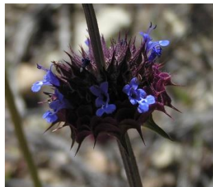
Chia Salvia columbariae Mint ( Lamiaceae ) pasidabi Seeds very nutritious. Pounded and mixed with water to make a beverage or a dish thicker than mush. Seed placed in eyes to create a film to clear irritation.