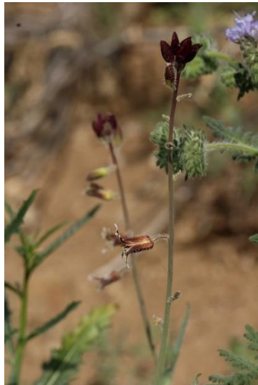
Coulter's Jewel Flower Caulanthus coulteri Mustard ( Brassicaceae )