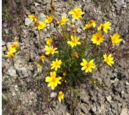
Coreopsis (aka Tickseed) Leptesyne bigelovii Sunflower ( Asteraceae ) tihividibi Important seed source in spring. Cut off at base before blooming; eaten fresh or cooked. In the mythology, the next thing eaten after deer was tihividibi. Included in other myths as well