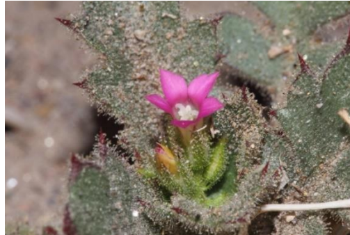
Broad-leaved Gilia Alicielia latifolia Phlox ( Polemoniaceae ) sanawagadibi (means sticky) Leaves are sticky.