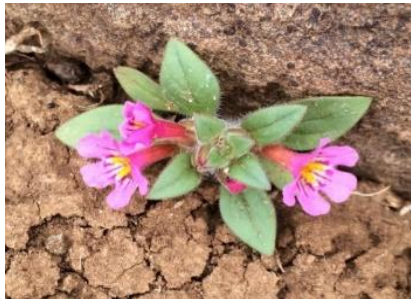
Monkey Flower Mimulus fremontii Figwort ( Scrophulariaceae )