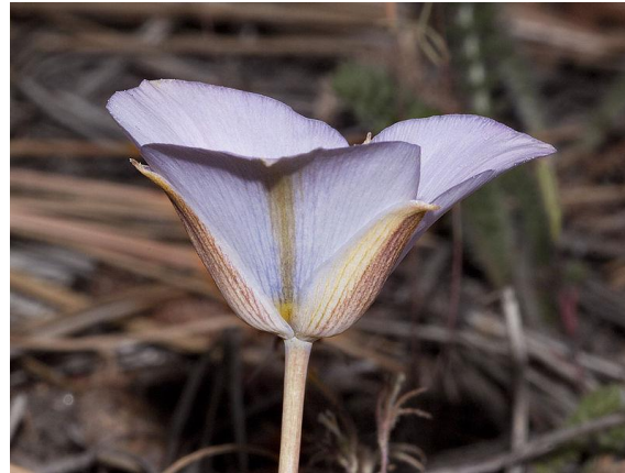
Mariposa Lily (pinkish-white) Calochortus invenustus Lily ( Liliaceae )