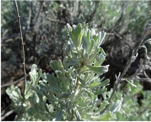
Great Basin Sage Artemisia tridentata Sunflower ( Asteraceae ) sohovi Used for making fire, roasting pinyons, relief of headache, coughs, or colds. Red pitch deposits were used for knife handles. Bark was used for shoe lining and water bottle stoppers.