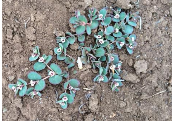
Thyme-leaf Spurge (aka Thyme-leaf Sandmat) Euphorbia serpyllifolia Spurge ( Euphorbiaceae ) tivi kagivi Milky sap is mildly poisonous; wide-spread reputation as remedy for rattlesnake bites.