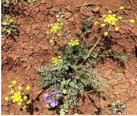
Desert Parsley Lomatium utriculatum Parsley ( Apiaceae ) koovoo Plant above root cooked and eaten. Inipi feared smoke from the dried root.