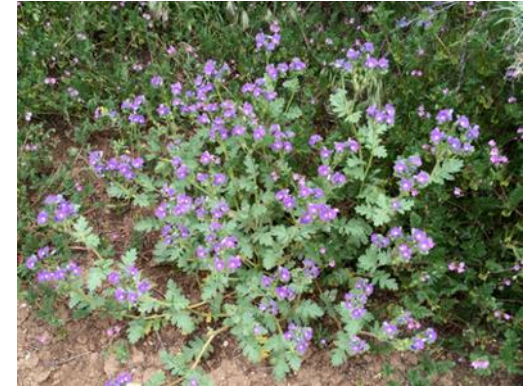
Blue Flower Phacelia ciliata Borage ( Boraginaceae )