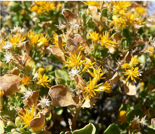
Wedge-leaf Golden Bush Ericameria cuneate Sunflower ( Asteraceae )