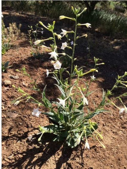
Wild Tobacco Nicotiana quadrivalvis Nightshade ( Solanaceae ) Soo n di One of the four medicines; said to scare away Inipi. Leaves were smoked by men at night. Preparation mixed with lime was chewed by men, women & children at any time. When chewed, causes vomiting and cleans out the stomach. Stops bleeding, treats earache, headache and stuffy nose. The only plant cultivated during the course of its growth.