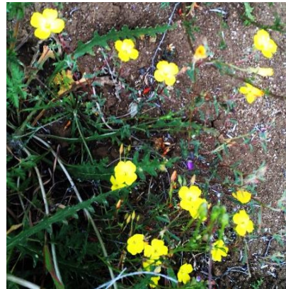
Mojave Sun Cups Camissonia campestris Evening Primrose ( Onagraceae )