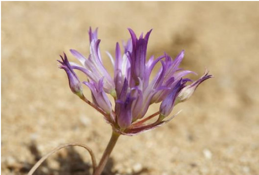
Desert Hyacinth Dichelostemma capitatum Lily ( Liliaceae ) yoogivi Long anthers make it look like caterpillars. Used to make glue to seal seed-gathering baskets.