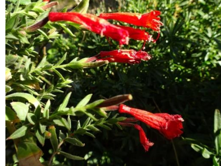
California Fuchsia Epilobium canum Evening Primrose ( Onagraceae ) agakidibi