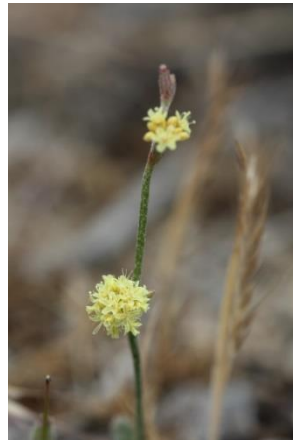
Nude Buckwheat Eriogonum nudum var. westonii Buckwheat ( Polygonaceae ) paako oribi Used for drinking straws and pipes. Roots were boiled to make a tea used for coughs and colds.