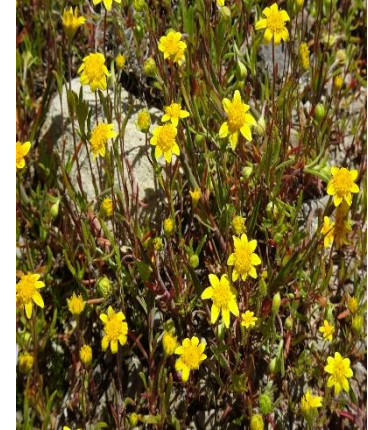
Goldfields Lasthenia californica Sunflower ( Asteraceae ) Grows in big fields of yellow.