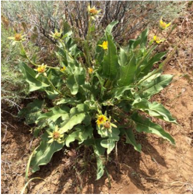
Arrow-leaved Balsam Root Balsamorhiza sagittata Sunflower ( Asteraceae ) witta Tea made from root used to treat coughing.