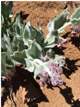
California Milkweed Asclepias californica Dogbane ( Apocynaceae ) Dried and ground into powder; applied to black widow spider bites.