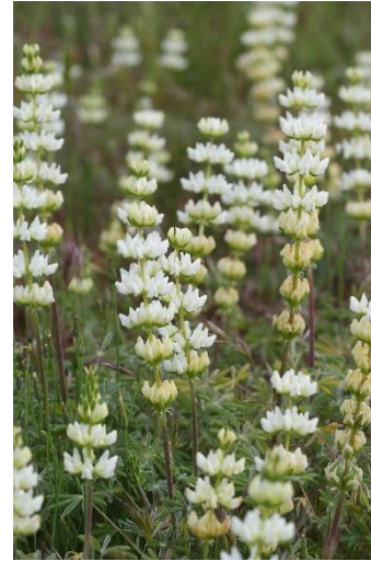
White Whorl Lupine Lupinus microcarpus var. densiflorus Legume/Pea ( Fabaceae )