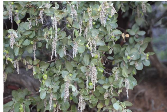
Silk Tassel Garrya flavescens Silk Tassel ( Garryaceae ) waahyu uribi (wild quinine) Leaves were brewed to make a medicine that is greenish, bitter and strong. Informants varied on uses, but they included stomach ache, gonorrhea, and/or as a laxative.