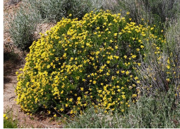
Goldenbush Ericameria linearifolia Sunflower ( Asteraceae ) sanaco ovibi Decoction made from brewing leaves and flowers applied to limbs to treat rheumatism and to treat soreness, bruises.