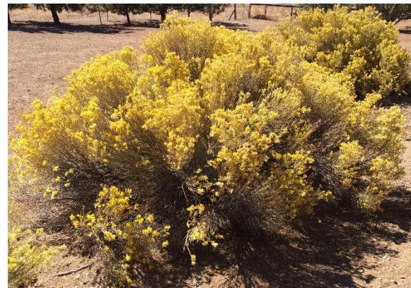
Rabbitbrush (Rubber Rabbitbrush) Ericameria nauseosa Sunflower ( Asteraceae) tiv aposuri A twig, stripped of bark and leaves, was sharpened to a point. Pinyon nuts were threaded onto the twig and left there until eaten. The twig was said to improve the flavor of the pinyon nuts.