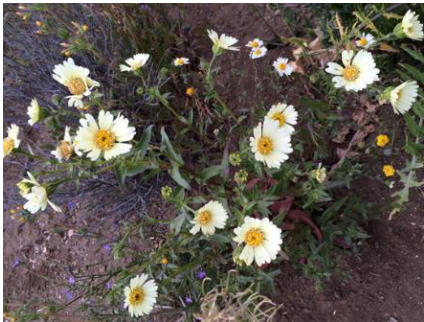
Pale Yellow Layia Layia heterotricha Sunflower ( Asteraceae ) Smells like turpentine. Likes self-cultivating clay loam.