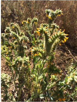
Fiddleneck Amsinckia tessellata Borage ( Boraginaceae ) tiva nibi Source of greens in the early spring. Leaves peeled off, bruised by rubbing and eaten with salt. Poisonous to livestock due to nitrate uptake.