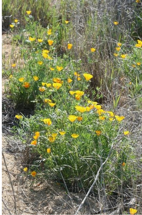
California Poppy Eschscholzia californica Poppy ( Papaveraceae )