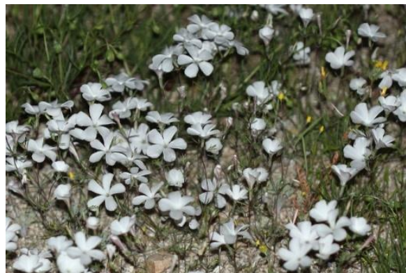
Evening Snow Linanthus dichotomus Phlox ( Polemoniaceae ) tutuvinivi From Kawaiisu Ethnobotany : “These flowering plants were once people at Olancha. At evening, after the sun went down, they would wake up and tell one another that they would go such and such a distance to hunt the next day. But in the morning they would fall asleep again. That’s why the flowers bloom at night.”