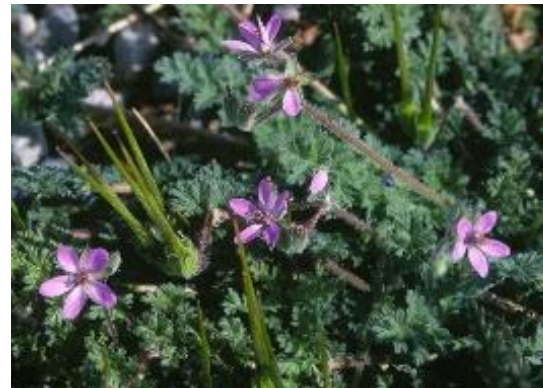
Filaree (Heron's Bill, Stork's Bill) Erodium cicutarium Geranium ( Geraniaceae)