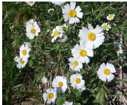
Tidy Tips Layia glandulosa Sunflower ( Asteraceae )