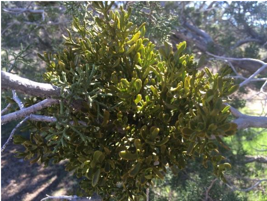
Juniper Mistletoe Phoradendron juniperium Mistletoe ( Viscaceae)