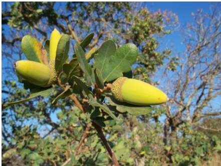
Blue Oak Quercus douglasii Oak/Beech ( Fagaceae ) ma ahnidibi Oak acorns constituted the most important vegetal food source for the Nuwa. Of the 7 types of oaks in the area, Blue Oak acorns may have been the least bitter. Acorns were gathered in October/November. They were processed by shelling, pounding, leaching and cooking. The wood was used for home utensils. Medicinal uses included cures for burns, arthritis and sores.