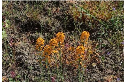
Western Wallflower Erysium capitatum Mustard ( Brassicaceae )