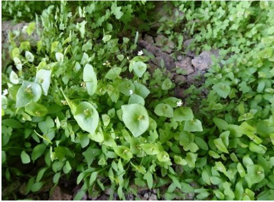
Miner's Lettuce Claytonia perfoliata Miner's Lettuce ( Montiaceae ) Uutuk a ribi High in Vitamin C; eaten to prevent scurvy.