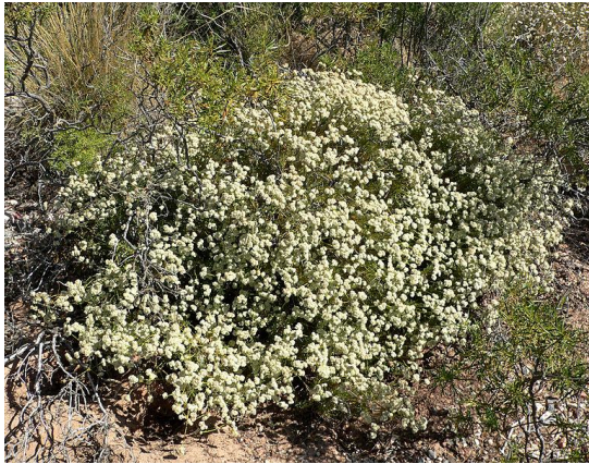
California Buckwheat Eriogonum fasciculatum Buckwheat ( Polygonaceae ) sagiavi Stems were sharpened and used for ear piercing. Leaves were used for lining acorn granaries.