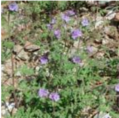
Common Phacelia (Wild Heliotrope) Phacelia distans Borage ( Boraginaceae ) yah itibi Spring greens boiled and eaten.