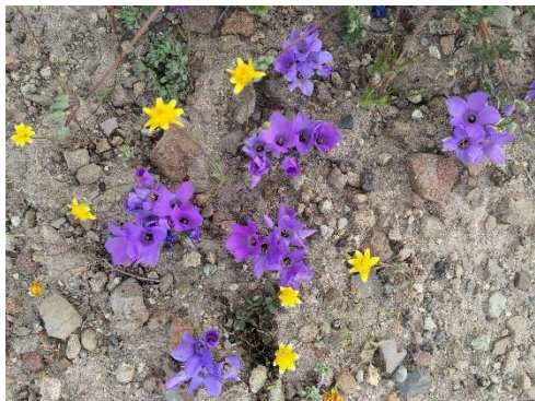
Parry's Linanthus (Sandblossoms) Linanthus parryae Phlox ( Polemoniaceae ) puciviici