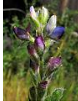
Bajada Lupine Lupinus concinnus Legume/Pea ( Fabaceae )