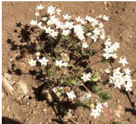
Linanthus Phlox Phlox ( Polemoniaceae )