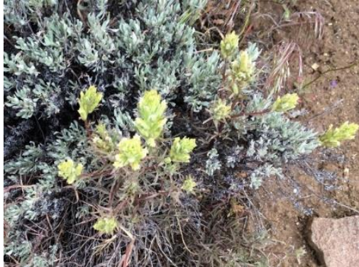
Owl's Clover (aka Mojave Indian Paintbrush) Castilleja plagiotoma Figwort ( Scrophulariaceae ) Semi-parasitic spring plant; grows on roots of another species.