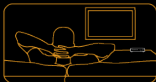
In your living room...