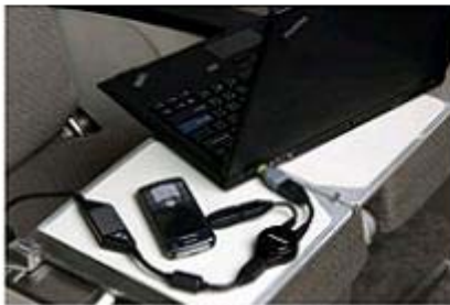
DC power: Air Travel environment