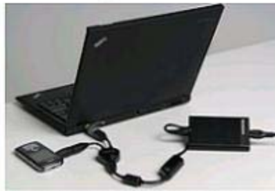
AC Power: Office, home environment