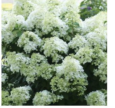
BOBO® Hydrangea paniculata