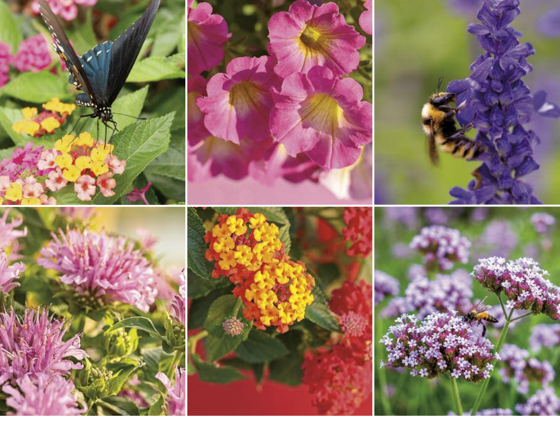
Above, clockwise from upper left: LUSCIOUS® BERRY BLEND™ Lantana, SUPERTUNIA® Daybreak Charm Petunia, ROCKIN'® PLAYIN' THE BLUES® Salvia, METEOR SHOWER® Verbena, LUSCIOUS® CITRUS BLEND™ Lantana and 'Pardon My Lavender' Monarda

Love these birdhouses? Get the sources and see how we assembled our own at provenwinners.com/birdhouse. You'll also find a handy list of plants for pollinators there.