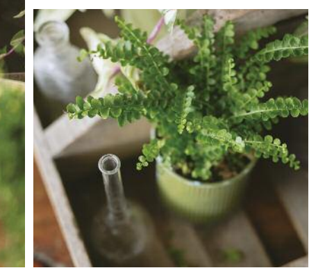
Natural materials like wood, metal and glass are ideal for showcasing plants that breathe oxygen into the space while cleaning the air. Spend as little as ten minutes in a space like this and you'll find that your mind is clearer, daily stressors are easier to bear, and you have a boost of energy to take on the day.