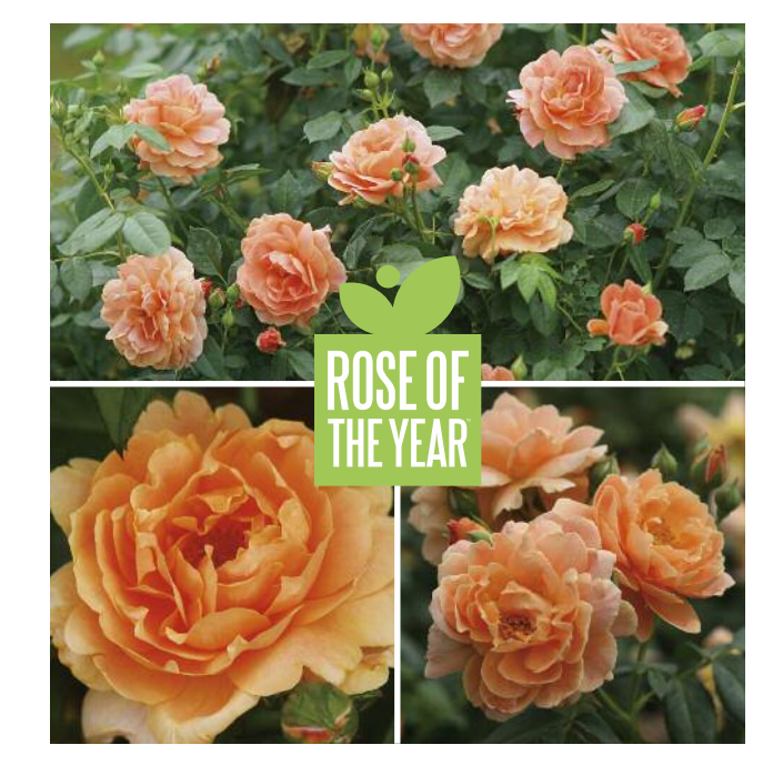
AT LAST® Rosa

Find tips on how to grow all of our National Plants of the Year at national plantoftheyear.com.