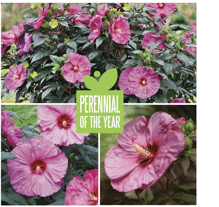
SUMMERIFIC® 'Berry Awesome' Hibiscus

Unbeatable flower power from midsummer into fall is what you'll get every year with this tropical looking yet cold hardy, robust perennial.