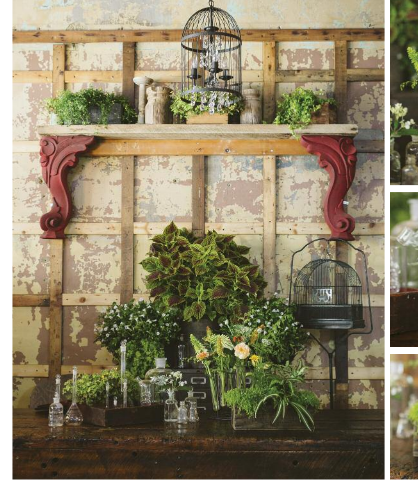
Above: 'Variegatum' (Spider Plant) Chlorophytum comosum, Goldilocks Lysimachia, GOLDDUST® Mecardonia, MOLTEN LAVA™ Oxalis, Scotch Moss Sagina, COLORBLAZE® GOLDEN DREAMS™ Solenostemon (Coleus) and CATALINA® White Linen Torenia

Opposite page: PEGASUS® Begonia , Heart of the Jungle Colocasia , Glacier Hedera , Goldilocks Lysimachia , GOLDDUST® Mecardonia , CHARMED® Wine Oxalis , MOLTEN LAVA™ Oxalis , Button Fern Pellaea rotundifolia , Scotch Moss Sagina , COLORBLAZE® GOLDEN DREAMS™ Solenostemon (Coleus) and COLORBLAZE® TORCHLIGHT™ Solenostemon (Coleus)