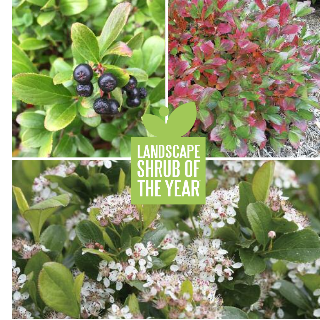
LOW SCAPE® Mound Aronia

Unbeatable flower power from midsummer into fall is what you'll get every year with this tropical looking yet cold hardy, robust perennial.