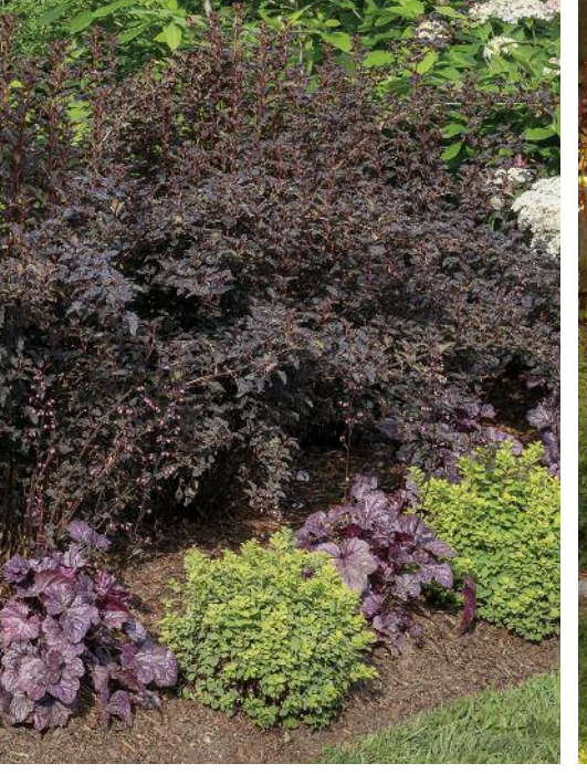
Above: SUMMER WINE® Black Physocarpus, GLOW GIRL® Spiraea, DOLCE® 'Wildberry' Heuchera

Native gardens are meant to be cyclical in nature, providing nourishment and livable spaces for pollinators as they migrate through the area. Here, a native ninebark offers food for native bees in late spring before hummingbirds arrive to sip from the coral bells in early summer. Native diervillas, coneflowers, penstemon and phlox cater a summer-long feast for the eyes of pollinators and gardeners alike. With careful selection, your natives can bring color to the garden in every season.