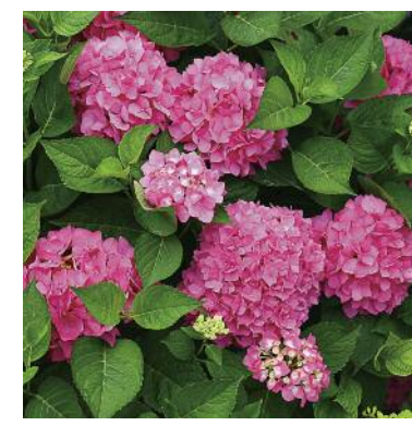
LET'S DANCE® RAVE® Hydrangea macrophylla

LET'S DANCE® RHYTHMIC BLUE® Hydrangea macrophylla, FIRE LIGHT® Hydrangea paniculata, INVINCIBELLE® Ruby Hydrangea arborescens, TUFF STUFF AH-HA® Hydrangea serrata and GATSBY STAR® Hydrangea quercifolia