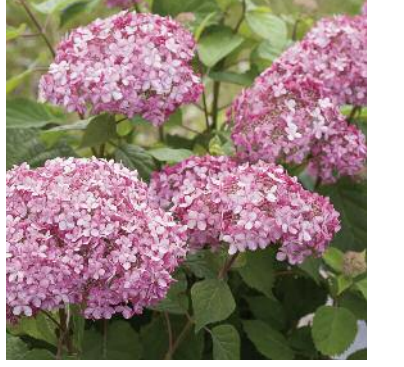
INVINCIBELLE® Spirit II Hydrangea arborescens