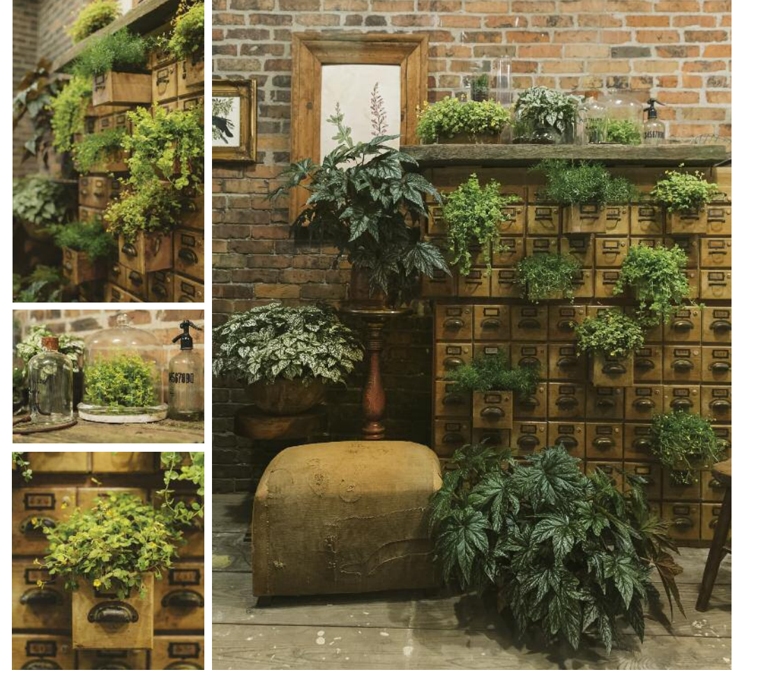
Above: PEGASUS® Begonia , HIPPO® Pink Hypoestes , Goldilocks Lysimachia , GOLDDUST® Mecardonia and 'Sprengeri' (Asparagus Fern) Asparagus densiflorus

Opposite page: PEGASUS® Begonia , Heart of the Jungle Colocasia , Glacier Hedera , Goldilocks Lysimachia , GOLDDUST® Mecardonia , CHARMED® Wine Oxalis , MOLTEN LAVA™ Oxalis , Button Fern Pellaea rotundifolia , Scotch Moss Sagina , COLORBLAZE® GOLDEN DREAMS™ Solenostemon (Coleus) and COLORBLAZE® TORCHLIGHT™ Solenostemon (Coleus)