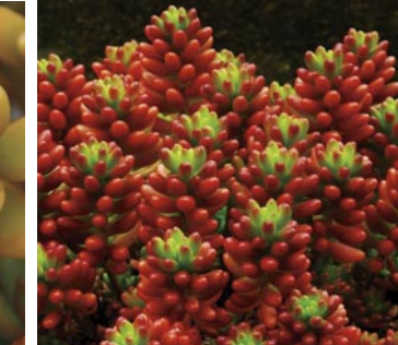
Brown Bean Sedum Sedum rubrotinctum