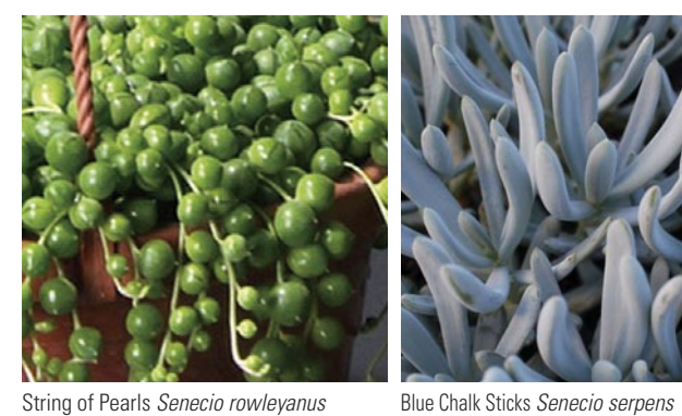
String of Pearls Senecio rowleyanus