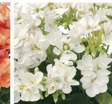
DAREDEVIL® Rosita Pelargonium (Geranium) DAREDEVIL® Salmon Pelargonium (Geranium) DAREDEVIL® Snow Pelargonium (Geranium)

Begonia SUMMERWINGS® Series (continued) Nordic