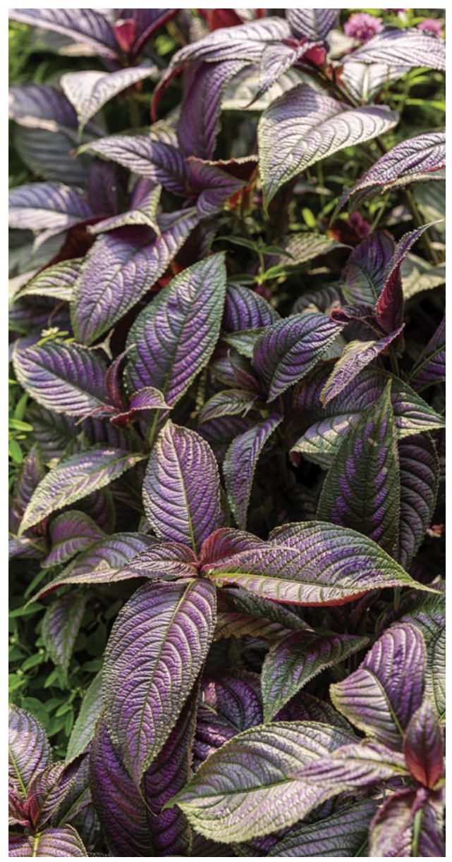
Persian Shield Strobilanthes dyerianus in the landscape.

ROCKIN'® 'Golden Delicious' Salvia elegans <sup>USPP17977</sup>