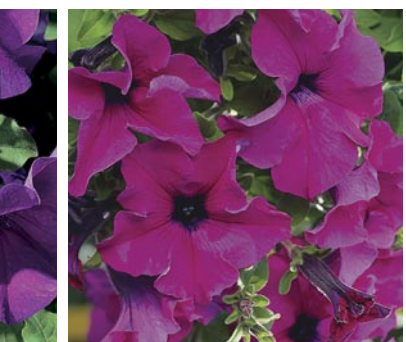
SURFINIA® Giant Purple Petunia

ZINFANDEL<sup>™</sup> Oxalis vulcanicola