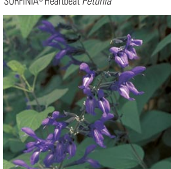
Black & Blue Salvia guaranitica