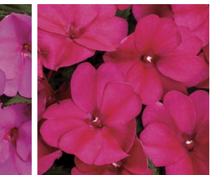
SUNPATIENS® Compact Royal Magenta Impatiens