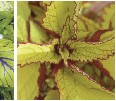
Pineapple Plectranthus (Coleus)

Spider Plant (White Edge) Chlorophytum comosum