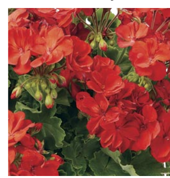
DAREDEVIL® Claret Pelargonium (Geranium)