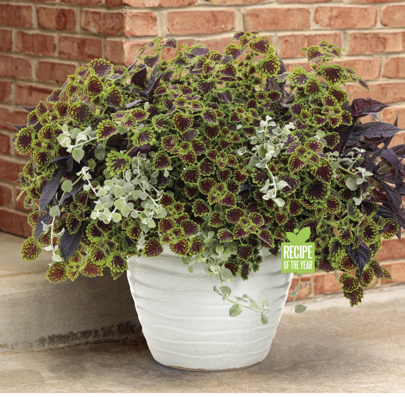
Above: Lady Luck Front cover: Blind Love