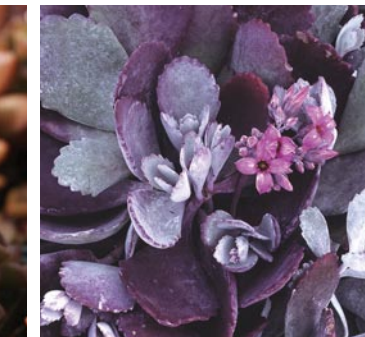
Silver Grey Kalanchoe pumila