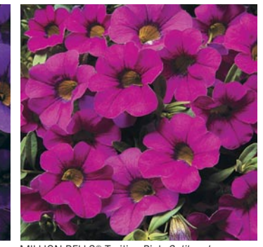
MILLION BELLS® Trailing Pink Calibrachoa