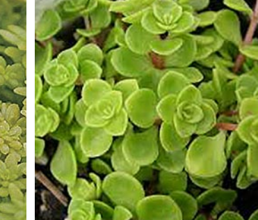
Ogon Sedum makinoi

Slightly fragrant white flowers appear on cylindrical, copper-toned foliage in January through April. Nordic