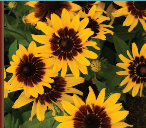
Rudbeckia hirta 'Denver Daisy'