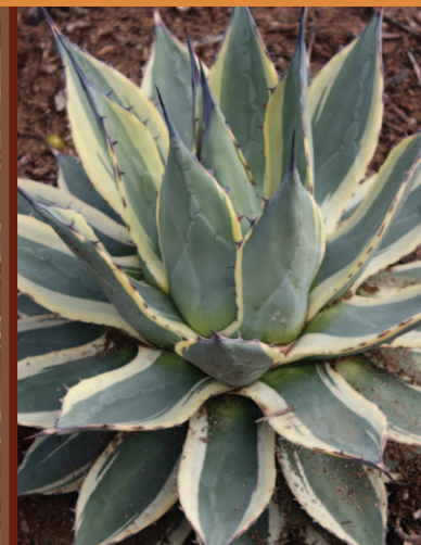
NEW Agave 'Cream Spike'