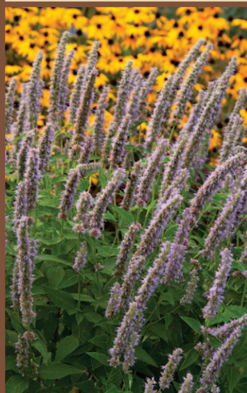
Agastache 'Blue Fortune'