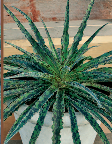
Manfreda undulata ‘Chocolate Chips’