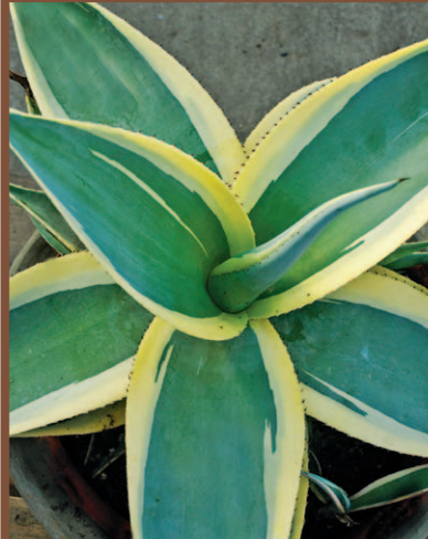
Agave guiengola 'Creme Brulee'