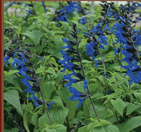
Salvia guaranitica 'Black and Blue'