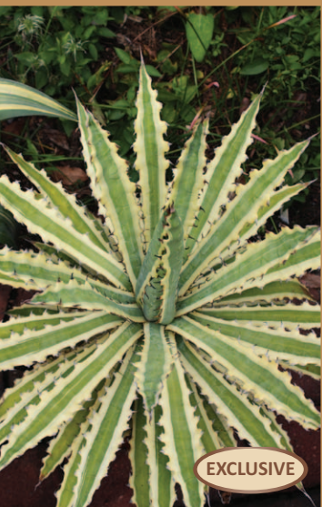
Agave xylonacantha ‘Frostbite’