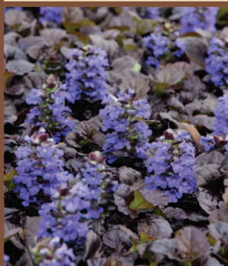
Ajuga reptans 'Black Scallop' PP15815