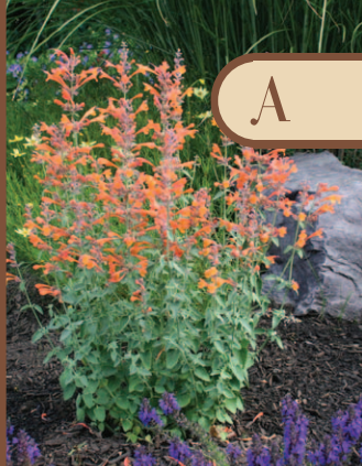
Agastache aurantiaca 'Apricot Sprite'