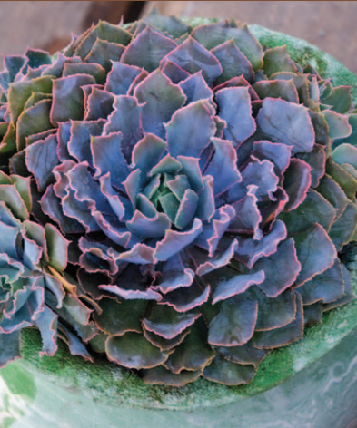
Echeveria shaviana ‘Pink Frills’