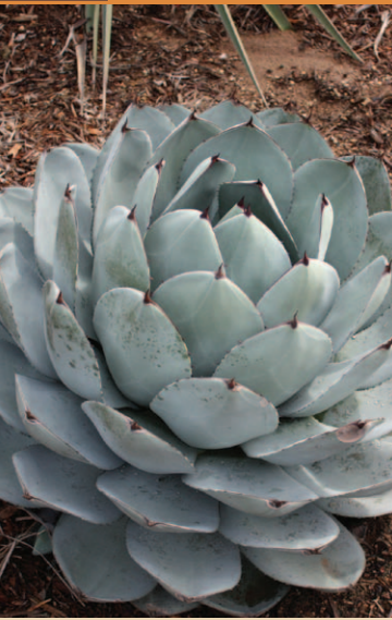
Agave parryi ssp. truncata