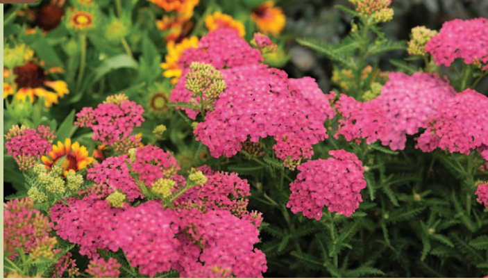
Achillea millefolium 'Saucy Seduction' PP20782