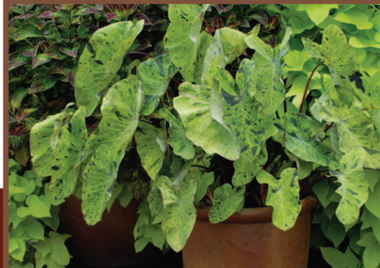
Colocasia esculenta 'Mojito' PP21995