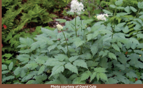
Actaea pachypoda 'Misty Blue'