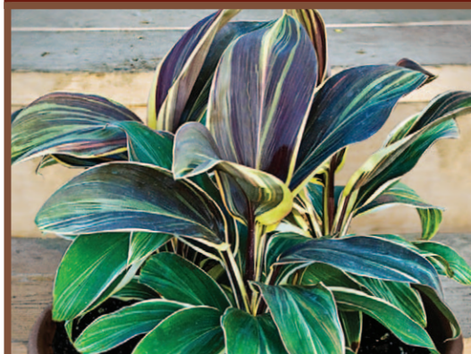
Cordyline terminalis 'Chocolate Queen'