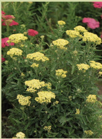
Achillea millefolium 'Sunny Seduction' PP20808