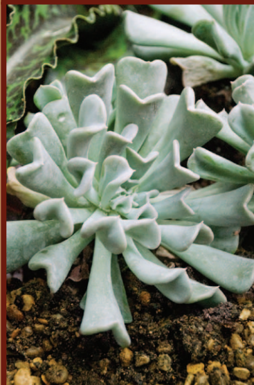
NEW Echeveria runyonii ‘Topsy Turvy’