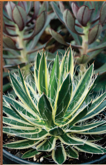
Agave schidigera Queen of White Thread (‘Shira ito no Ohi’)