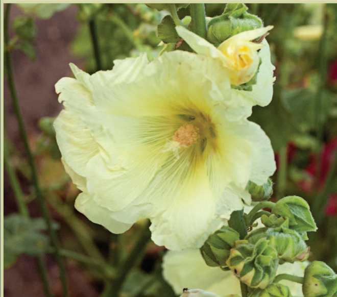
Alcea rosea 'Sunshine'