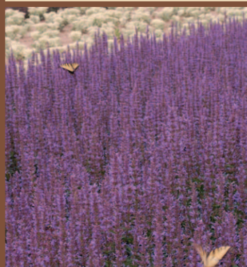
Agastache 'Purple Haze'