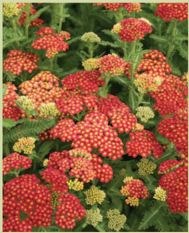
Achillea millefolium 'Strawberry Seduction' PP18401