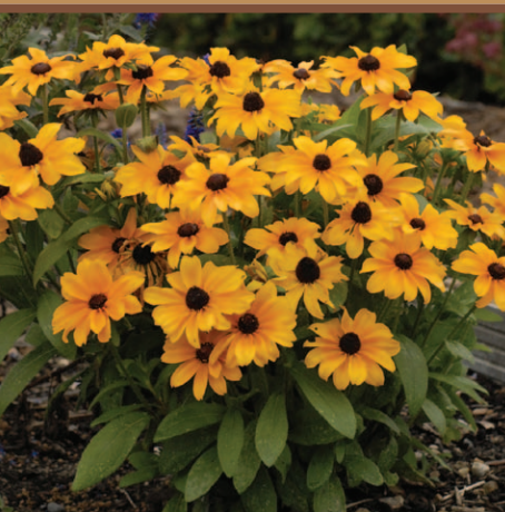
Rudbeckia TIGEREYE™ (Tiger Eye Gold)