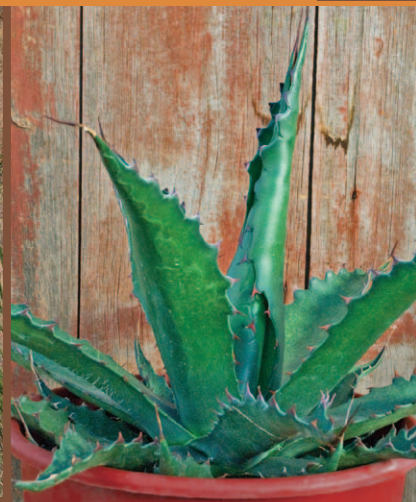
Agave gentryi 'Jaws'