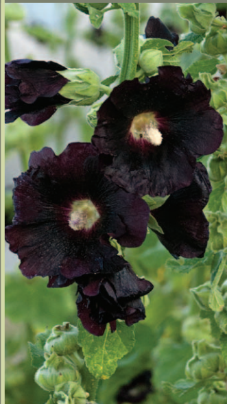
Alcea rosea 'Blacknight'