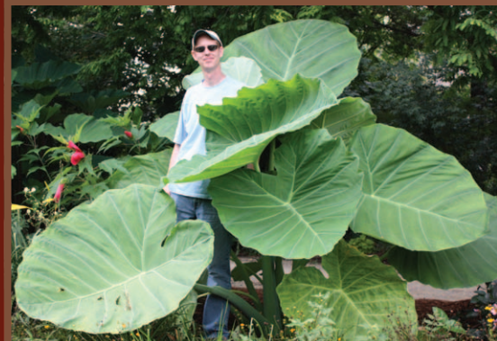
Colocasia gigantea 'Thailand Giant'