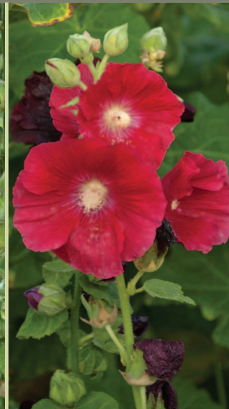
Alcea rosea 'Mars Magic'