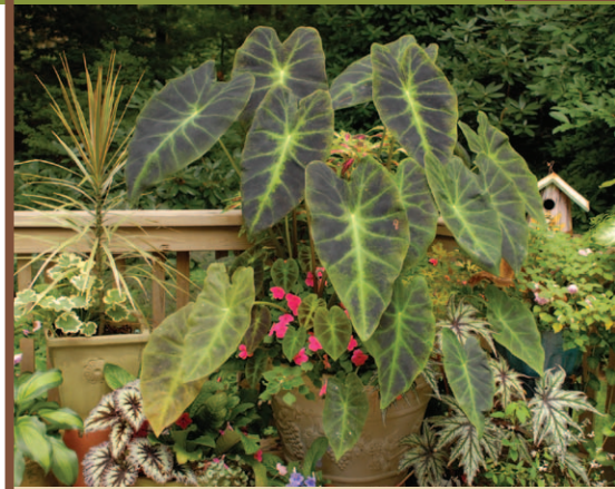
Colocasia esculenta 'Illustris'