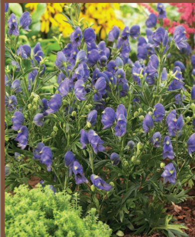
Aconitum 'Blue Lagoon'