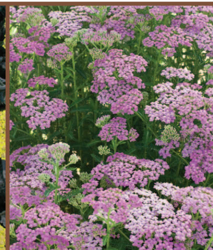
Achillea 'Pretty Belinda'