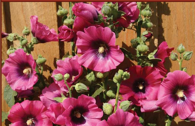
Alcea rosea Halo Series - Blush