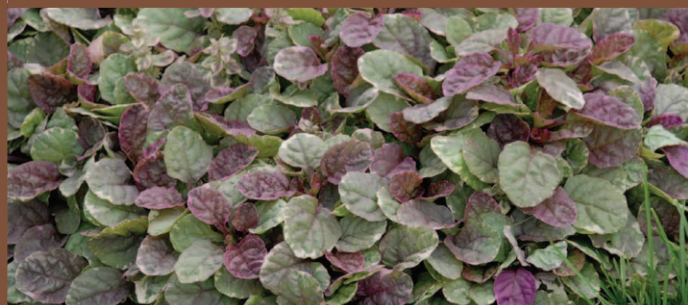
Ajuga reptans 'Burgundy Glow'