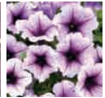
SUPERTUNIA® Bordeaux Petunia hybrid