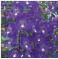
ANGELFACE® Blue Angelonia hybrid