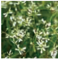
DIAMOND FROST® Euphorbia hybrid