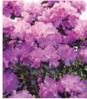
'Amy Cotta' Rhododendron