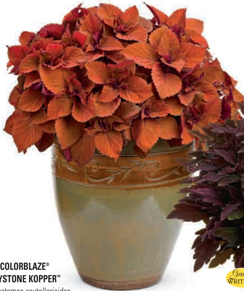
COLORBLAZE® KEYSTONE KOPPER™ Solenostemon scutellarioides