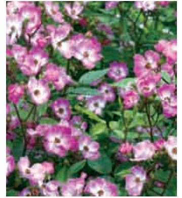
OSO HAPPY™ Smoothie Rosa