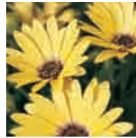
Lemon SYMPHONY Osteospermum hybrid