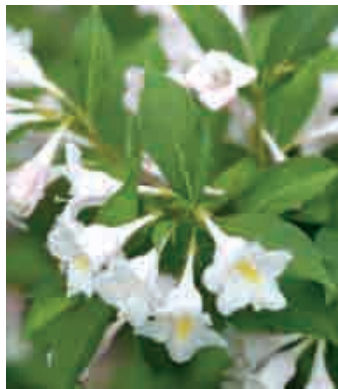
SONIC BLOOM™ Pearl Weigela florida