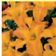
'Primal Scream' Hemerocallis