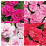
ROCKAPULCO® series Impatiens walleriana