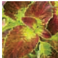
COLORBLAZE® Dipt in Wine Solenostemon scutellarioides