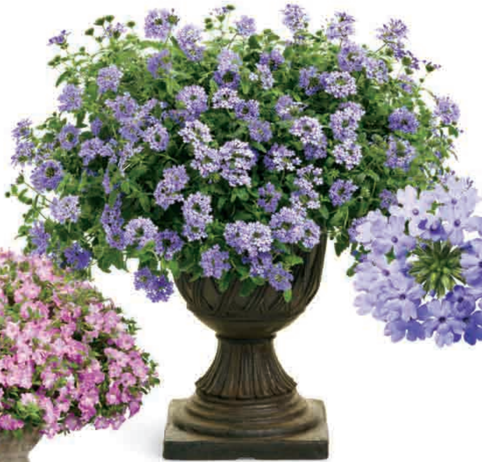
SUPERBENA® Royale Silverdust Verbena hybrid