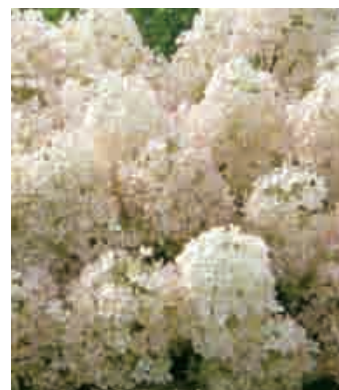
BOBO™ Hydrangea paniculata