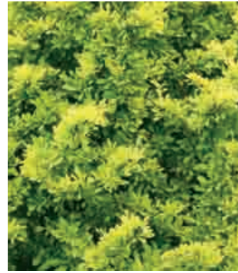
SUNJOY® Citrus Berberis thunbergii