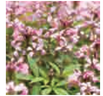
SEÑORITA ROSALITA® Cleome hybrid