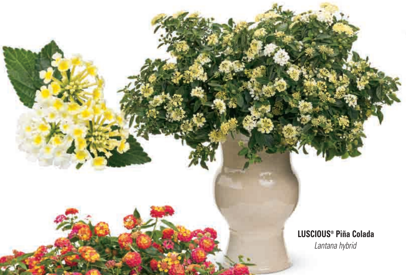
LUSCIOUS® Piña Colada Lantana hybrid