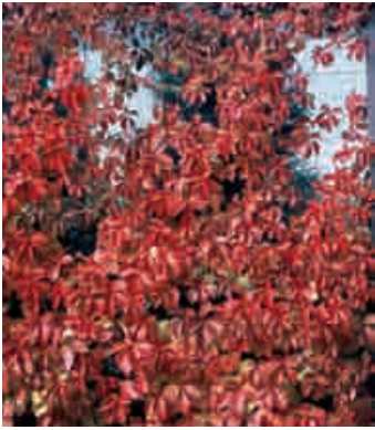
RED WALL™ Parthenocissus quinquefolia