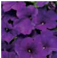
SUPERTUNIA® Royal Velvet Petunia hybrid