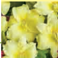
'Going Bananas' Hemerocallis