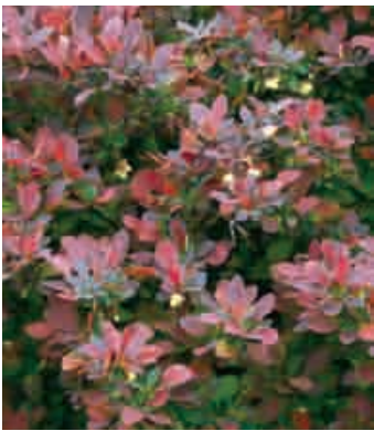
SUNJOY® Mini Salsa Berberis thunbergii