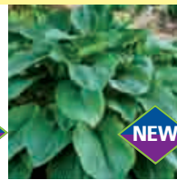
'Empress Wu' Hosta