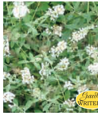
LO & BEHOLD® 'Ice Chip' Buddleia