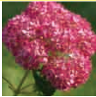
INVINCIBELLE® Spirit Hydrangea aborescens