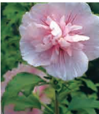
PINK CHIFFON™ Hibiscus syriacus