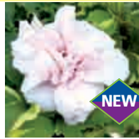
SUGAR TIP® Hibiscus syriacus