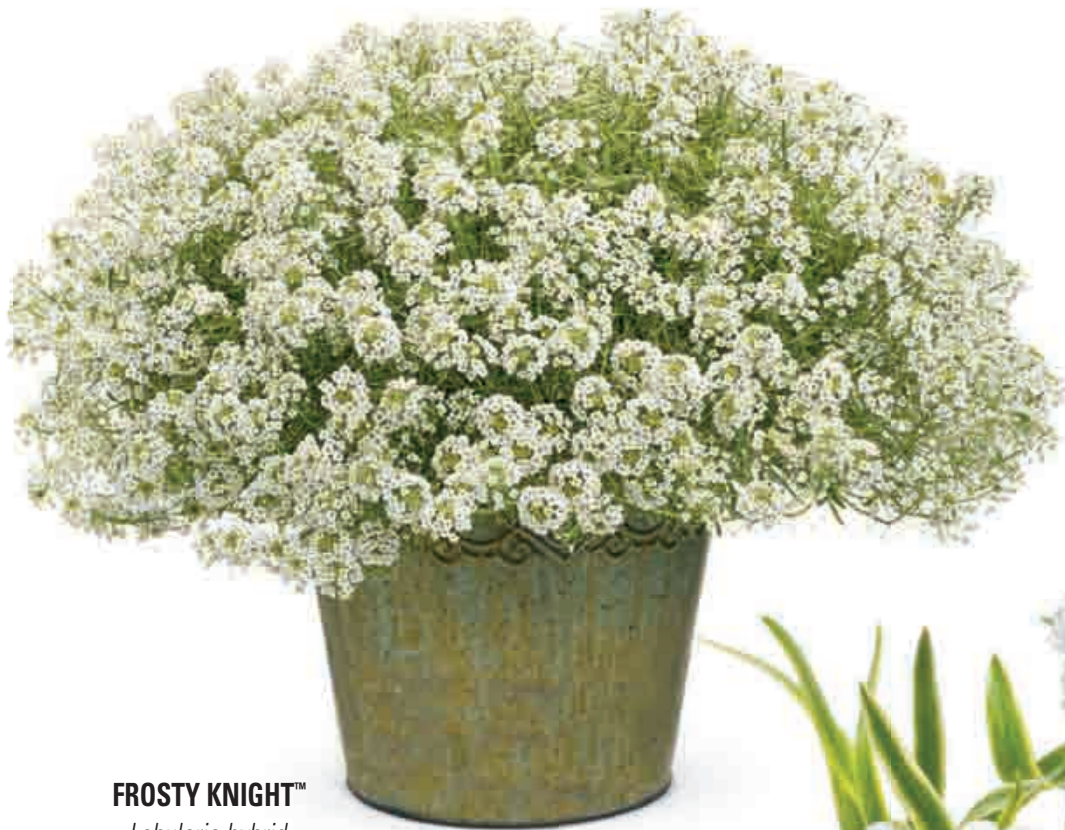
FROSTY KNIGHT™ Lobularia hybrid