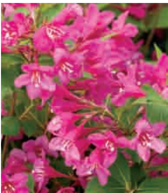
SONIC BLOOM™ Pink Weigela florida