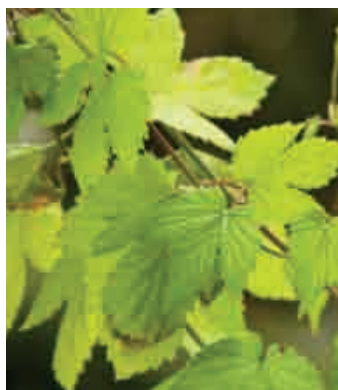
SUMMER SHANDY™ Humulus