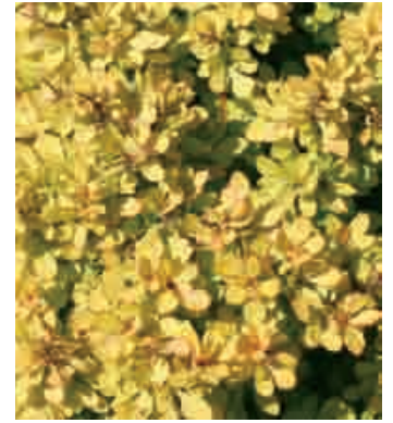
SUNJOY® Mini Saffron Berberis thunbergii