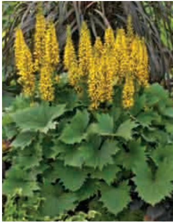
'Bottle Rocket' Ligularia