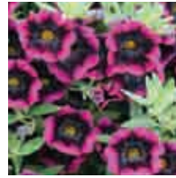
SUPERBELLS® Blackberry Punch Calibrachoa hybrid