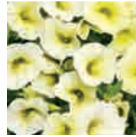
SUPERBELLS® Yellow Chiffon Calibrachoa hybrid