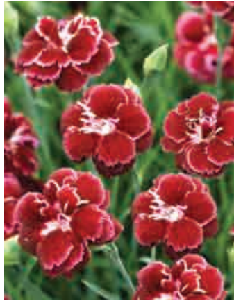
FRUIT PUNCH® 'Black Berry Wild' Dianthus