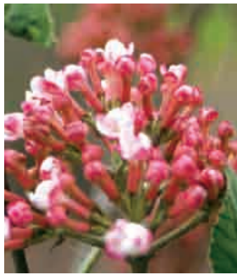
SPICE GIRL™ Viburnum carlesii