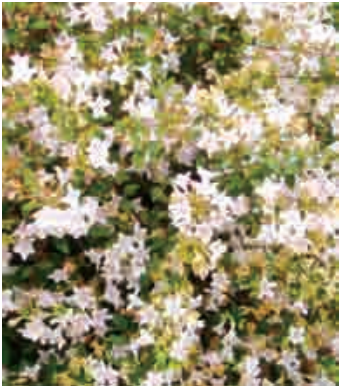
PINKY BELLS™ Abelia