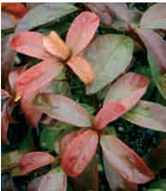
HANDSOME DEVIL™ Viburnum