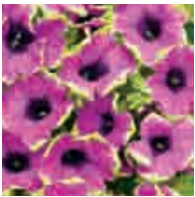
SUPERTUNIA® PRETTY MUCH PICASSO® Petunia hybrid