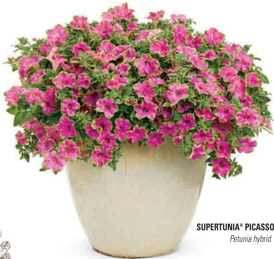
SUPERTUNIA® PICASSO IN PINK™ Petunia hybrid