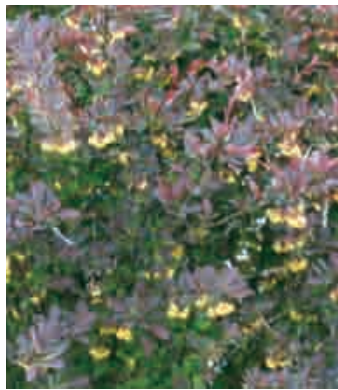
SUNJOY® Syrah Berberis thunbergii