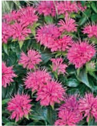
'Pardon My Pink' Monarda didyma