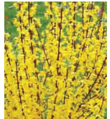
SHOW OFF™ Sugar Baby Forsythia