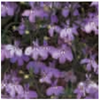
LAGUNA™ Sky Blue Lobelia hybrid