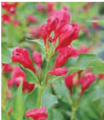
SONIC BLOOM™ Red Weigela florida