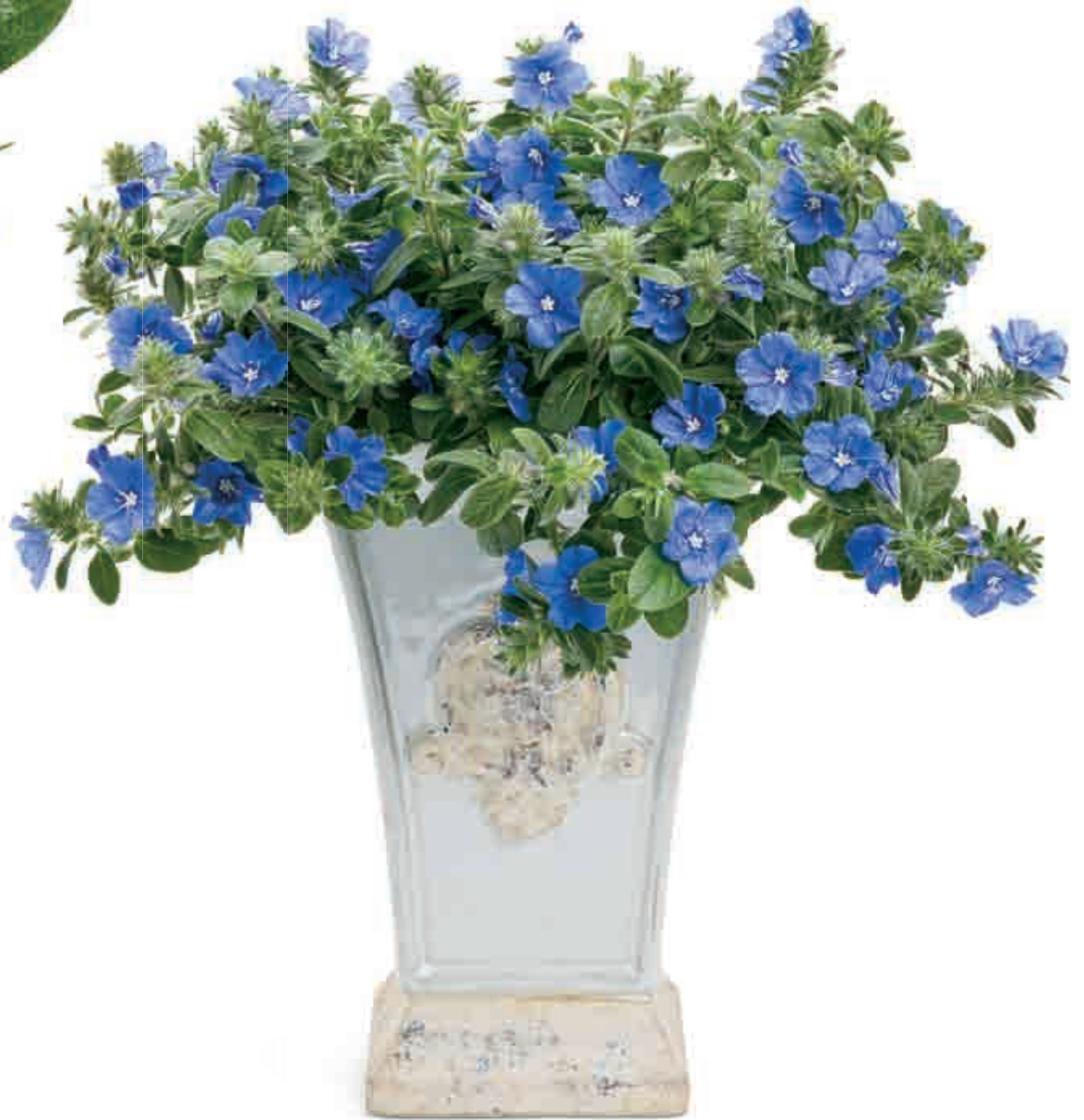
BLUE MY MIND™ Evolvulus hybrid