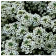
SNOW PRINCESS® Lobularia hybrid