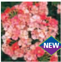
SUPERBENA® Royale Peachy Keen Verbena hybrid