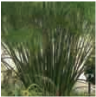
GRACEFUL GRASSES® KING TUT® Cyperus papyrus