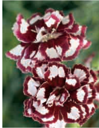
FRUIT PUNCH® 'Coconut Punch' Dianthus