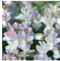
Opal INNOCENCE® Nemesia fruticans hybrid