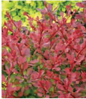
SUNJOY® Cinnamon Berberis thunbergii