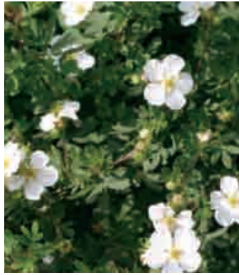
HAPPY FACE™ White Potentilla fruticosa