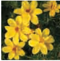
GOLDILOCKS ROCKS™ Bidens hybrid