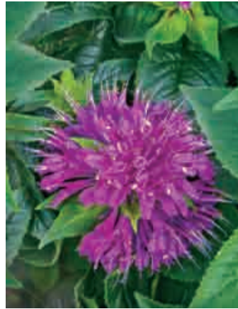
'Pardon My Purple' Monarda didyma