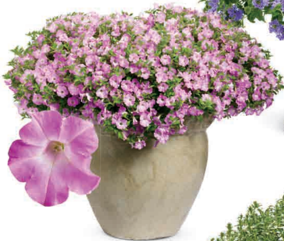
SUPERTUNIA® Pink Charm Petunia hybrid