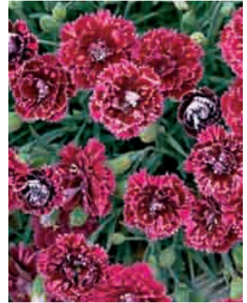
FRUIT PUNCH® 'Pomegranate Kiss' Dianthus