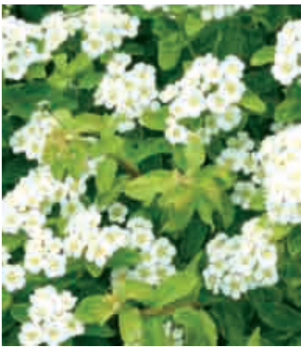
GOLDEN GLITTER® Spiraea nipponica