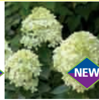
LITTLE LIME® Hydrangea paniculata