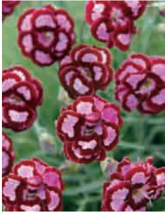
FRUIT PUNCH® 'Apple Slice' Dianthus