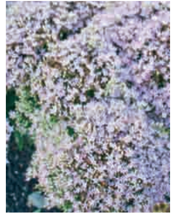
'Pure Joy' Sedum