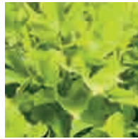
'Sweet Caroline Light Green' Ipomoea batatas