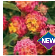
LUSCIOUS® BERRY BLEND™ Lantana hybrid