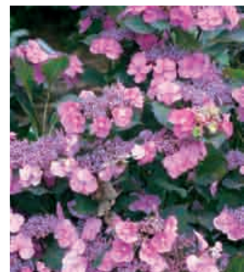
TUFF STUFF™ Hydrangea serrata