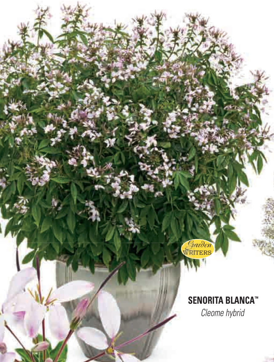
SENORITA BLANCA™ Cleome hybrid