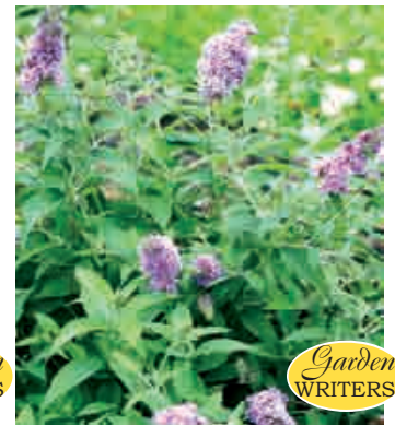
LO & BEHOLD® 'Lilac Chip' Buddleia