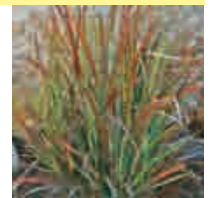
'Cheyenne Sky' Panicum