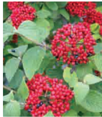
RED BALLOON™ Viburnum