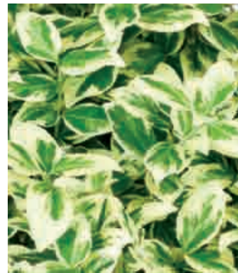
WHITE ALBUM™ Euonymus fortunei