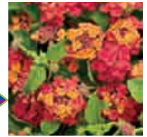
LUSCIOUS® CITRUS BLEND™ Lantana hybrid