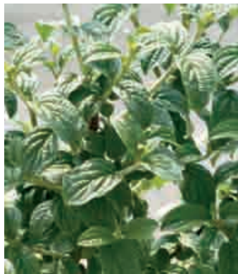
PUCKER UP!™ Cornus stolonifera