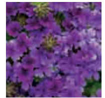
SUPERBENA® Royale Chambray Verbena hybrid