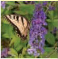
LO & BEHOLD® Buddleia x 'Blue Chip'