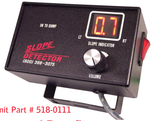
Cab Unit Part # 518-0111