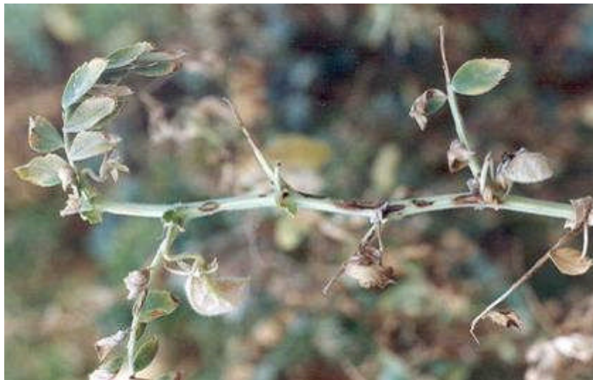
Typical stem lesions caused by Ascochyta infection. Stems break at lesions and wither.