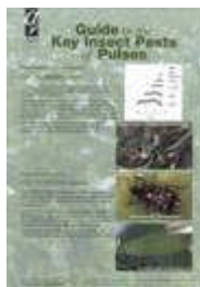
Guide to the key pests of Pulses click here .

Management involves controlling the moths before they lay eggs. The slender bodied moth has a distinct beak. The wings are grey with a white streak along the front and a yellow band near the base. The wingspan is 2 cm.