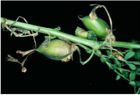
Comparison of stem infection caused by sclerotinia (top) and botrytis (lower). Note different colour of fungal growth.