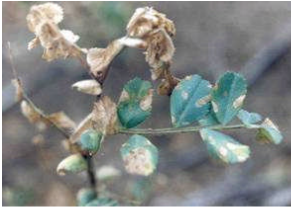
Typical leaf lesions, these are seen as round spots with brown margins. Small dark specks (fruiting bodies) are often present