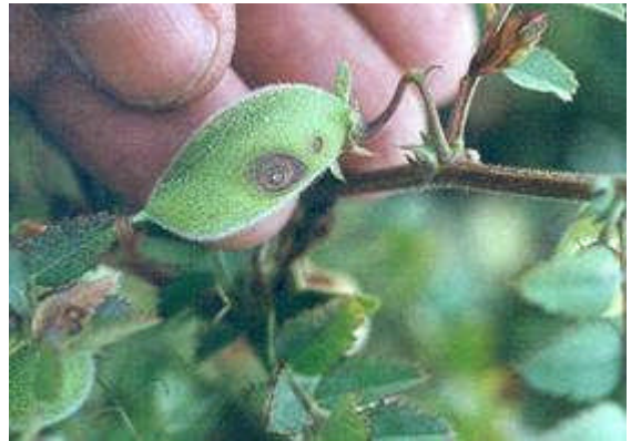
Ascochyta infected pod