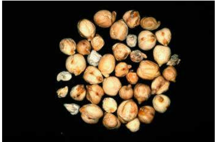
Botrytis infected pod stem and pod. Seed discolouration caused by botrytis infection.