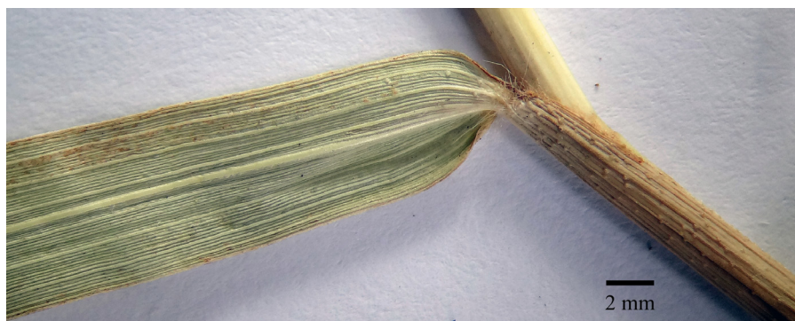
Fig. 3. Eulalia simonii . Abaxial leaf surface and leaf sheath ( Ridley BES 00767 , PERTH).