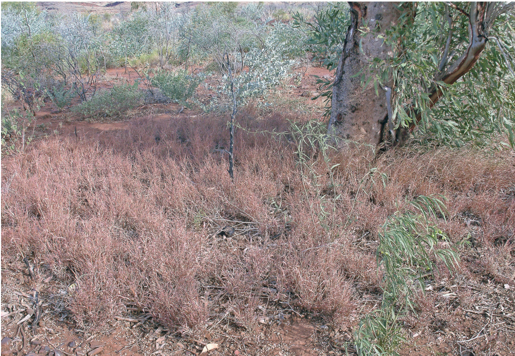
Fig. 7. Eulalia simonii , showing tussocks that are linked by rhizomes ( cf. Fig. 8 ), the reddish colour that its leaves turn to as the environment dries and the habitat on the narrow floodplain of a creek, c. 70 km NW of Wittenoom.

Etymology: The new species is named for the late Bryan Simon (1943–2015) who made significant contributions to the taxonomy of Australian grasses during his long and successful career.