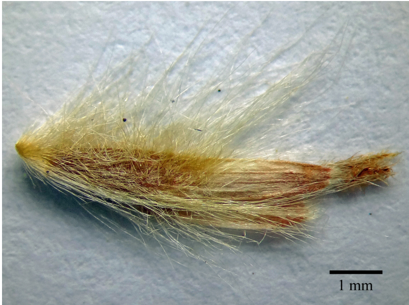
Fig. 5. Eulalia simonii . Pedicellate spikelet (Ridley BES 00767, PERTH).

Affinities: Eulalia simonii has a quite different form to Australian material referred to as E. aurea . It forms clonal patches to more than 3 m across of small tussocks joined by long underground rhizomes (Fig. 8). The individual tussocks are fewer culmed and shorter than those of E. aurea , which in the Pilbara usually occurs as single tussocks, not in patches. The broader leaves of E. simonii that become prominently curled on maturity easily distinguish it from other Pilbara Eulalia material, as do the paler, more robust and more densely hairy inflorescences with shorter or no visible awns.