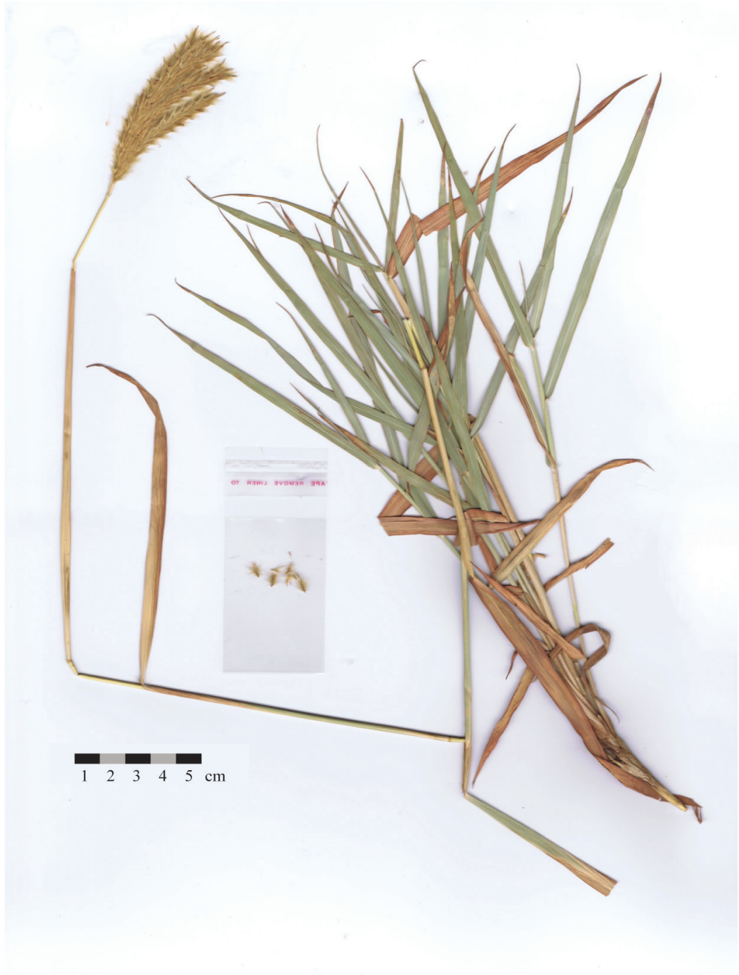
Fig. 1. Specimen of Eulalia simonii (Venkatasamy & Colwill BES 00303, PERTH).