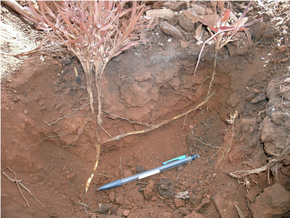
Fig. 8. Eulalia simonii . Elongated rhizomes and clusters of culms of plants, c. 70 km NW of Wittenoom. See Fig. 7 for habitat photo from the same location.