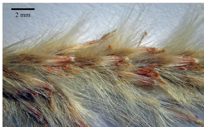
Fig. 4. Eulalia simonii . Part of inflorescence ( Ridley BES 00767 , PERTH).