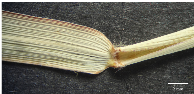
Fig. 2. Eulalia simonii . Ligule and adaxial leaf surface ( Ridley BES 00767 , PERTH).