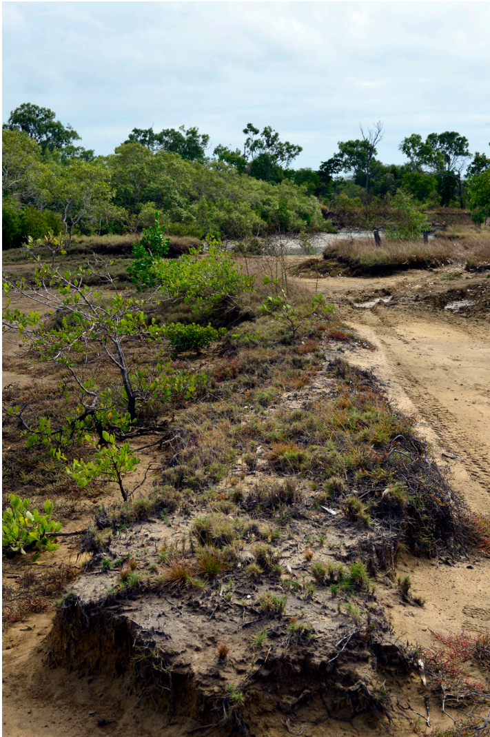
Fig. 2. Typical habitat of Calandrinia halophila . Bushland Beach, Townsville ( Horsfall s.n. , CANB 955859).