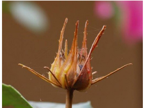
Fig. 7. Hibiscus graniticus . Calyx in fruit (Wannan 7043, CNS).