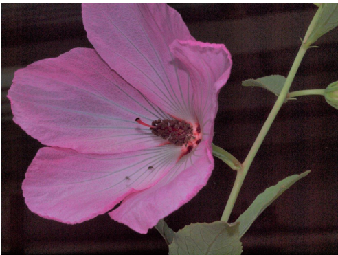
Fig. 5. Hibiscus graniticus . Flower showing stamens and ovary as well as stipules ex horto (Wannan 6426, CNS).