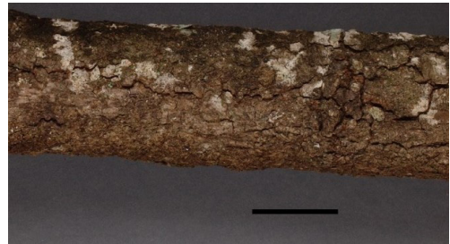
Fig. 1. Hibiscus graniticus . Stem showing bark ( Wannan 6426 , CNS). Scale of 20 mm.

Etymology: The Latin species epithet refers to the granite substrate on which it occurs.