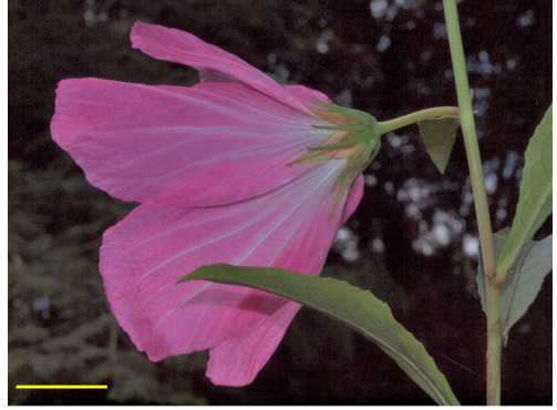
Fig. 6. Hibiscus graniticus . Flower showing calyx, epicalyx, pedicel ex horto (Wannan 6426, CNS). Scale of 20 mm.