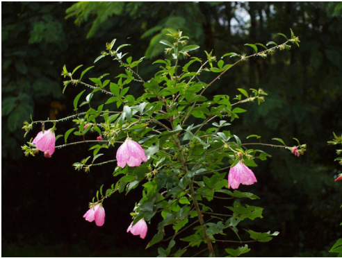
Fig. 4. Hibiscus graniticus . Habit with lower climax leaves and flowering shoots with flowers and distal leaves (unvouchered ex horto Speewah grown from Wannan 5990, BRI, NSW).