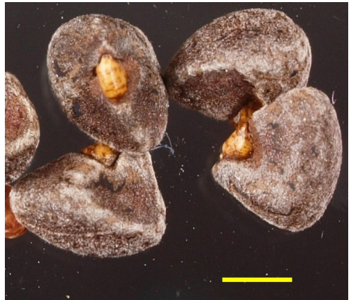
Fig. 8. Hibiscus graniticus . Seeds (Wannan 7043, CNS). Scale of 2 mm.