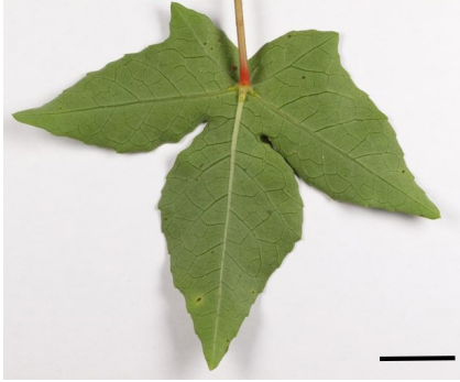
Fig. 3. Hibiscus graniticus . Abaxial surface of climax leaf with nectaries (Wannan 7043, CNS). Scale of 20 mm.