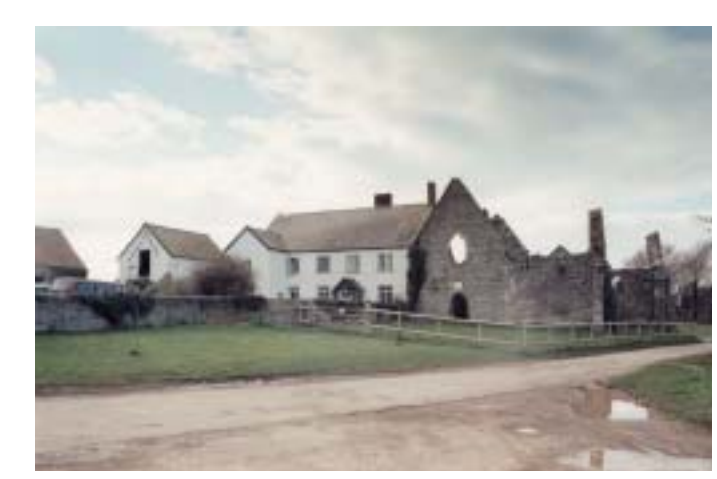
Kilve in the early 21st century. (AA 048499) from the building, together with studies of historic maps and documents has allowed us to re-create the manor house and its enclosure as it may have looked in the early 14th century. At the heart of the house was the great hall, open to the roof. At the upper end of the hall were apartments for the lord and his family, including a private chapel. To the lower end of the hall and screened from the hall by a wooden partition, was the service accommodation and a kitchen, detached from the main building because of the risk of fire. The manor house lay within an enclosure, often defined by water: at Kilve, streams and large fish ponds formed part of the boundary.

The evidence for the medieval landscape of the Quantock Hills is rich and diverse. The wealth of the landowning families is reflected in the surviving medieval fabric of churches, chapels and manor houses. At Kilve a substantial part of the late 13thor early 14th-century manor house still stands. The evidence