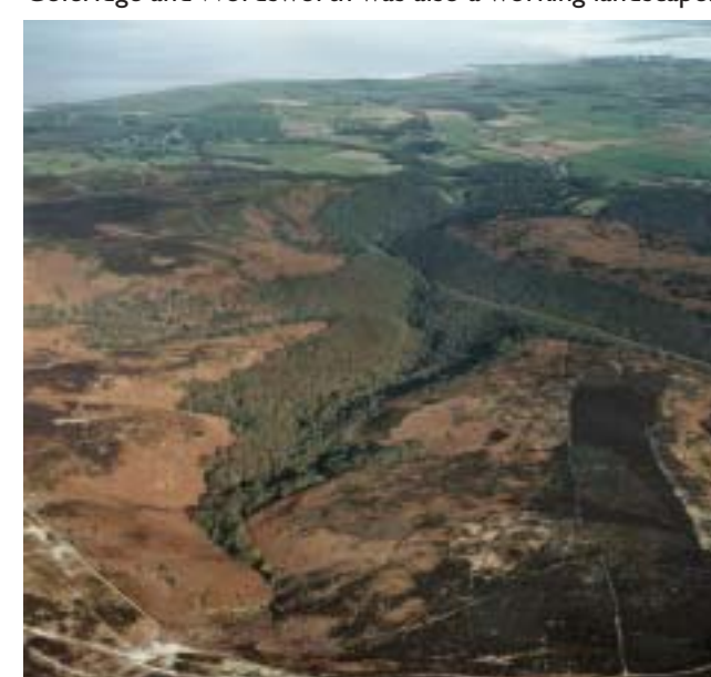
Open heath gives way to woodland on Black Ball Hill and Slaughterhouse Combe. (NMR 2195/07)

The post-medieval landscape is one of contrasts. The tranquil landscape which inspired the Romantic poets Coleridge and Wordsworth was also a working landscape.