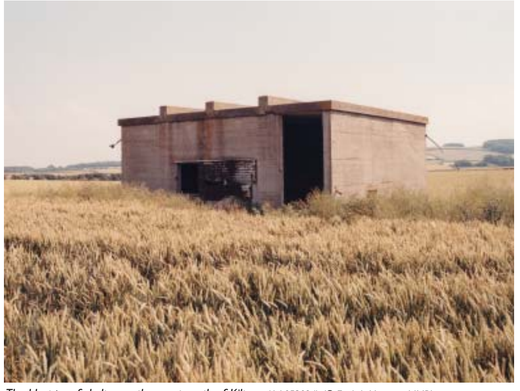
The blast-proof shelter on the coast north of Kilton. (AA053024)

The Quantock Hills became the temporary home for troops from north America and many Italian and German PoWs during the Second World War, with large camps at Crowcombe Heathfield and Goathurst.