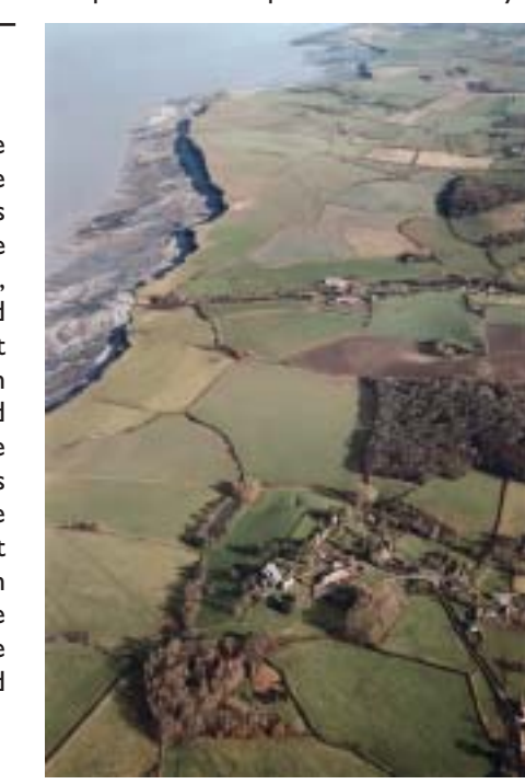
The manors of East Quantoxhead bottom) and Kilve (centre) on the (NMR 21902/24)