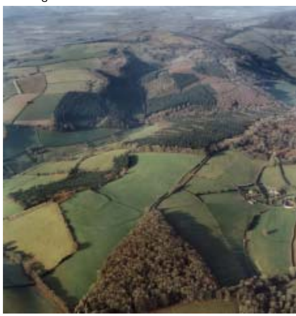
(NMR 21531/04)

The Quantock Hills contain a large number of enclosures which date from the later Bronze Age, the Iron Age and Roman periods. Some of these enclosures are the well known hillforts which survive as earthworks at Dowsborough Camp and Ruborough Camp. As well as functioning as places of refuge in times of stress, the investment in labour required to construct the hillfort earthworks meant that they were also symbols of power and prestige. Many of the smaller enclosures were settlements, containing houses and agricultural buildings, or stock enclosures, others were concerned with ritual. The large numbers of sites which survive on the southern