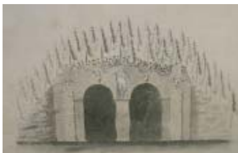
The grotto at Terhill Park, shown on an 18th-century map.

Charcoal burners at work in Slaughterhouse Combe.