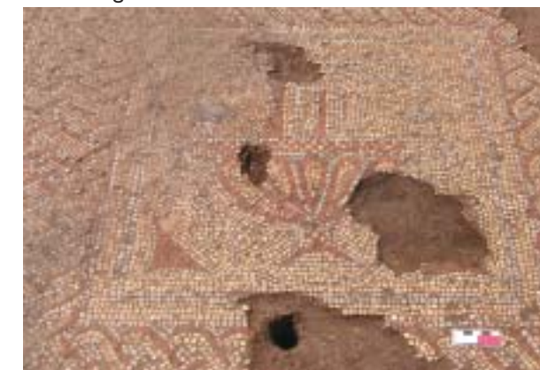
The central part of the Roman mosaic at Yarford.

edge of the Quantock Hills, around Broomfield and Kingston St Mary, both as earthworks and as cropmarks, visible on air photographs, show that the landscape was well-populated here by the end of the first millennium BC. The people who lived and worked on the hills were self-sufficient farmers who kept cattle, sheep and pigs and grew arable crops. Some were craftsmen, specialists in making pottery, jewellery, or iron tools. The presence of small deposits of iron and copper ore in the area around Broomfield and Kingston St Mary, the fertile south-facing slopes and the fast-flowing streams which drain the combes made the southern edge of the Quantock Hills attractive to Iron Age and Roman farmers.