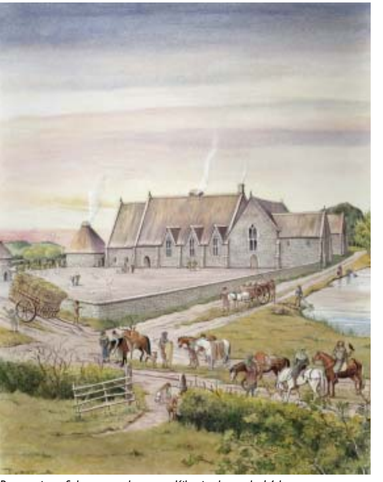
Re-creation of the manor house at Kilve in the early 14th century.

ROMAN SITES AND FINDS When some of the cropmark enclosures were excavated as part of a project carried out by the University of Winchester, the results were often surprising. A Roman villa, complete with mosaic floor, was uncovered on the edge of an Iron Age enclosure at Yarford near Kingston St Mary. This is one of the most westerly Roman villas in Britain and its discovery has doubled the number of known Roman villas on and around the Quantocks (the other is near Spaxton). The main room of the villa had a mosaic floor with a cantharus motif (wine-mixing vessel), associated with Bacchus and appropriate for the dining room. An archway probably opened from this room onto a terrace, with stunning views over the Vale of Taunton beyond. The Yarford mosaic dates from the 4th century AD, and was perhaps made by artisans from the workshops at Ilchester. A further recent discovery of a large hoard of Roman silver, including coins dating from the 4th century AD, near West Bagborough, has, like the Yarford villa, added significantly to our knowledge of the Roman period in the Quantock Hills.