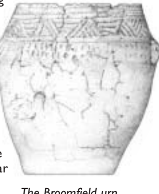
The Broomfield urn. (Elaine Jamieson)

south-west have shown that ring cairns were not used for burial but some other ritual connected with the funeral ceremony was carried out at these sites. Did they mark the site of the funeral pyre itself? Cremation burial was the usual form of interment during the Bronze Age and the cremated remains were often placed in urns like the one found in a ploughed field near Broomfield.