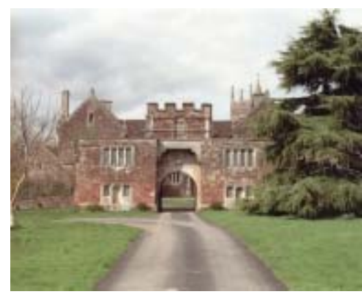
The gatehouse at Cothelstone Manor. (AA048455)

remains of 18th- and 19th-century designed landscapes, laid out with such vigour by the gentleman of the day. Buildings such as the gothic folly in Crowcombe Park and the grotto at Terhill served as destinations for a stroll or carriage drive, or as a place for secret assignations after dark. Attention was drawn to the landscape itself by planting clumps of beech trees and by building tall towers in prominent places, like the Seven Sisters and the Beacon Tower on Cothelstone Hill.