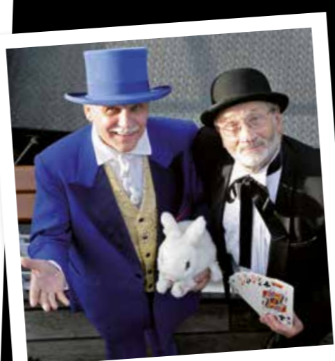
TABLE MAGIC, ILLUSIONIST & MINDREADING