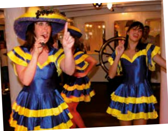
SUMMER CRUISE CARNIVAL