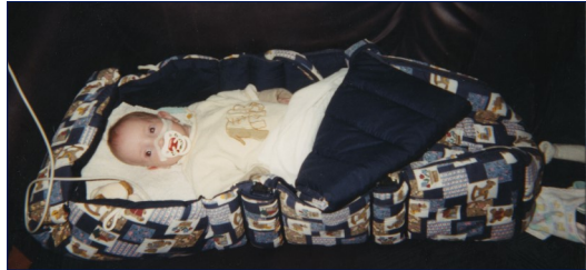
6 months old

without any aids, but he had a relapse. He didn't want to eat because we had probably pushed him too hard and his outlook on eating became very negative. He then practically starved himself by being 'scared' of food. We then decided, with the paediatrician, to have a gastrostomy placed (a tube is placed so that food arrives directly in the stomach). This turned out to be the ideal solution, as it was invisible and it didn't hurt. He fed through this tube until his fourth year of life. During this period, with his school, we taught him to eat normally. This was a huge struggle, but we did it. Now he is eating well and with pleasure and likes to taste new things.” Age 4 years