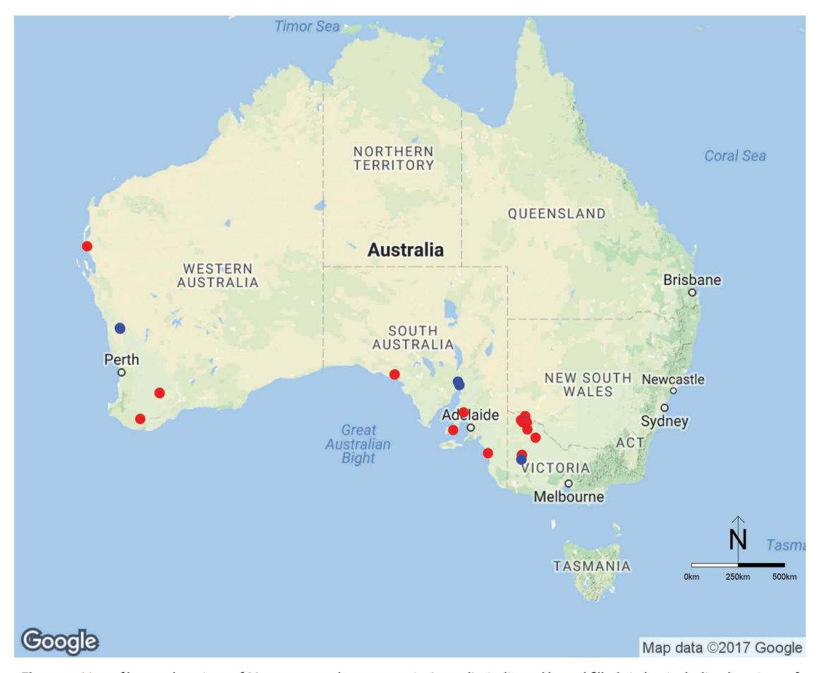
Figure 1. Map of known locations of Monocarpus sphaerocarpus in Australia, indicated by red filled circles, including locations of populations sampled for this study as blue filled circles

Samples of Monocarpus sphaerocarpus were obtained from a number of recent collections from previously known localities in Western Australia and Victoria, as well as from two new localities in South Australia (see Table 1). In total, 12 new samples were collected (five from Western Australia, five from Victoria and two from South Australia) and compared to a previously studied specimen from Western Australia (Forrest et al. 2015). DNA extractions were performed using a Qiagen DNeasy Plant Mini kit following the manufacturer's instructions (Qiagen, Melbourne, Victoria, Australia). Five plastid gene regions were amplified: rbcL , rpoC 1,