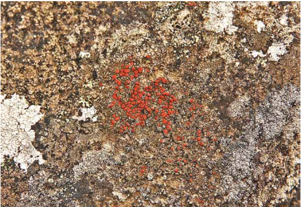
Figure 2. Ramboldia greeniana (red apothecia) habitat on dolerite boulders, associated with numerous other crustose lichens.