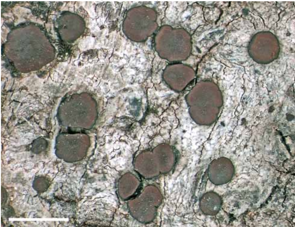
Figure 1. Ramboldia atromarginata (holotype) habit, showing biatorine apothecia with a red-brown disc and diagnostic blackish margin. Scale = 1 mm.

Thallus crustose, dull grey, grey-brown to olive-brown, frequently in part overgrown by blackish cyanobacteria, verruculose to papillate to \pm isidiate, mostly rather