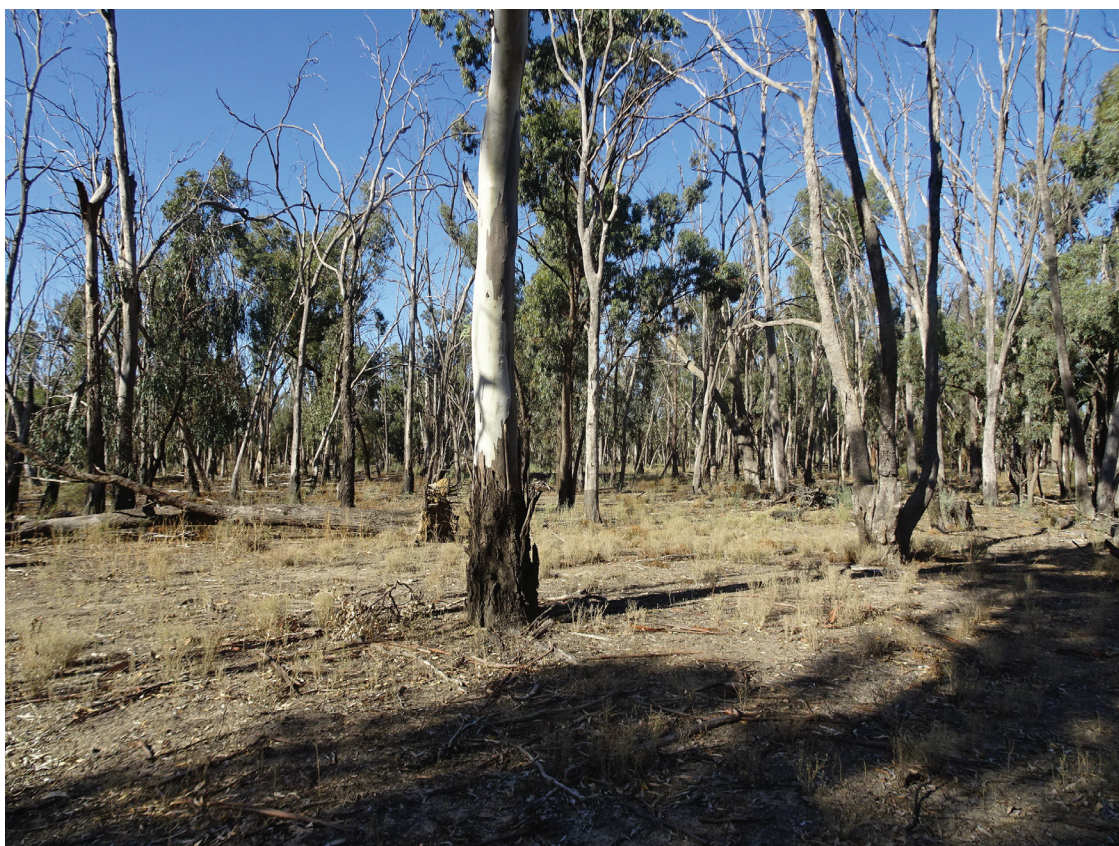
Figure 4. Pterocaulon sphacelatum habitat on a river terrace in Intermittent Swampy Woodland near Raak Track and Chalka Creek SE of Colignan, Murray-Kulkyne Park.

Australian Pterocaulon species (Bean 2011). It grows on a range of sandy to clay-loam soils, on stony hillsides (higher rainfall areas) or creek-beds (arid areas), in grassland (often dominated by Triodia spp.), eucalypt woodland, or low open woodland with Mulga ( Acacia aneura F.Muell. ex Benth.) and other Acacia spp. The species is common in areas subject to flooding (Cunningham et al. 1992). Based on herbarium collections, the closest known occurrence of this species to the Victorian one is a single 1976 collection (NSW582322) from the Wentworth district in New South Wales. There are also herbarium collections from Scotia Sanctuary in New South Wales in 2011, and from Danggali Conservation Park and Wilderness Protection Area in South Australia in 1980. In 2011/12, following heavy La Niña rainfall events across south-west New South Wales, Pterocaulon sphacelatum was observed to germinate in a flooded run-on depression herbland/grassland covering approximately five hectares at a