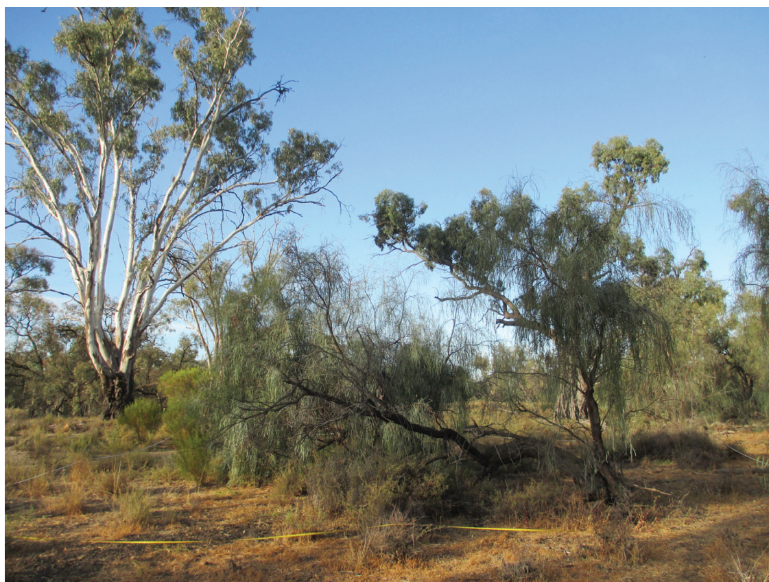
Figure 3. Pluchea rubelliflora habitat on the higher floodplain in Intermittent Swampy Woodland at Lake Yelwell, Hattah-Kulkyne National Park

In the spring and summer of 2017/2018, a large environmental watering event inundated this site (to an elevation of 45 m above sea level). The two previous flood events in the spring/summer of 2014/15 and 2016/17 did not reach this part of the site which occurs on the higher elevation floodplain. Indeed, it is probable that inundation from the 2017/2018 environmental watering event stimulated seed germination from the soil seed bank, although studies would need to confirm the species presence in the soil seed bank. While little information is available on the seed dispersal of P. rubelliflora , other species within the genus (e.g. P. carolinensis (Jacq.) G.Don, P. dentata R.Br. ex Benth., P. indica (L.) Less., P. odorata (L.) Cass. and P. rosea Godfrey) are wind dispersed (Jurado et al.