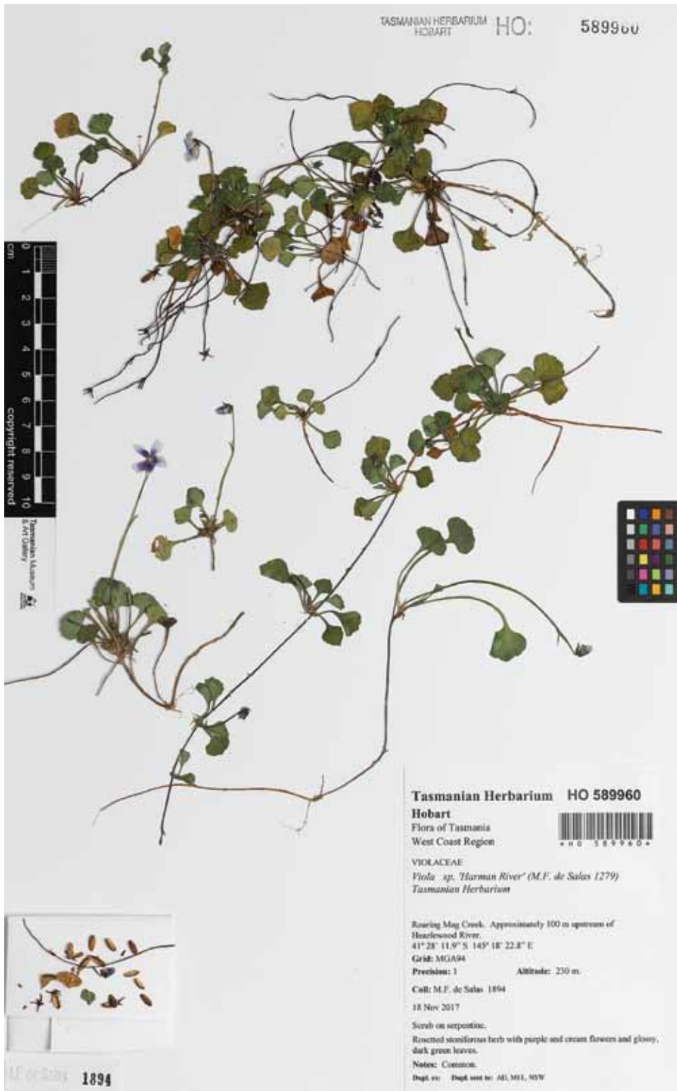
Figure 2. Holotype of V. serpenticola (HO589960)