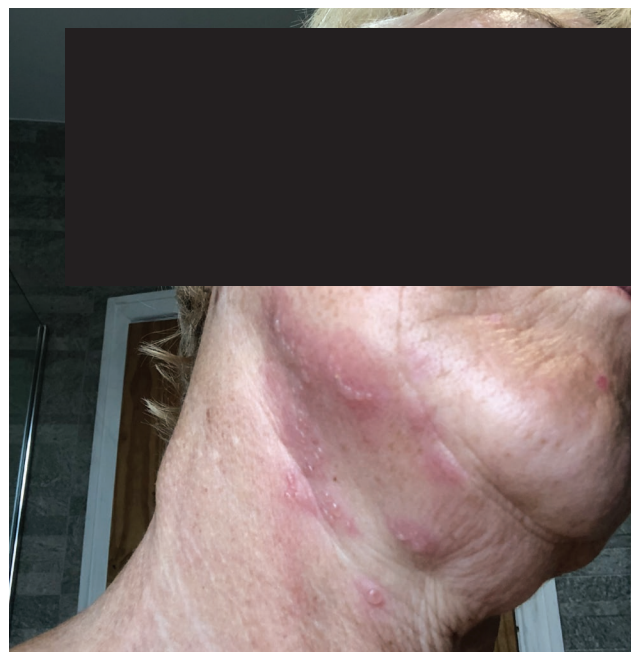
Figure 1 Submental vesicular rash in distribution of right C2 dermatome

This case raises a number of interesting issues. Firstly, it provides a nice clinic-anatomical correlation illustrating