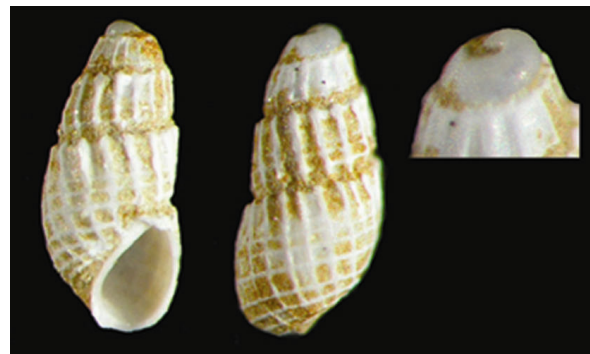
Figure 3. Chrysallida micronana : the specimen from Güllük Bay (station 1) (h= 1.4 mm).

shellgrit). The largest one of these with a shell of 1.41 mm in height, the body whorl and the aperture respectively 890 \mu m and 530 \mu m in height and a maximum diameter of 630 \mu m. Terminology used for the description of the species follows Aartsen (1987) and Peñas et al. (1996).