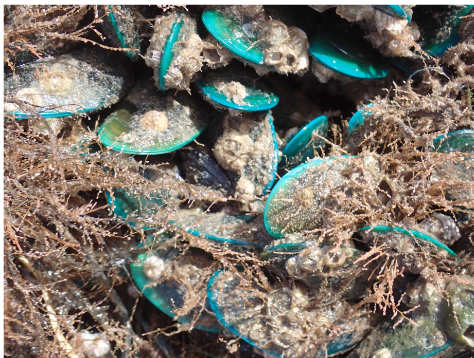
Figure 2. Mixture of Mytella strigata and Perna viridis on a rope at Bird Island, upper Gulf of Thailand in August 2023.