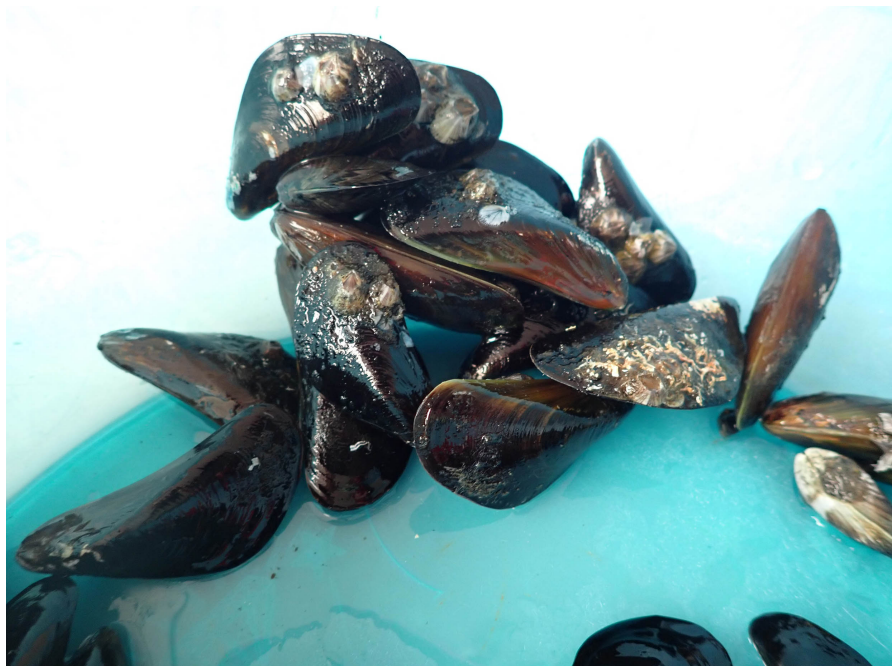
Figure 4. Mytella strigata from the aquaculture pond at Samut Sakon.